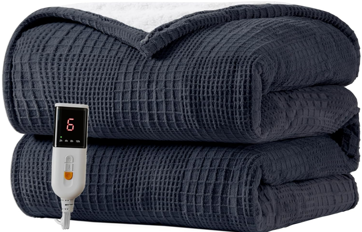
Image 1.1: The Texciting Heated Blanket, folded, with its attached digital controller.

This electric throw is designed to provide warmth and comfort with adjustable heat settings and an automatic shut-off feature for safety and convenience.