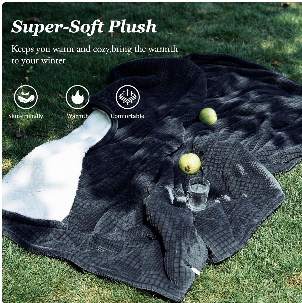
Image 6.1: The heated blanket is machine washable after disconnecting the controller.

Proper care ensures the longevity and performance of your heated blanket. Always follow these instructions carefully.