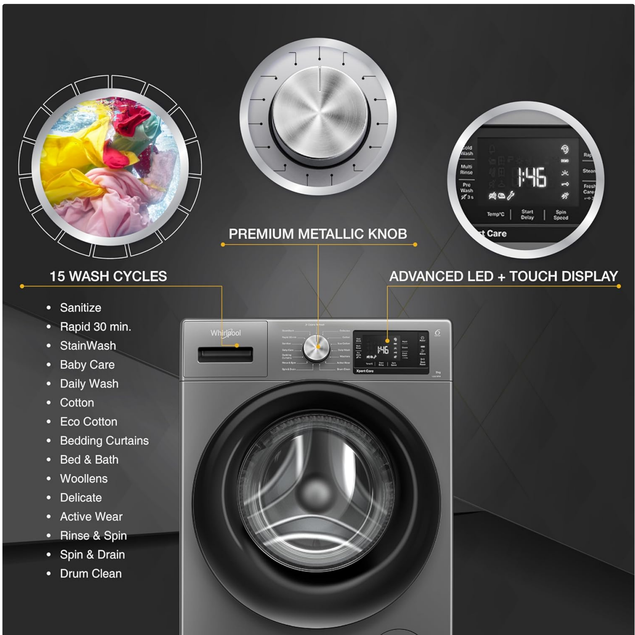
Figure 3: Detailed view of the control panel, showing the metallic knob and LED display.

The control panel features an On/Off button, Start/Pause button, and an LED display providing information about the selected program and cycle status. The premium metallic knob allows for easy selection of wash programs.