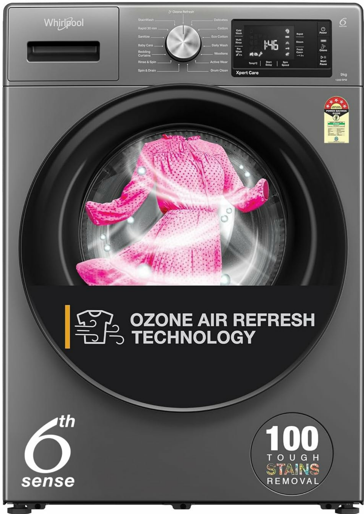
Figure 1: Front view of the Whirlpool 9 Kg Front Load Washing Machine, highlighting Ozone Air Refresh Technology.