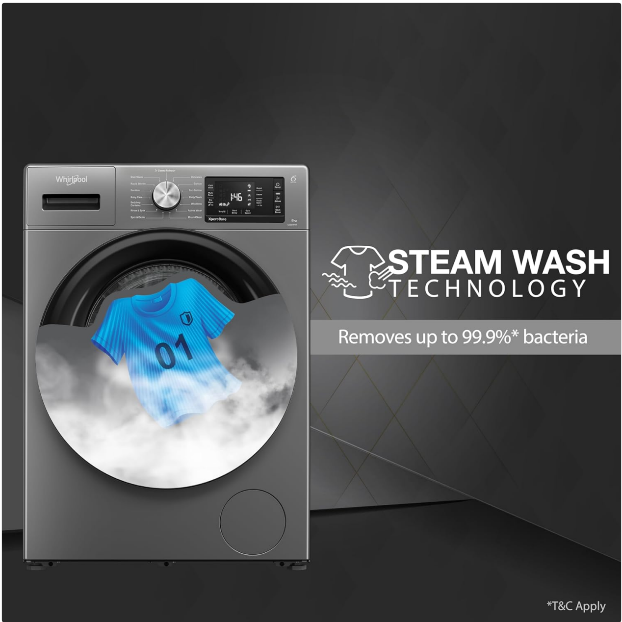
Figure 6: Steam Wash Technology for enhanced hygiene.