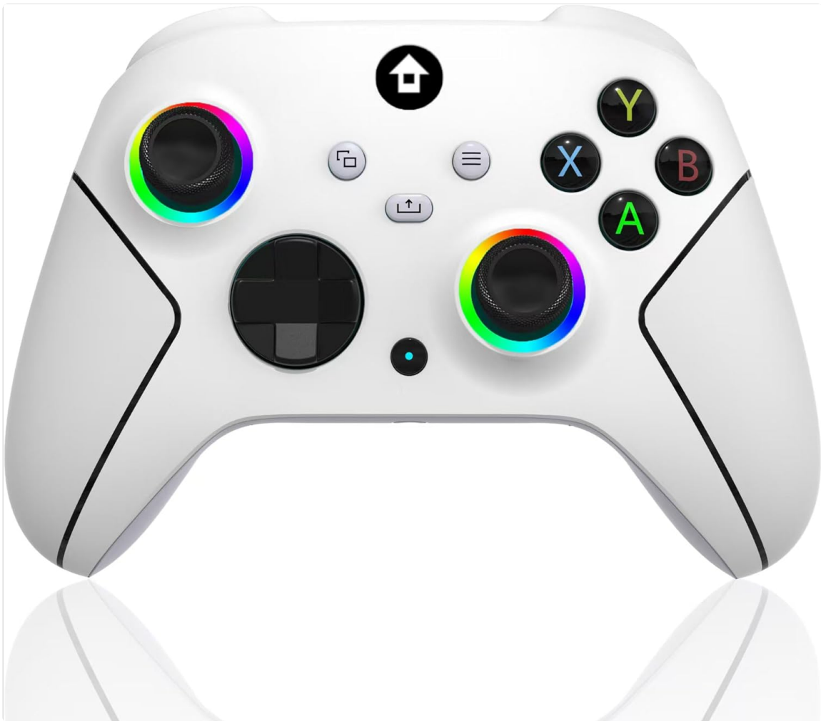
Front view of the YUYIU Wireless Controller, showcasing its ergonomic design and button layout.