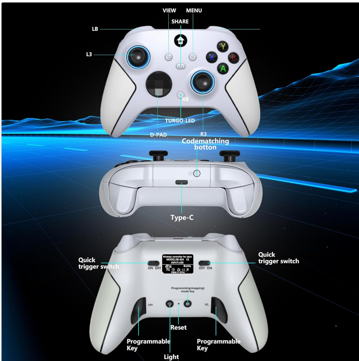
Detailed view of the controller's buttons, triggers, and ports, including programmable keys and trigger switches.