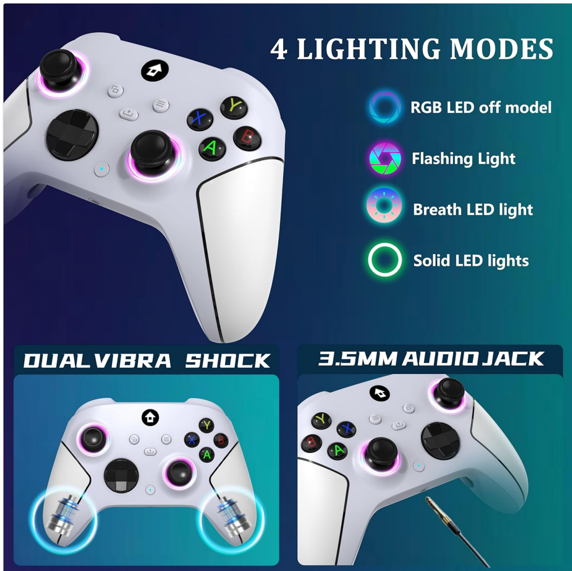
Illustration of the four distinct LED lighting modes available on the controller, alongside dual vibration and audio jack features.