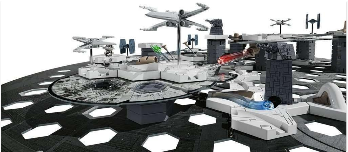
A marble in motion, demonstrating an action element on the GraviTrax track.