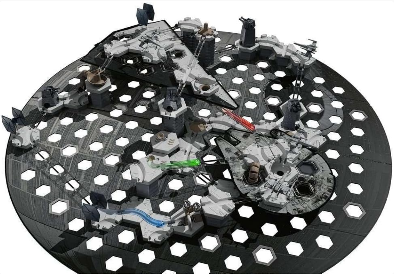
An overhead view of the assembled GraviTrax Star Wars Action-Set Death Star, ready for play.