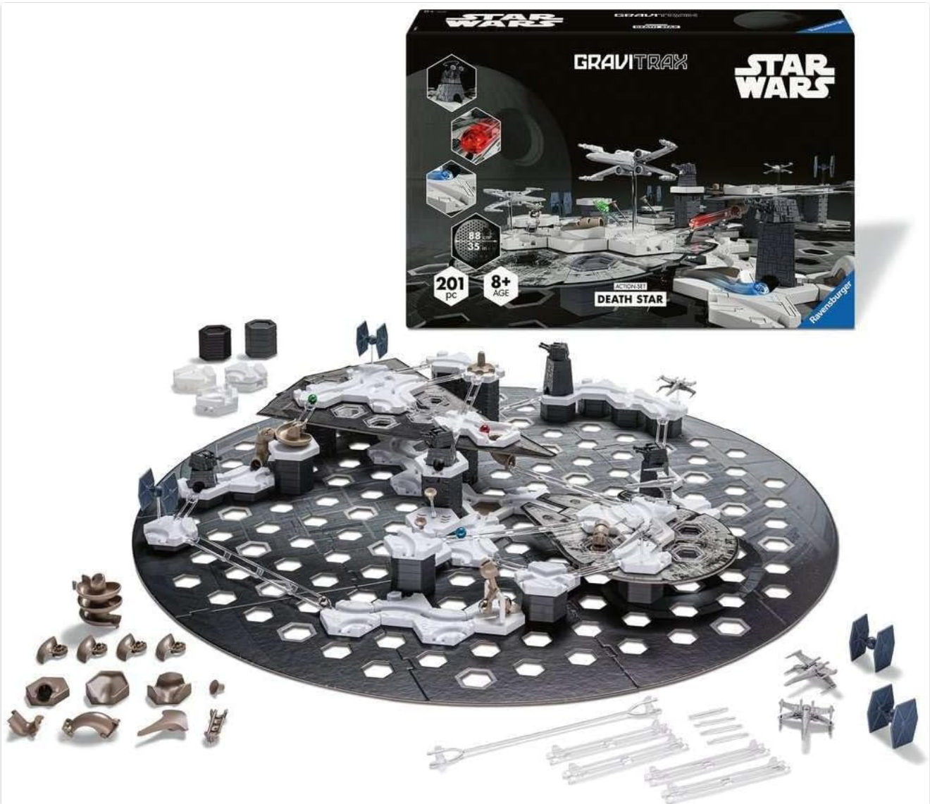
The GraviTrax Star Wars Action-Set Death Star assembled, with the product box in the background.