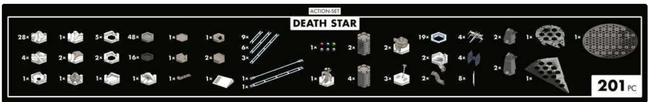
All 201 components of the GraviTrax Star Wars Action-Set Death Star laid out for inspection.