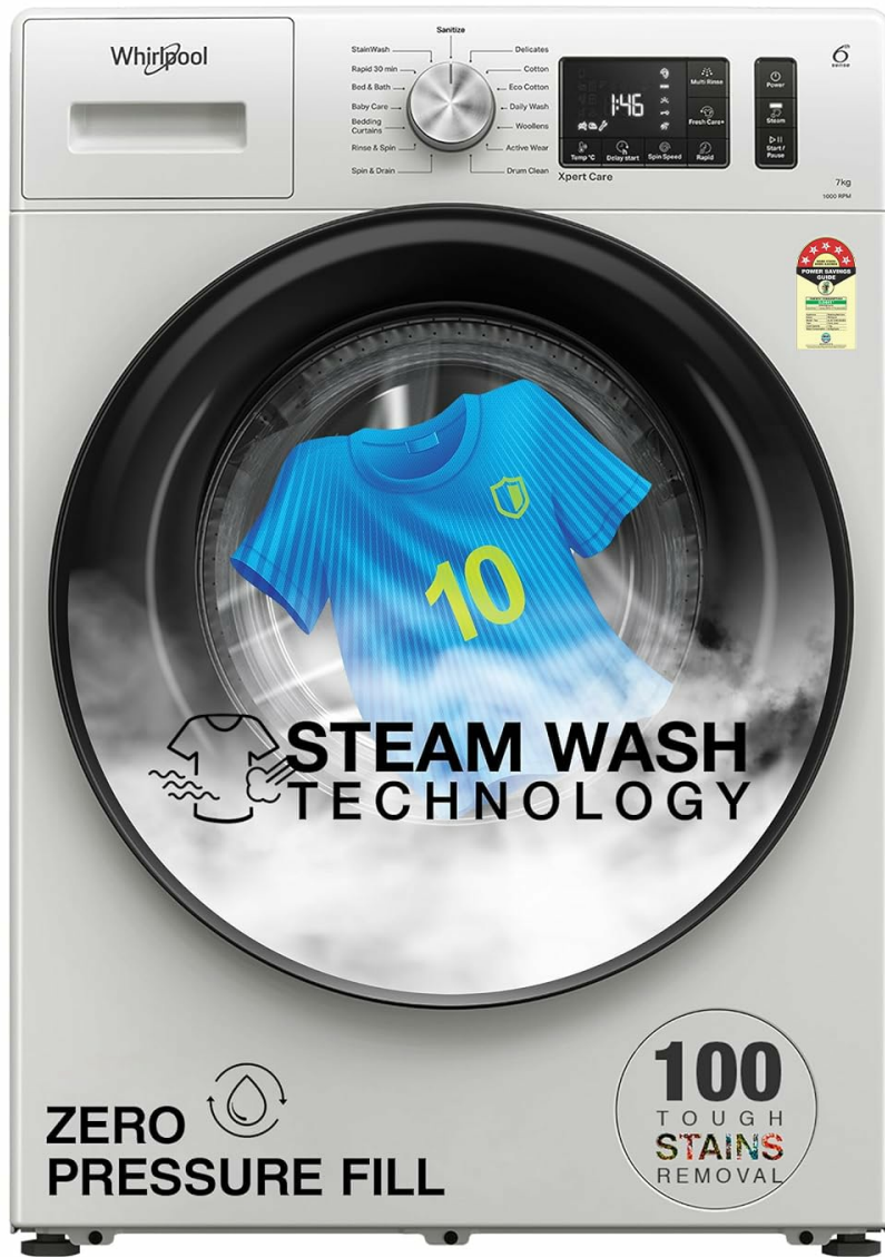
Image: Front view of the Whirlpool 7 Kg Front Load Washing Machine, showcasing its design and features.