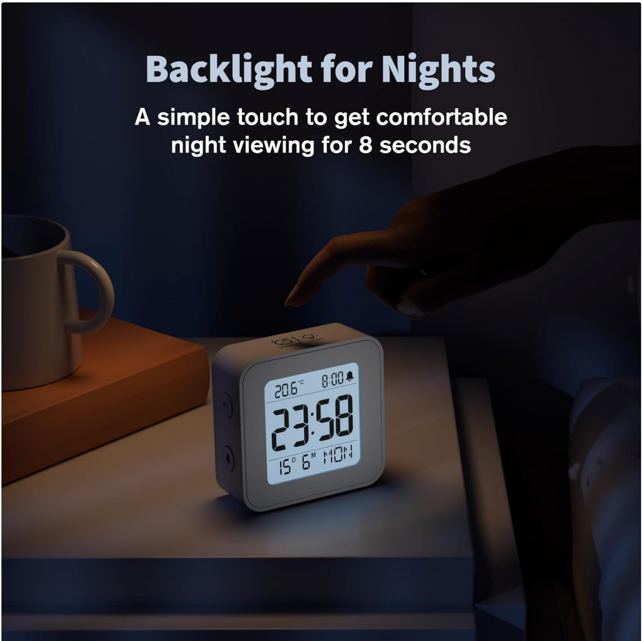
Image: The LATEC alarm clock on a bedside table in a dark room, with its display illuminated by the backlight, showing the time clearly.

To view the display in low light conditions or at night, press the SNOOZE/LIGHT button on the top of the clock. The display will illuminate for 8 seconds.