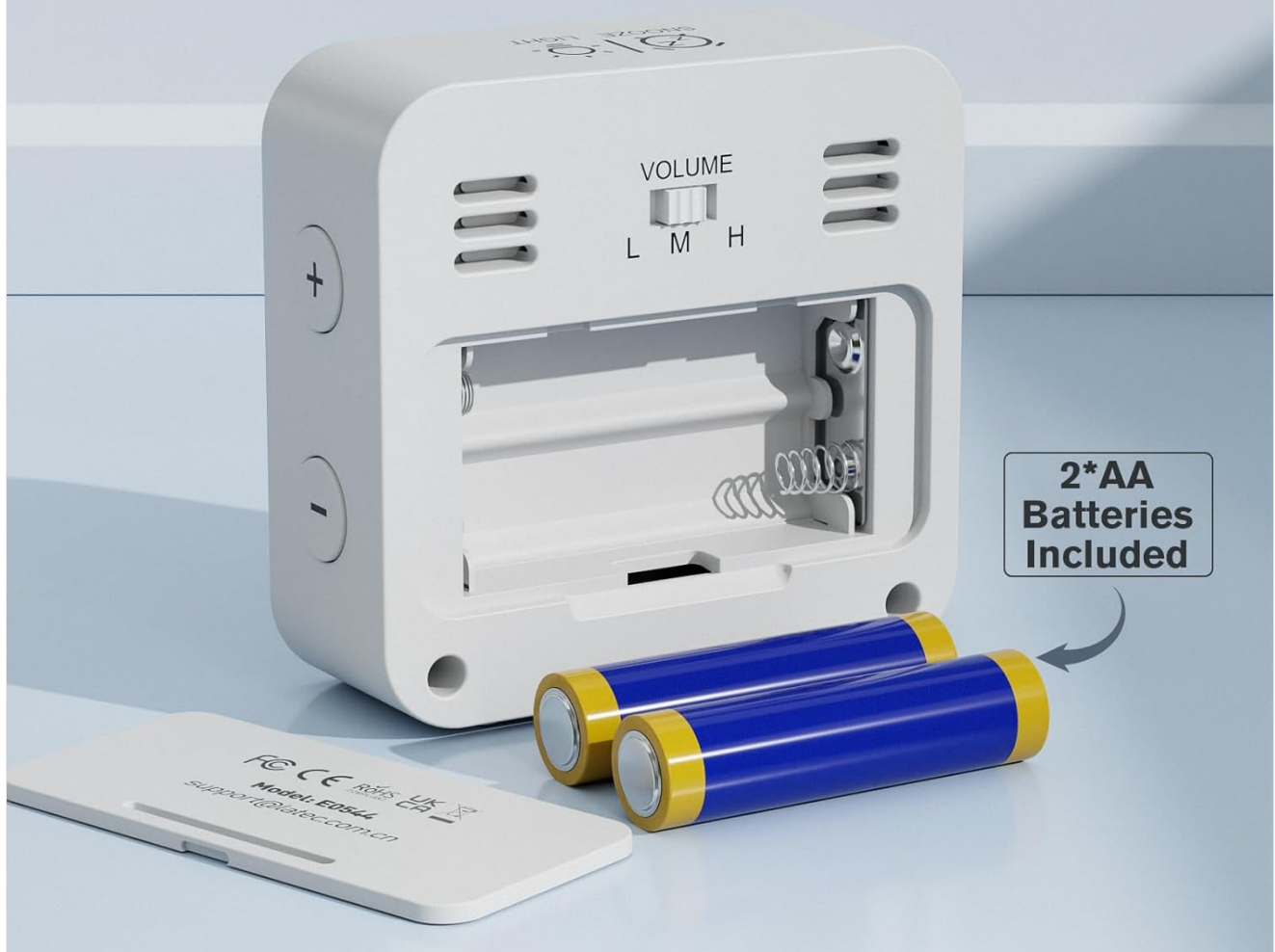
Image: Contents of the LATEC Digital Alarm Clock package, showing the clock, two AA batteries, and the user manual.