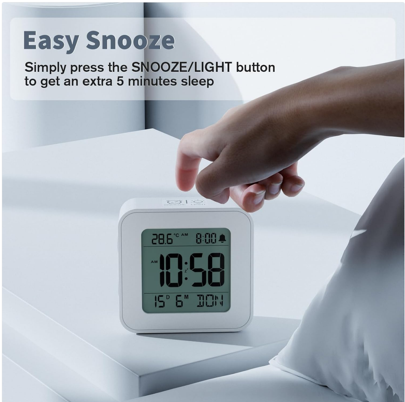
Image: A hand reaching to press the SNOOZE/LIGHT button on the top of the alarm clock, demonstrating the snooze function.

When the alarm sounds, press the large SNOOZE/LIGHT button on the top of the clock. The alarm will pause for 5 minutes and then sound again. You can repeat this process multiple times.