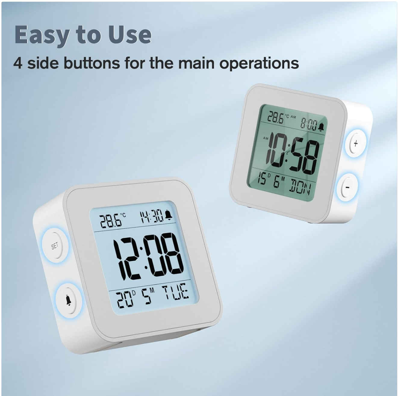
Image: Two LATEC alarm clocks, highlighting the 'SET' and 'Alarm ON/OFF' buttons on the left side, and the '+' and '-' buttons on the right side.