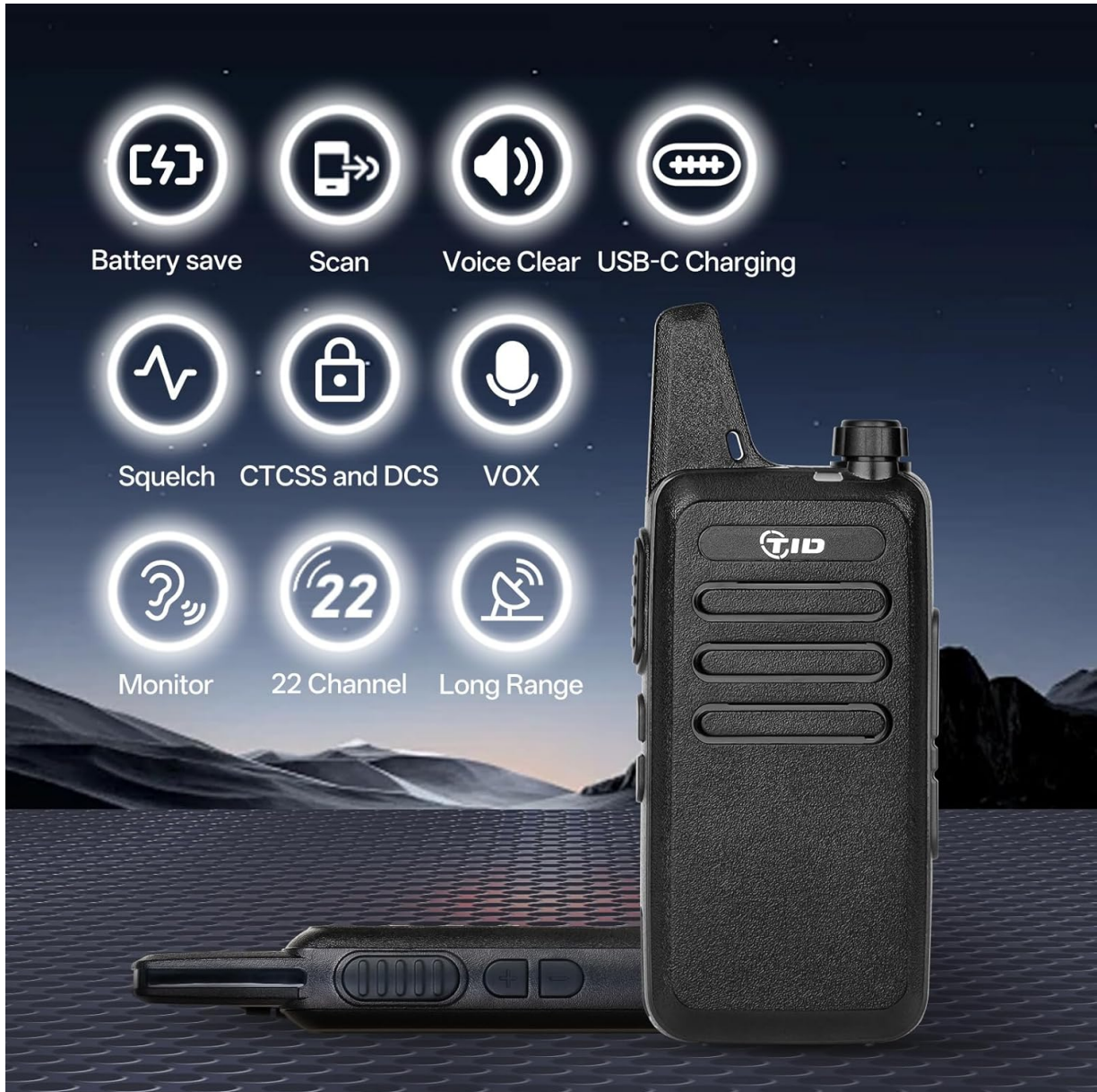
Image: Instructions for activating VOX function.