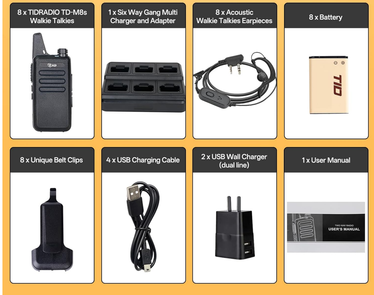
Image: Package contents of the TIDRADIO TD-M8s Walkie Talkies.