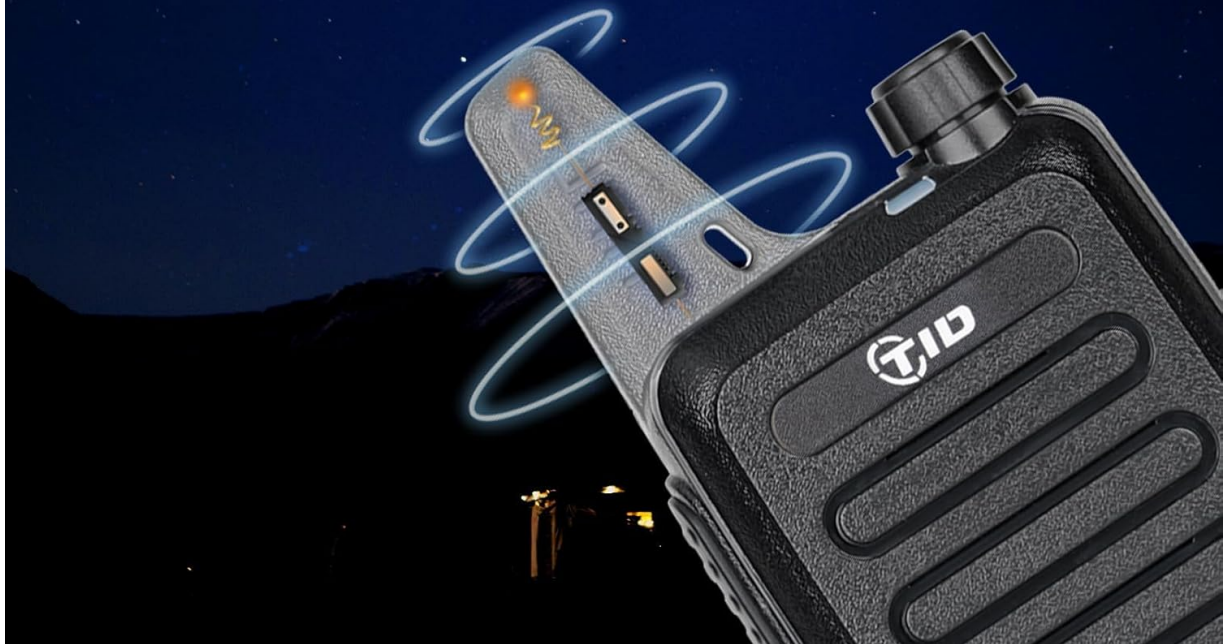
Image: Long range and gain antenna for enhanced signal.

Enhance the signal strength received and transmitted