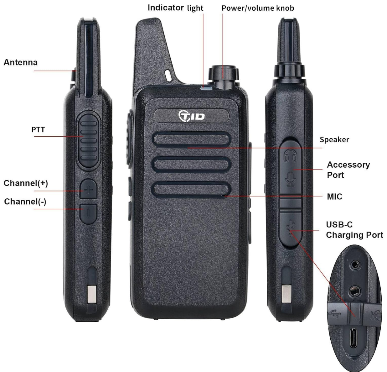
Image: Labeled components of the TD-M8s Walkie Talkie.