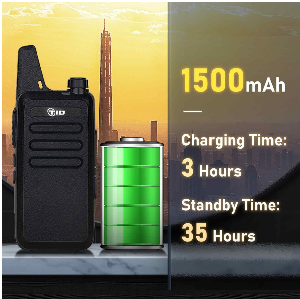
Image: Battery capacity and charging details.