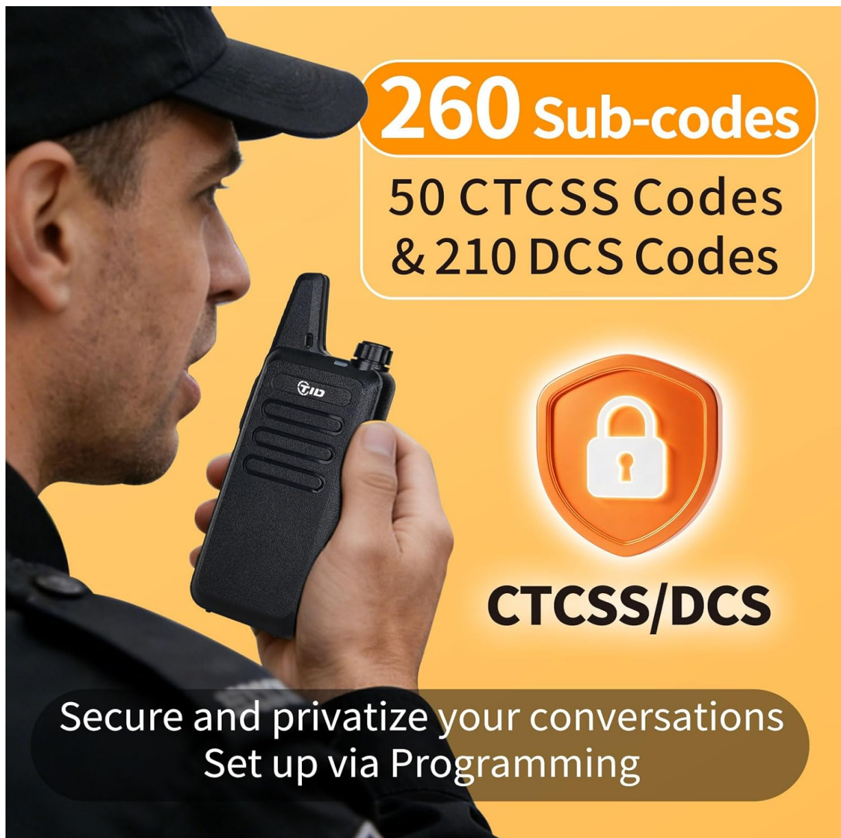
Image: Enhanced privacy with CTCSS/DCS codes.