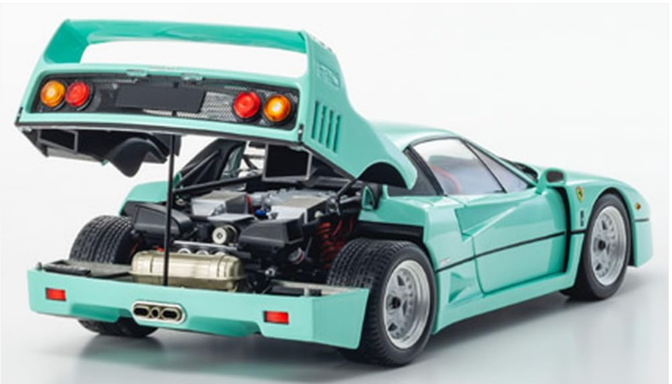
Figure 5.3: Rear engine cover open, providing a clear view of the intricately replicated engine and chassis components.

The rear engine cover is hinged at the top, near the roofline. Gently lift the rear section of the cover upwards. It will pivot to expose the detailed engine bay.