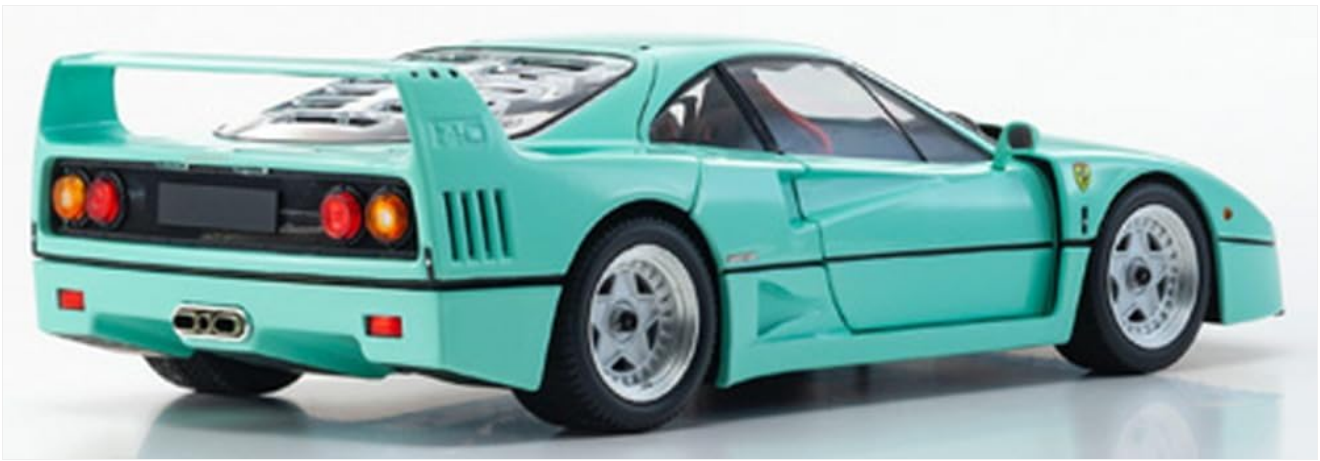
Figure 2.2: Rear view of the Kyosho 1/18 Ferrari F40 diecast model, highlighting the iconic rear wing, taillights, and exhaust system.