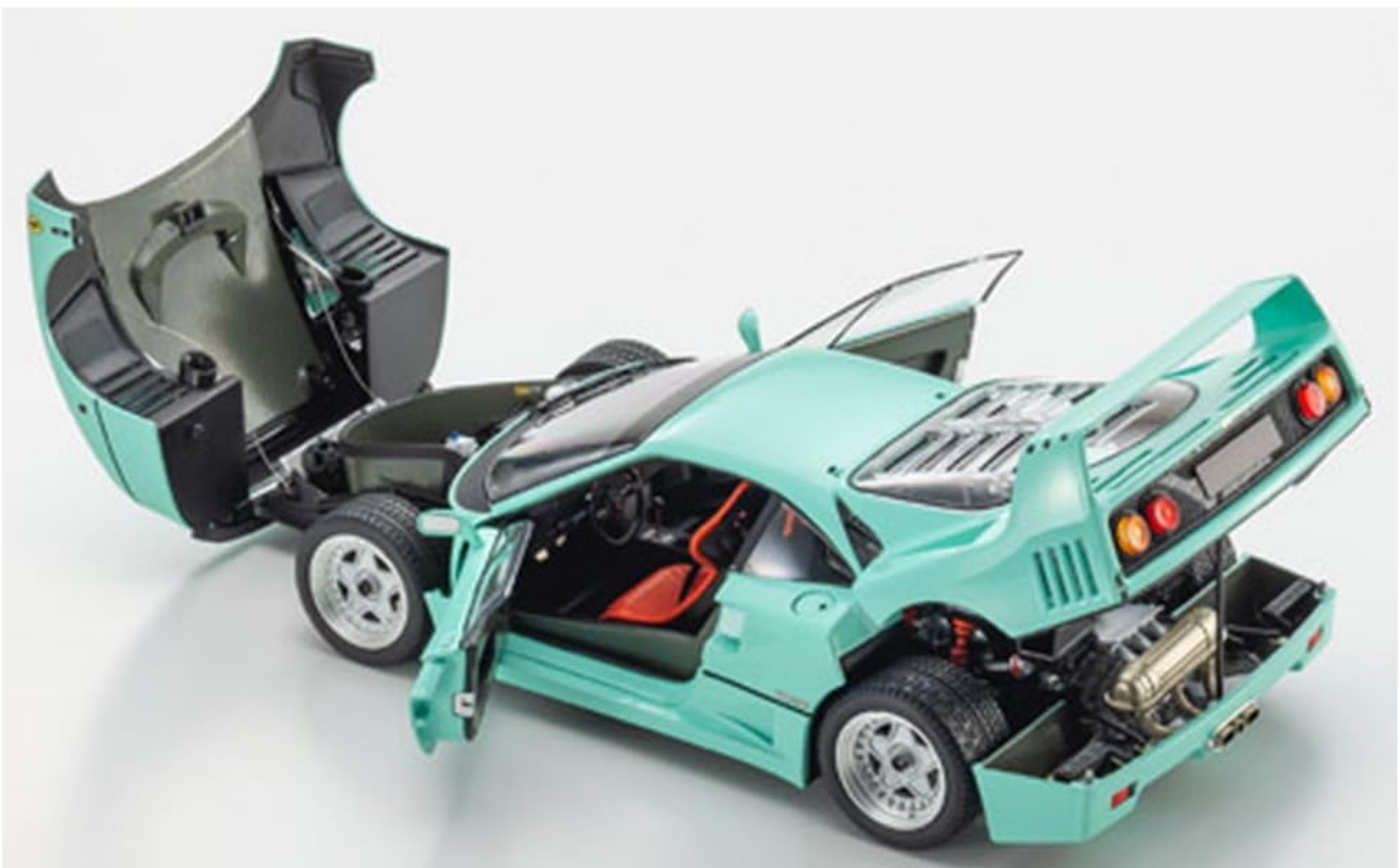
Figure 5.5: The Kyosho Ferrari F40 model with all functional parts (doors, front hood, and engine cover) in the open position, showcasing its full detail.