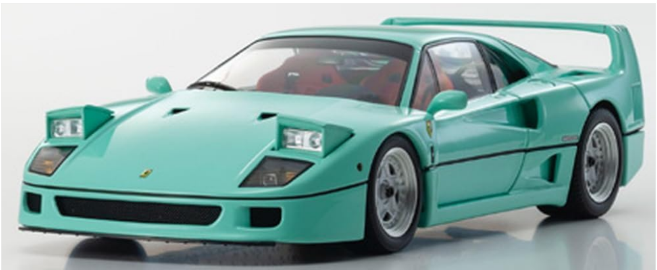
Figure 2.1: Front view of the Kyosho 1/18 Ferrari F40 diecast model, showcasing its distinctive pop-up headlights and aerodynamic design.

The Kyosho 1/18 Ferrari F40 is a pre-built, finished diecast model designed for display. It features an opening and closing mechanism for various parts, allowing for a detailed view of the interior and engine bay. This model is not intended for riding, does not emit sounds or lights, and does not require batteries or fuel.