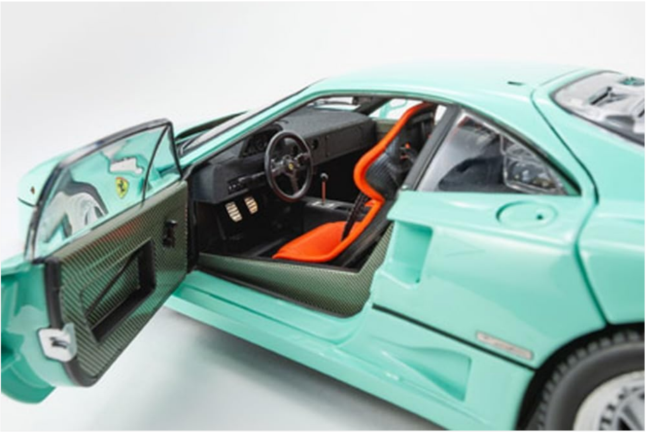
Figure 5.1: Driver's side door open, revealing the detailed interior with red racing seats and dashboard.