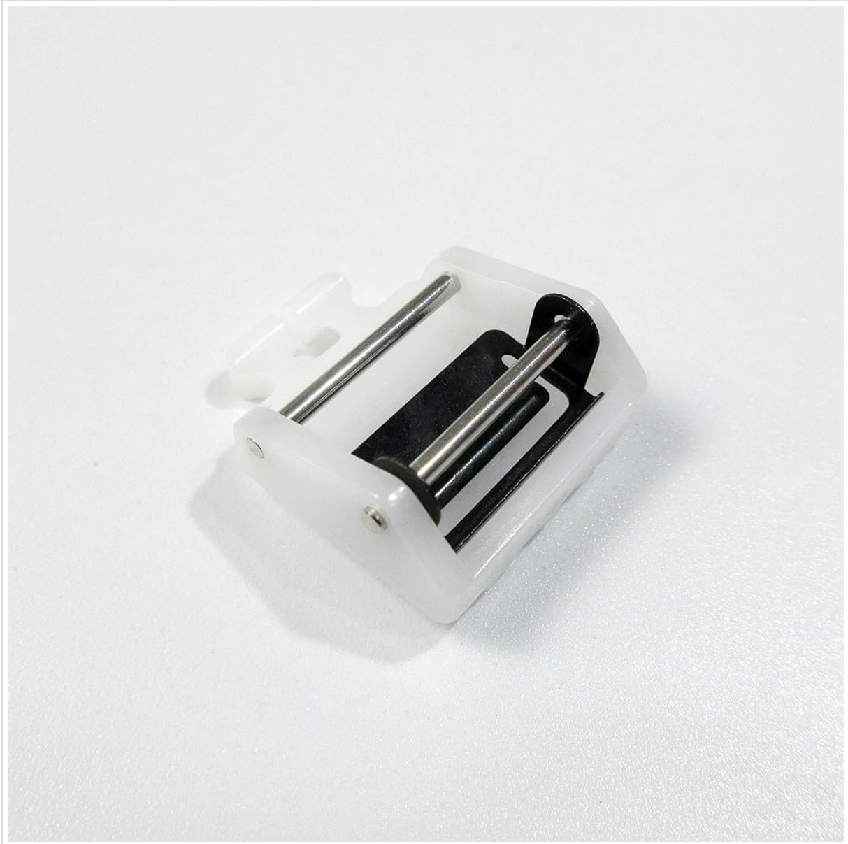
Image 1: Side view of the EverNice Zipper Foot, highlighting the attachment mechanism.