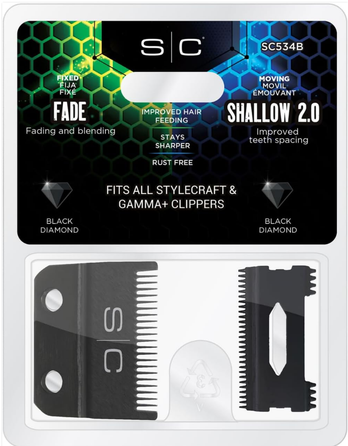
Image: The Stylecraft Fade and Shallow blades displayed in their retail packaging.