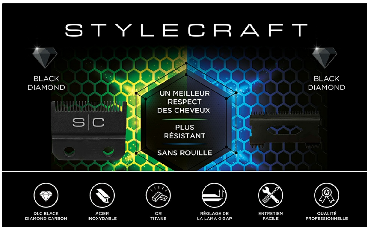
Image: A diagram illustrating the Fixed Black Diamond Fade Blade and Moving Black Diamond Shallow 2.0 Tooth Cutter, highlighting their features and compatibility.