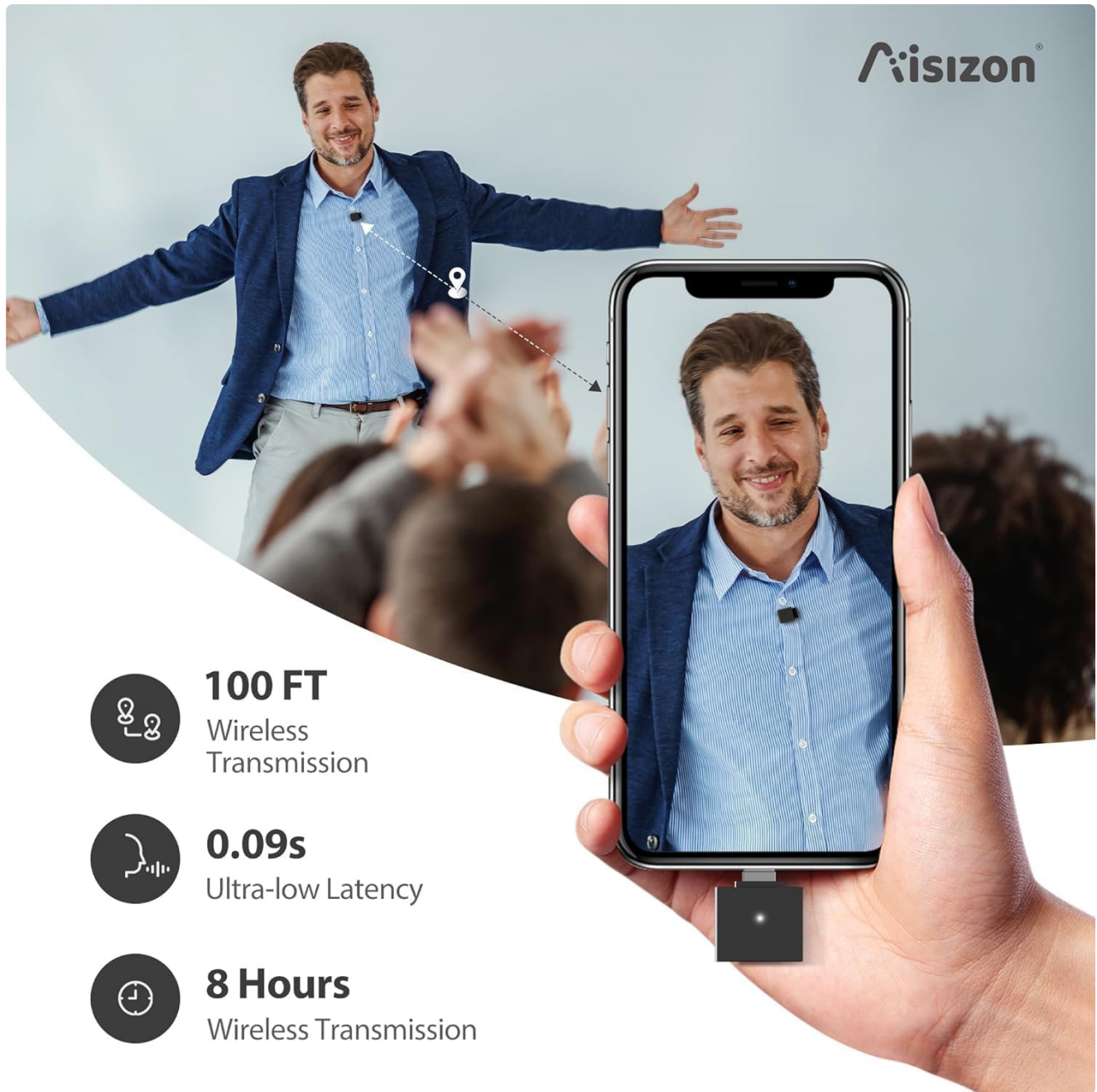
Image: Infographic highlighting key performance metrics: 100ft wireless transmission range, 0.09s ultra-low latency, and 8 hours of wireless transmission battery life.

The microphone supports continuous clear recording within a 100ft (approximately 30 meters) range. Each microphone provides up to 8 hours of recording time on a full charge, with a standby time of 30 hours.