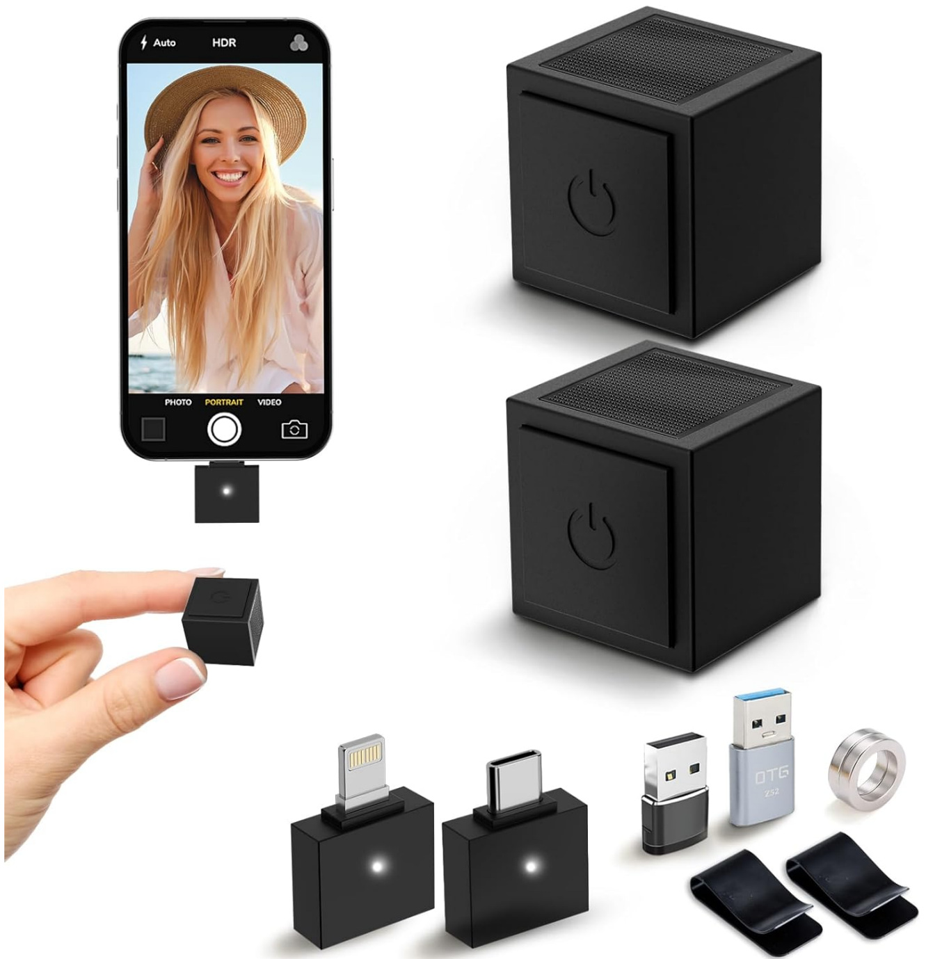
Image: Overview of the Aisizon Wireless Lavalier Microphone system components, showing two microphones, the receiver, various adapters, and clips.