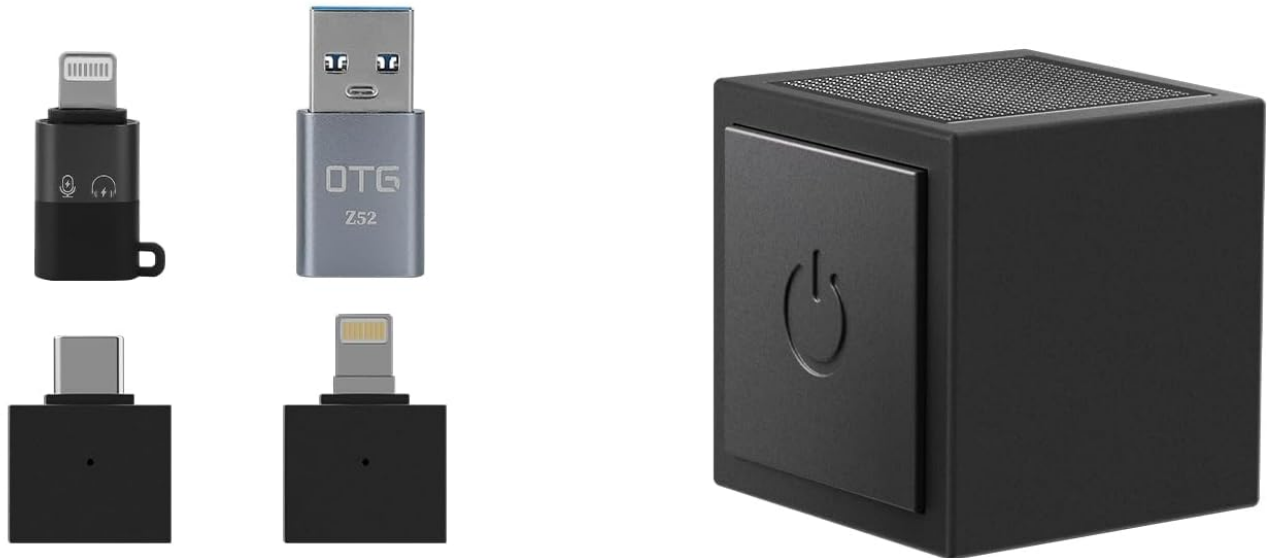
Image: Visual representation of the microphone's broad compatibility with multiple devices, including iPhones, Android phones, iPads, Macs, and PCs, along with various connector types.