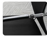
Household Metal Parts

Image: Visual guide demonstrating the three steps for setup: 1. Insert the receiver into your device. 2. Press the power button on the microphone. 3. Successful pairing is indicated.