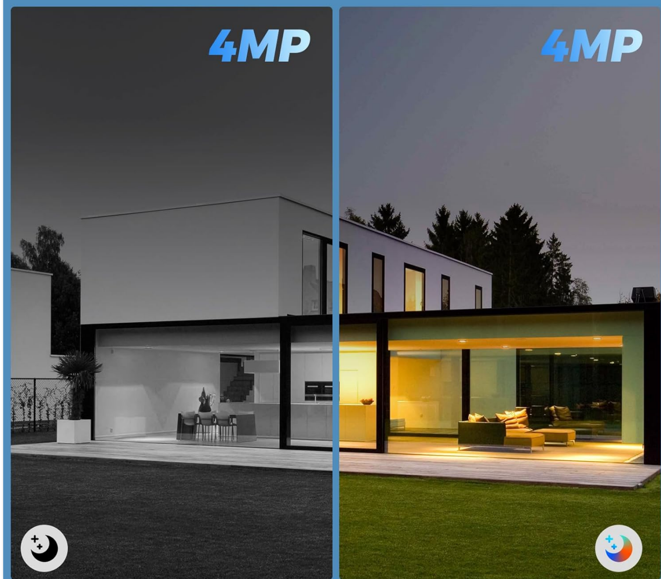
Figure 5: Comparison showing the clarity of 4MP full-color night vision versus standard infrared night vision.