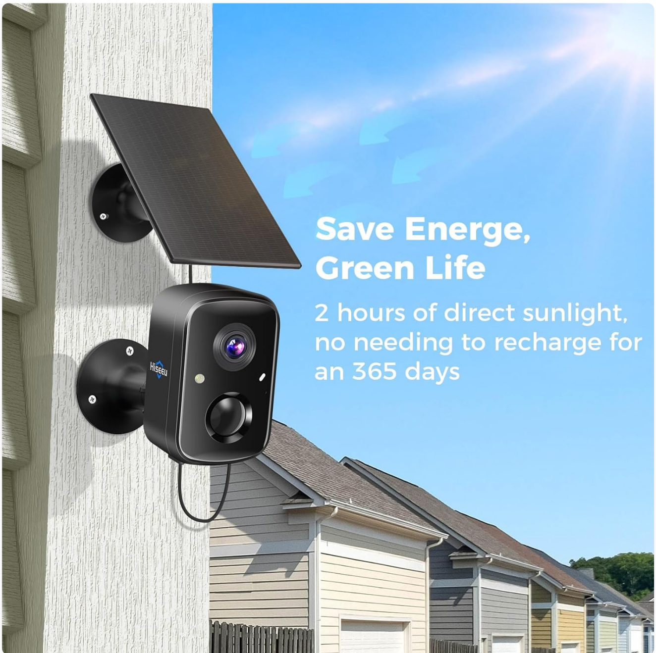
Figure 3: Hiseeu C90B camera and solar panel installed on a residential building, illustrating its outdoor placement and solar charging capability.