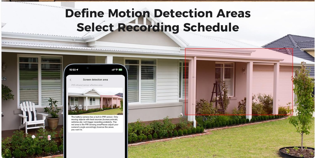
Figure 6: The Hiseeu C90B camera integrated with Alexa for live viewing and the app interface for defining motion detection areas.