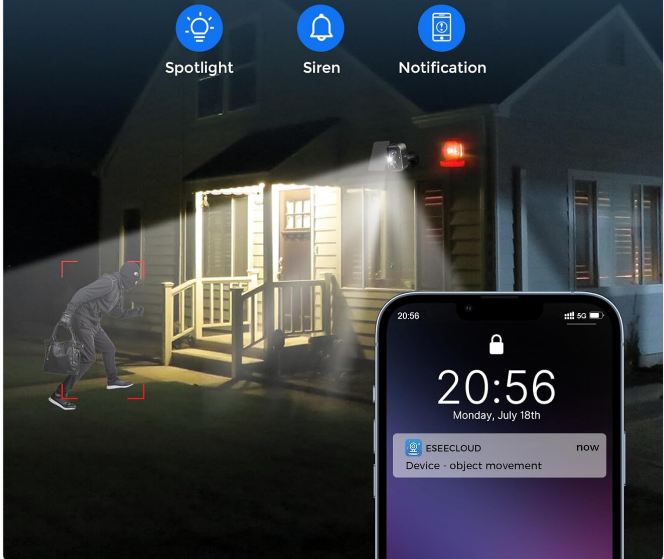
Figure 4: Illustration of AI motion detection triggering alerts, spotlight, and siren on the Hiseeu C90B camera.