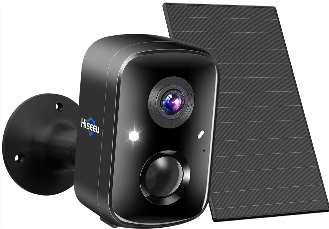
Figure 1: Hiseeu C90B Wireless Outdoor Security Camera with Solar Panel.

This manual provides detailed instructions for the installation, operation, maintenance, and troubleshooting of your Hiseeu C90B Wireless Outdoor Security Camera. Please read this manual thoroughly before using the product to ensure proper functionality and safety.