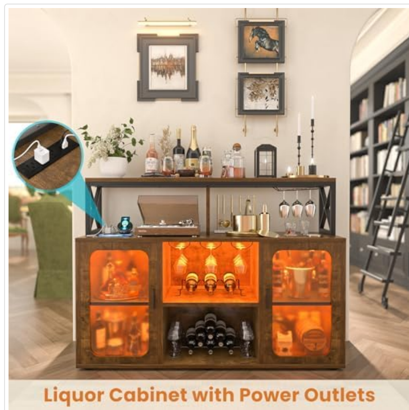
Figure 3: Close-up view of the integrated power outlets and USB ports.