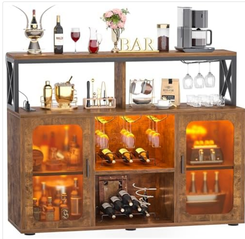
Figure 1: Overview of the Aheaplus Bar Cabinet, showcasing its design and various features.