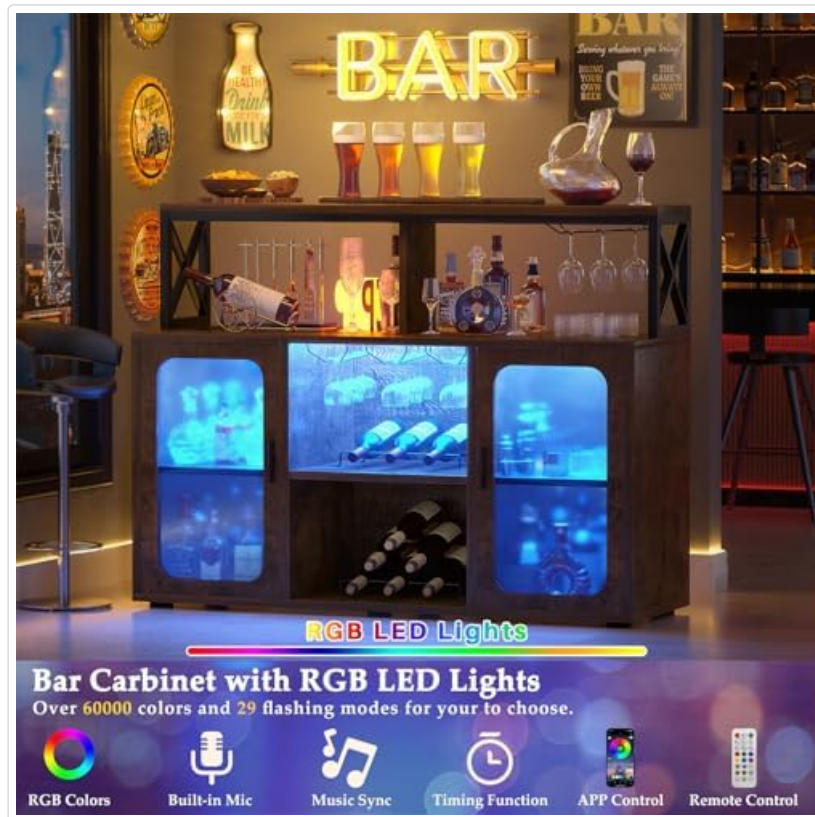
Figure 4: The bar cabinet illuminated by its versatile LED RGB lighting.