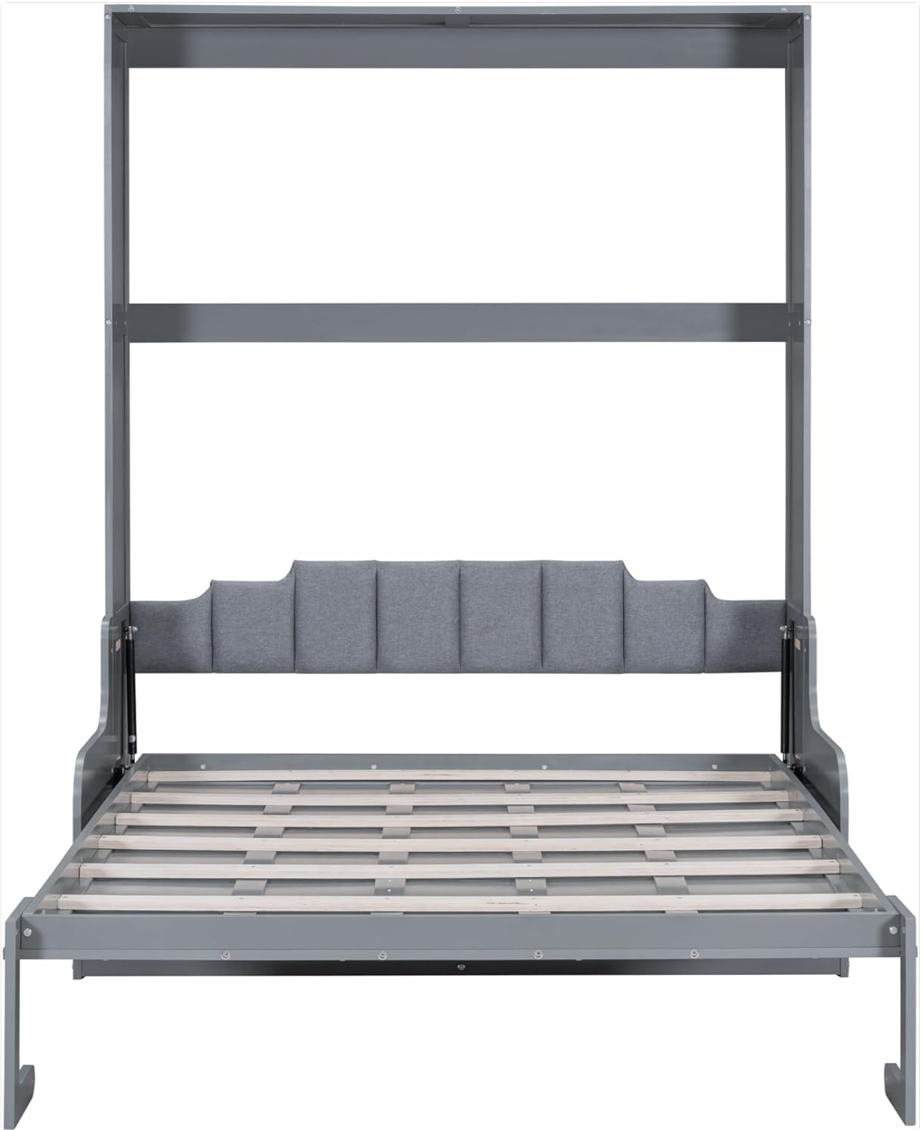
Image 3.2: The internal metal bed frame fully extended, ready for mattress placement.