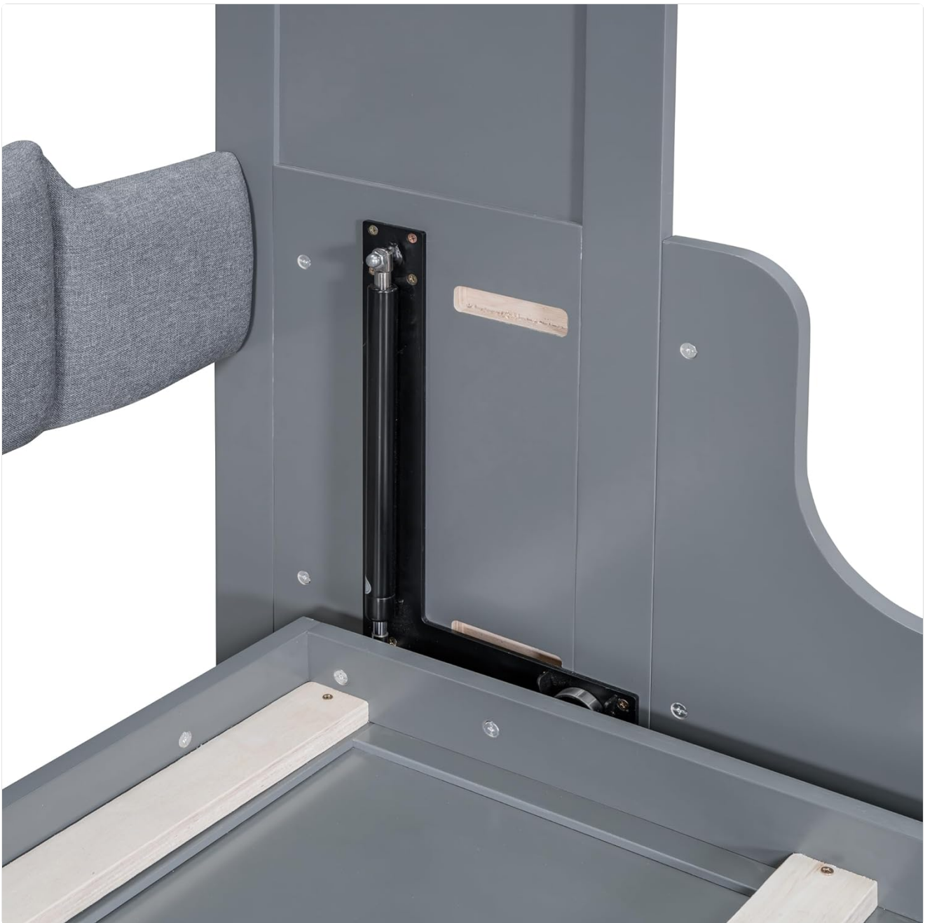
Image 3.3: Detail of the dual piston metal folding mechanism, ensuring smooth operation.