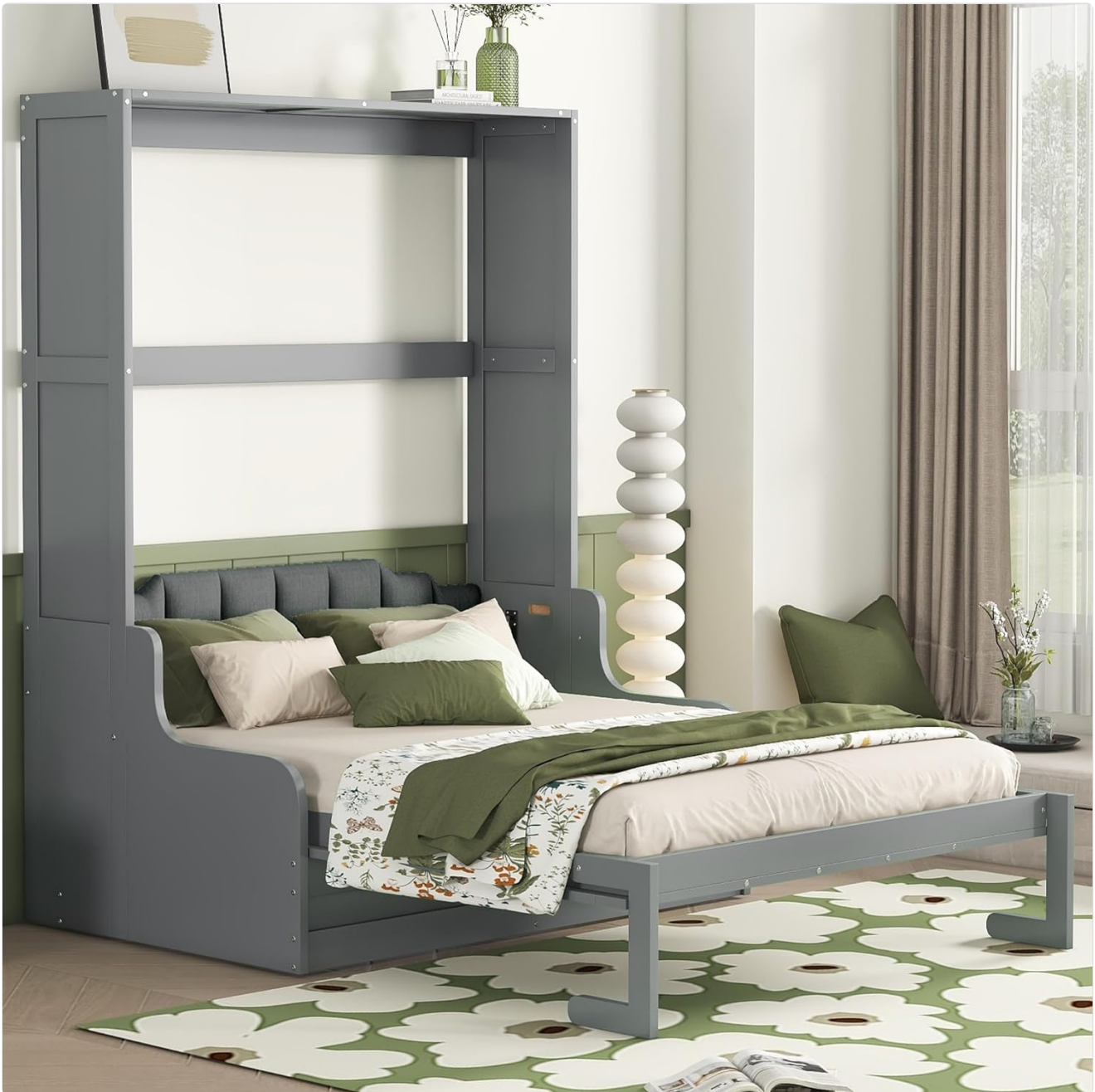
Image 4.1: The Murphy bed fully extended, showcasing its queen-size sleeping area.