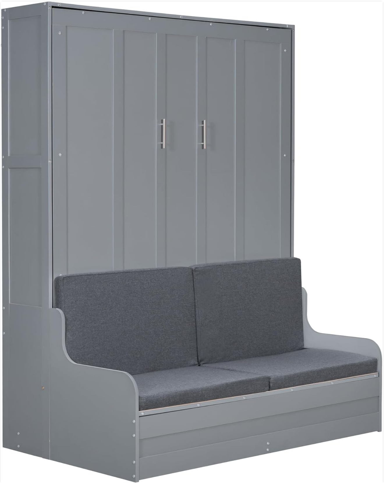
Image 4.2: The Murphy bed in its compact cabinet form, with the integrated sofa cushions visible.