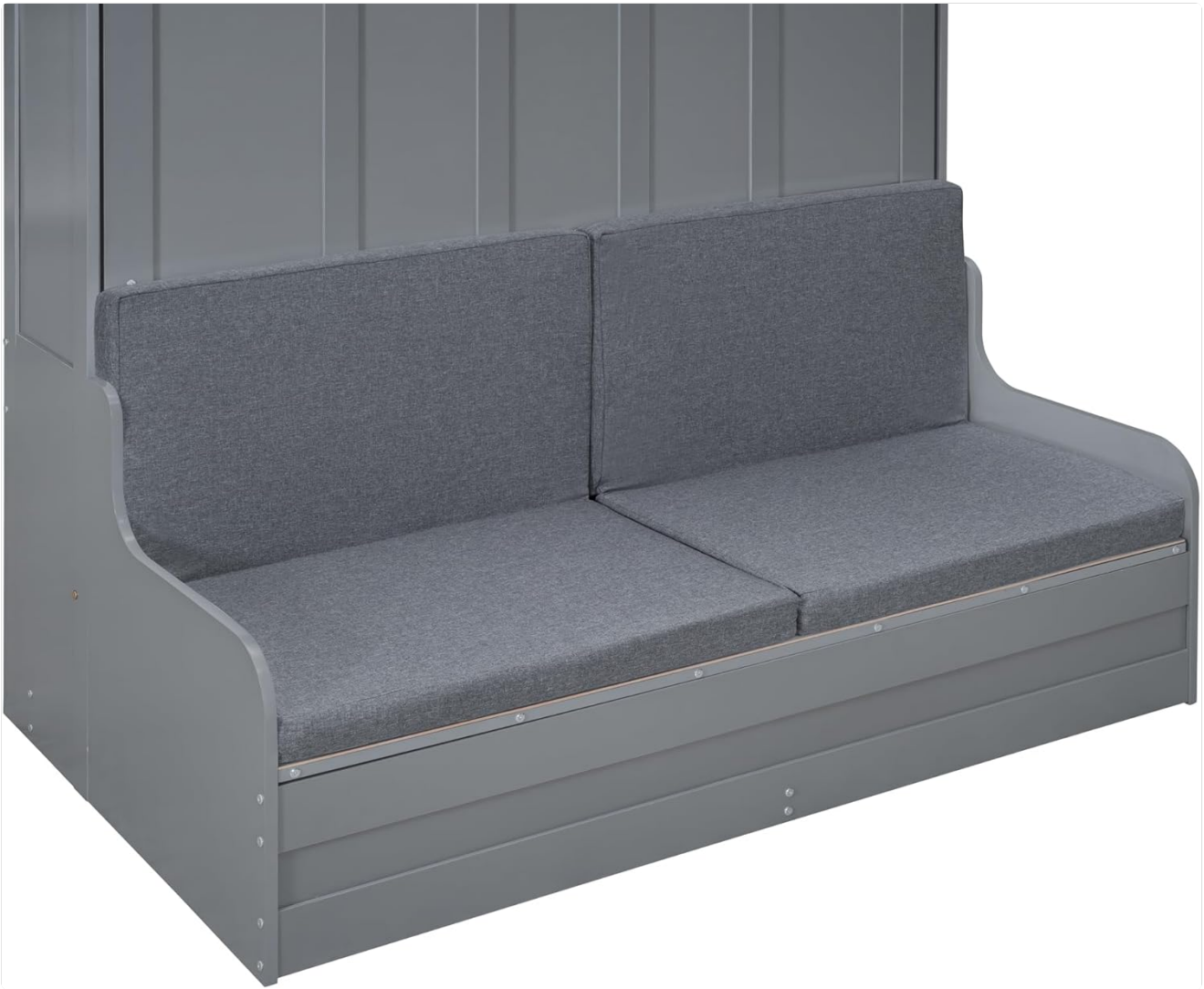
Image 4.3: Detailed view of the comfortable, foldable cushions that form the seating area when the bed is stored.