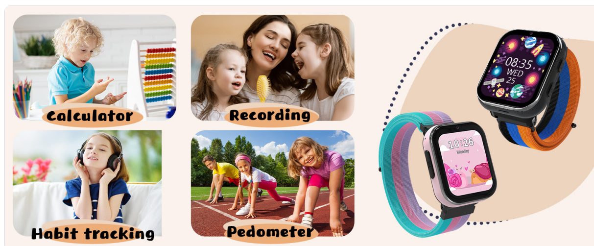
Image 4.3: The watch's habit tracker feature, showing various daily activities like waking up, brushing teeth, and going to school, which can be set as alarms.