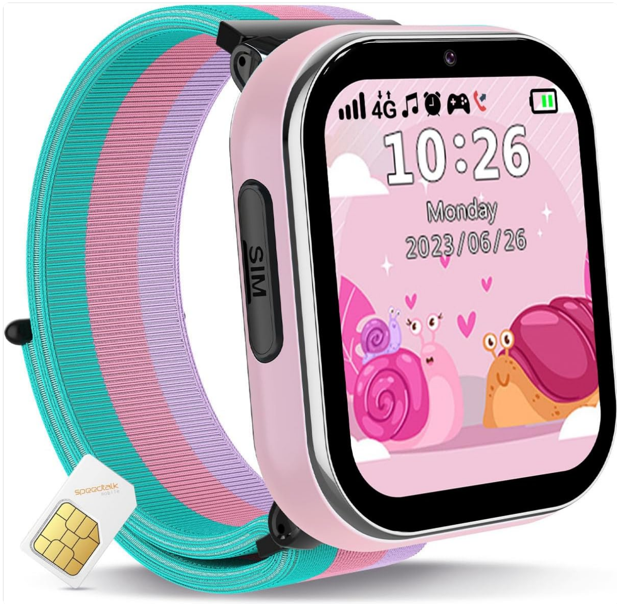
Image 1.1: PTHTECHUS 4G Kids Smart Watch LT49. The watch features a pink casing and a colorful striped band, with a visible SIM card slot on the side.