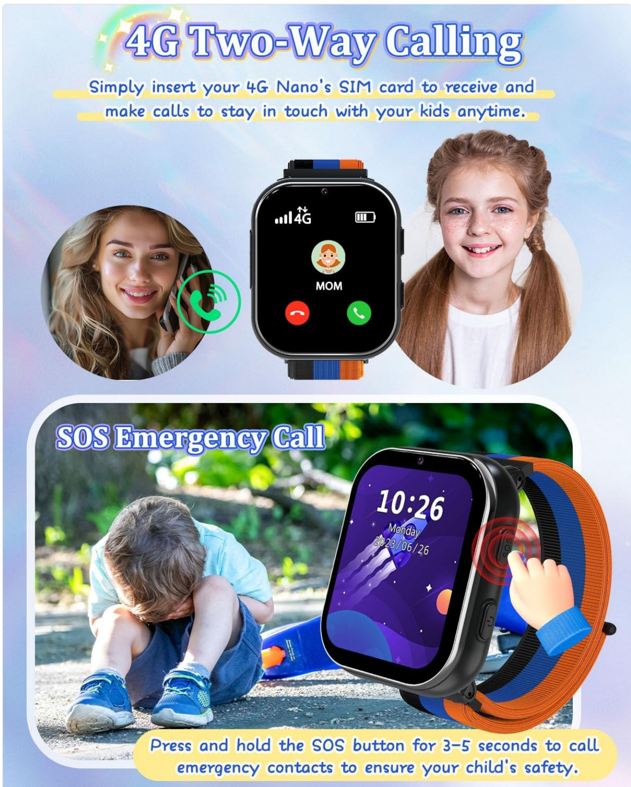
Image 5.1: Illustration of the two-way calling feature, showing a child receiving a call, and the SOS emergency call function being activated by pressing the side button.

automatically dial up to 3 pre-set emergency contacts and send a text message.