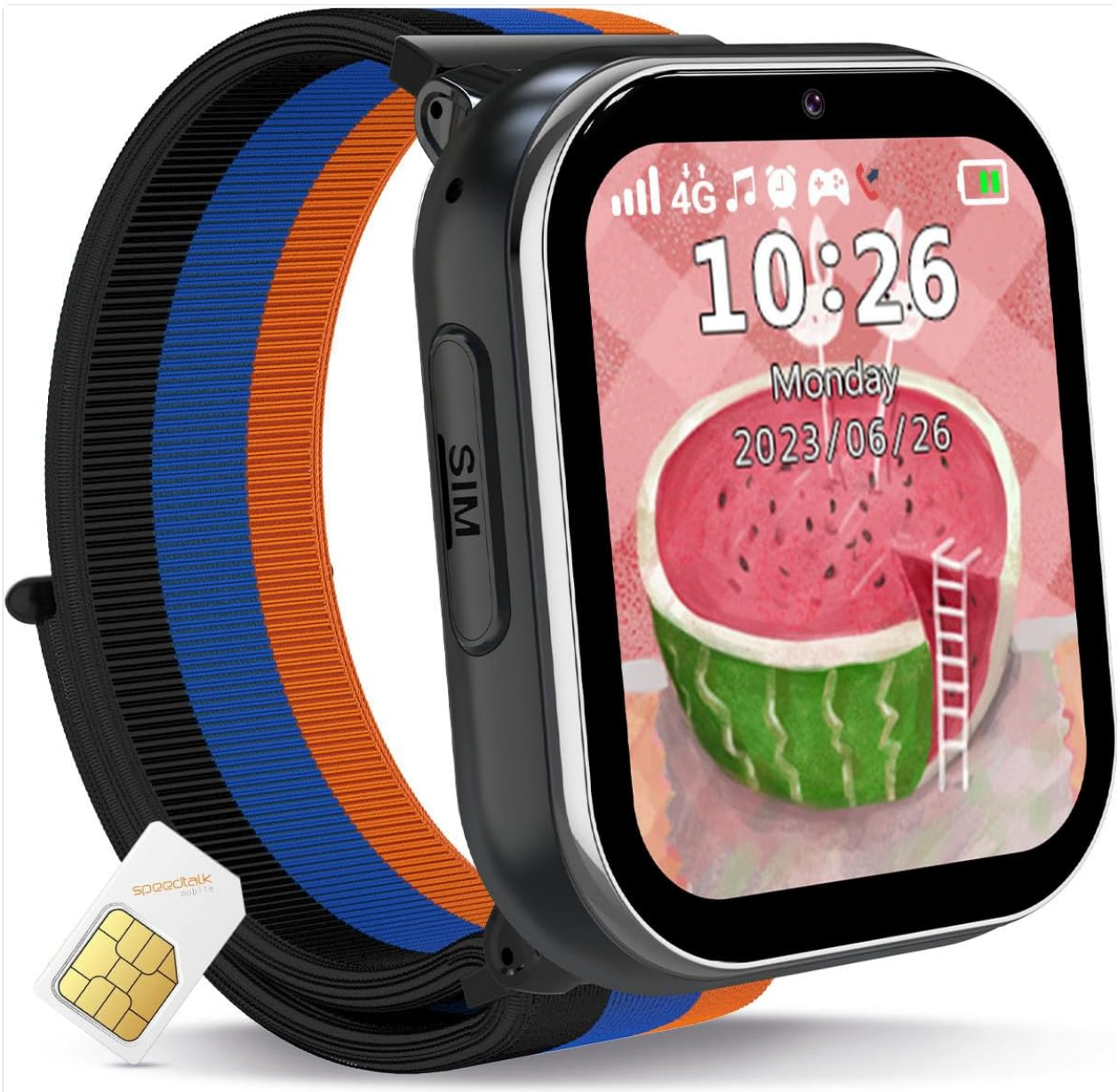
Image 2.1: The PTHTECHUS 4G Kids Smart Watch LT49, shown with its adjustable strap and a SpeedTalk Mobile SIM card, which is included for initial activation.