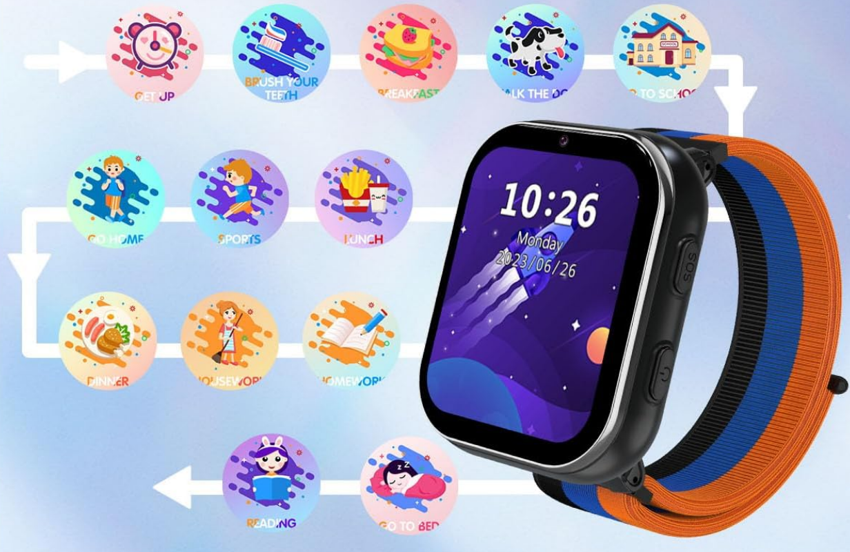
Image 5.6: The habit tracker interface showing 13 alarm clock modes to help children establish good daily routines.