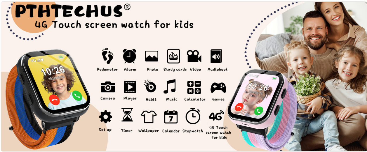
Image 3.1: An overview of the smartwatch's features, including Pedometer, Alarm, Photo, Study Cards, Video, Audiobook, Camera, Player, Habit, Music, Calculator, Games, Setup, Timer, Wallpaper, Calendar, and Stopwatch.