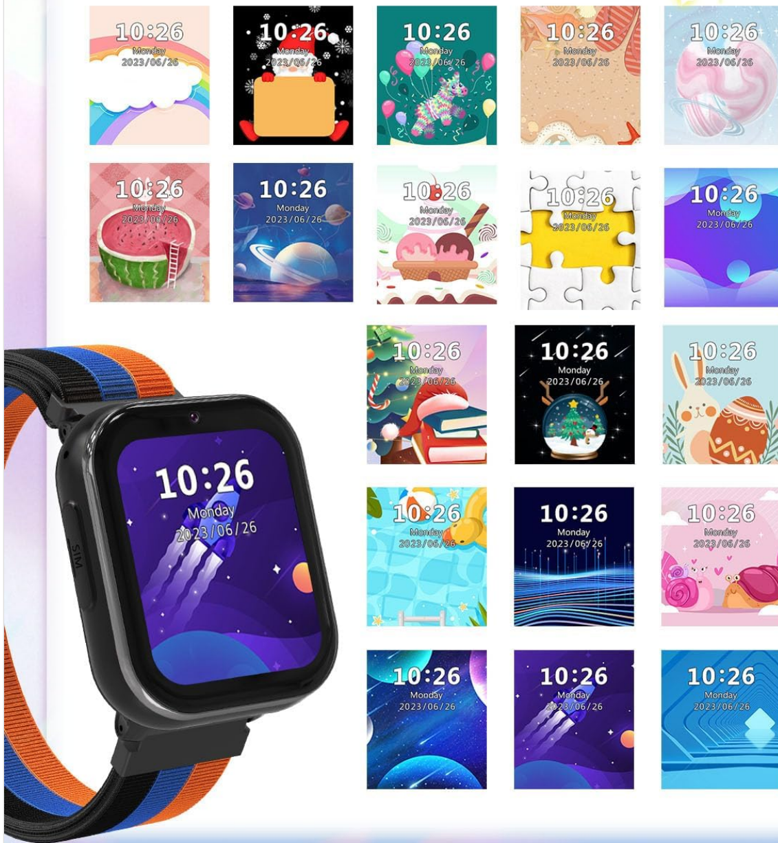
Image 5.9: A selection of multiple wallpapers available for customizing the smartwatch display.

Directly click on the screen to switch back and forth between wallpapers