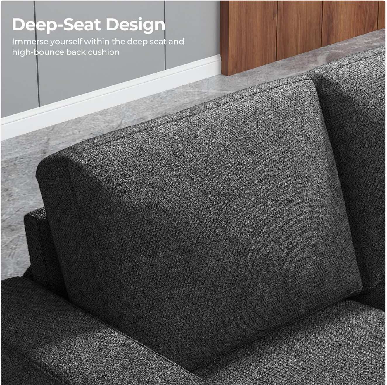
Image: A close-up view highlighting the deep seat design of the sofa.

Immerse yourself within the deep seat and high-bounce back cushion