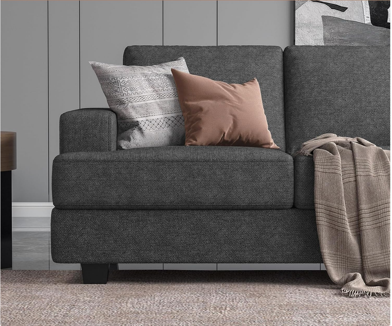
Image: A close-up view showcasing the extra-thick cushions for enhanced comfort.

Offers supportive yet also soft sitting comfort