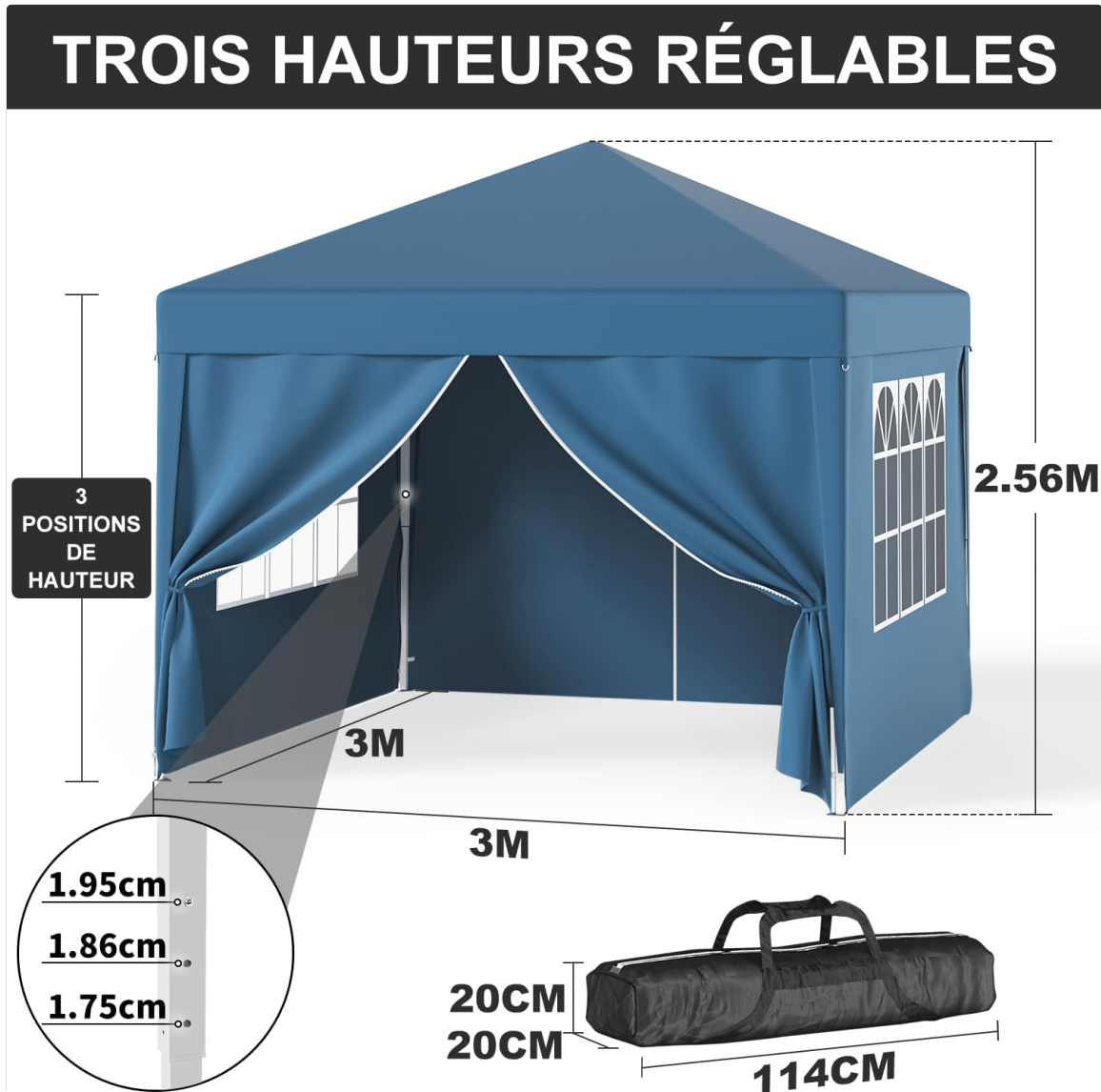
Figure 4.1: Gazebo dimensions and adjustable height options.