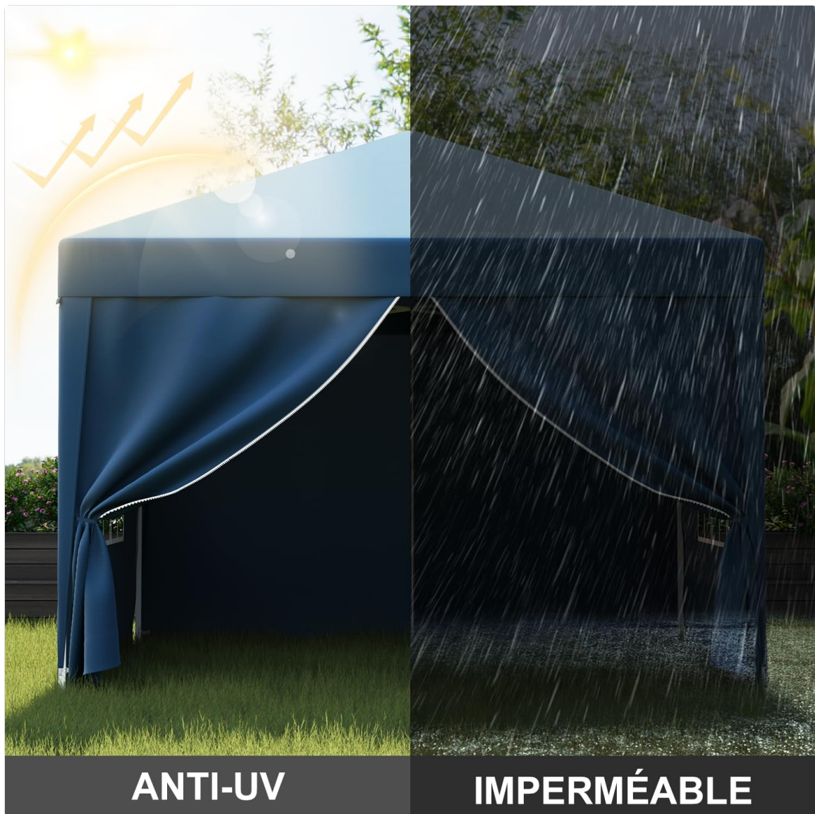
Figure 5.1: Gazebo demonstrating Anti-UV and Waterproof features.