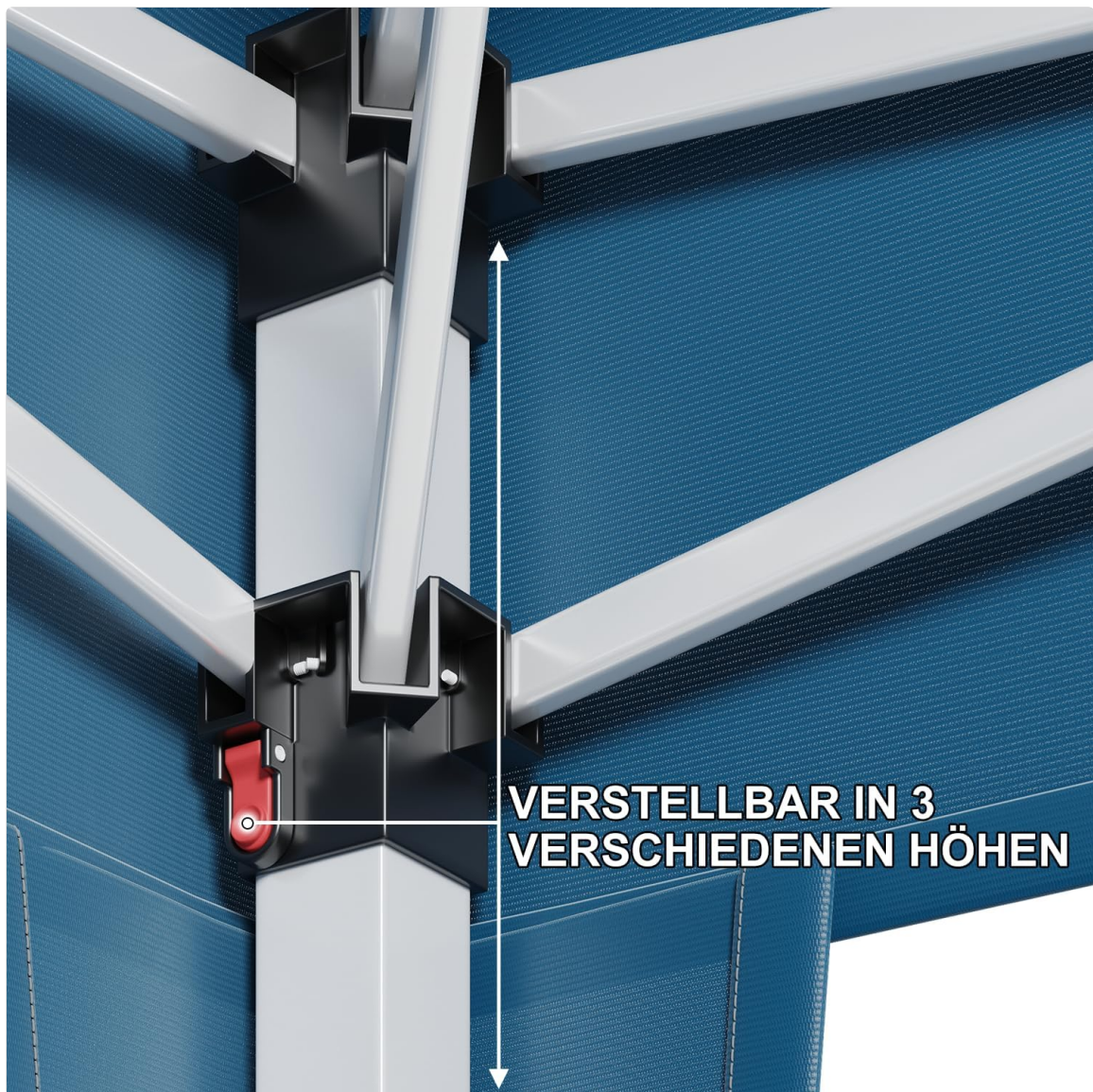
Figure 4.2: Detail of the height adjustment mechanism.