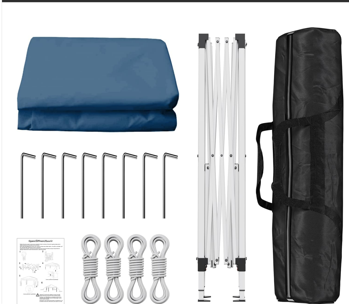
Figure 3.1: All components included in the package.