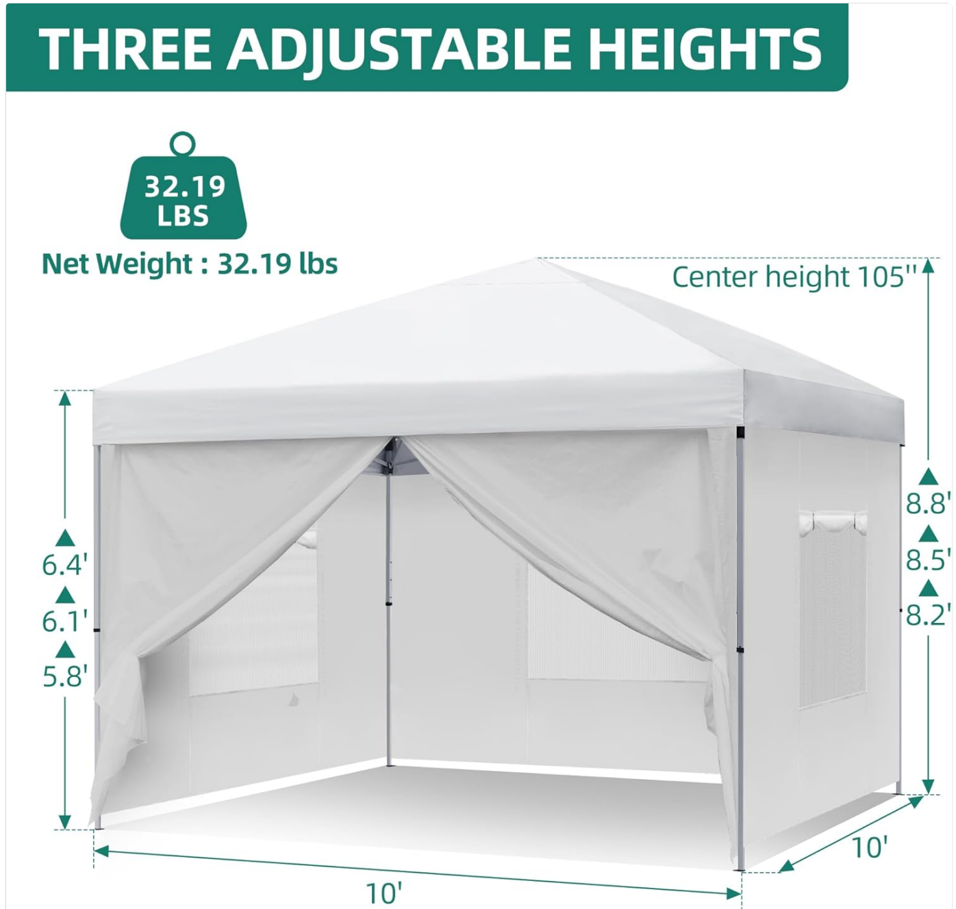
Image: A detailed diagram illustrating the three adjustable height settings for the canopy legs, along with the overall dimensions of the 10x10 foot canopy.

To change the height of the canopy, locate the push-button mechanisms on each leg. Simultaneously press these buttons and slide the leg sections to the desired height setting (5.8', 6.1', or 6.4'). Ensure all four legs are adjusted to the same height and securely locked into place before use.