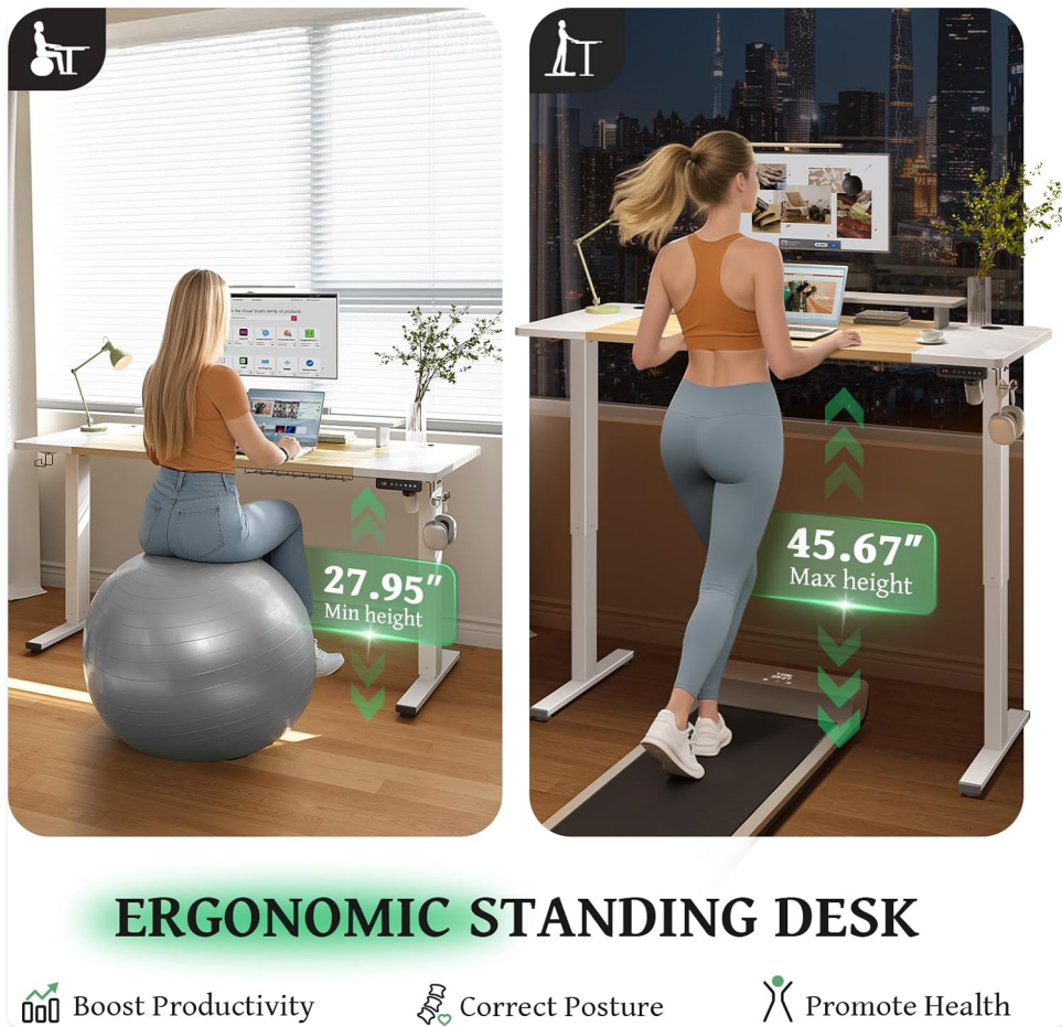
Figure 4.2: Desk demonstrating its minimum (27.95") and maximum (45.67") adjustable heights.

The motor operates quietly (under 45 dB) and smoothly, ensuring your items remain stable during height transitions.