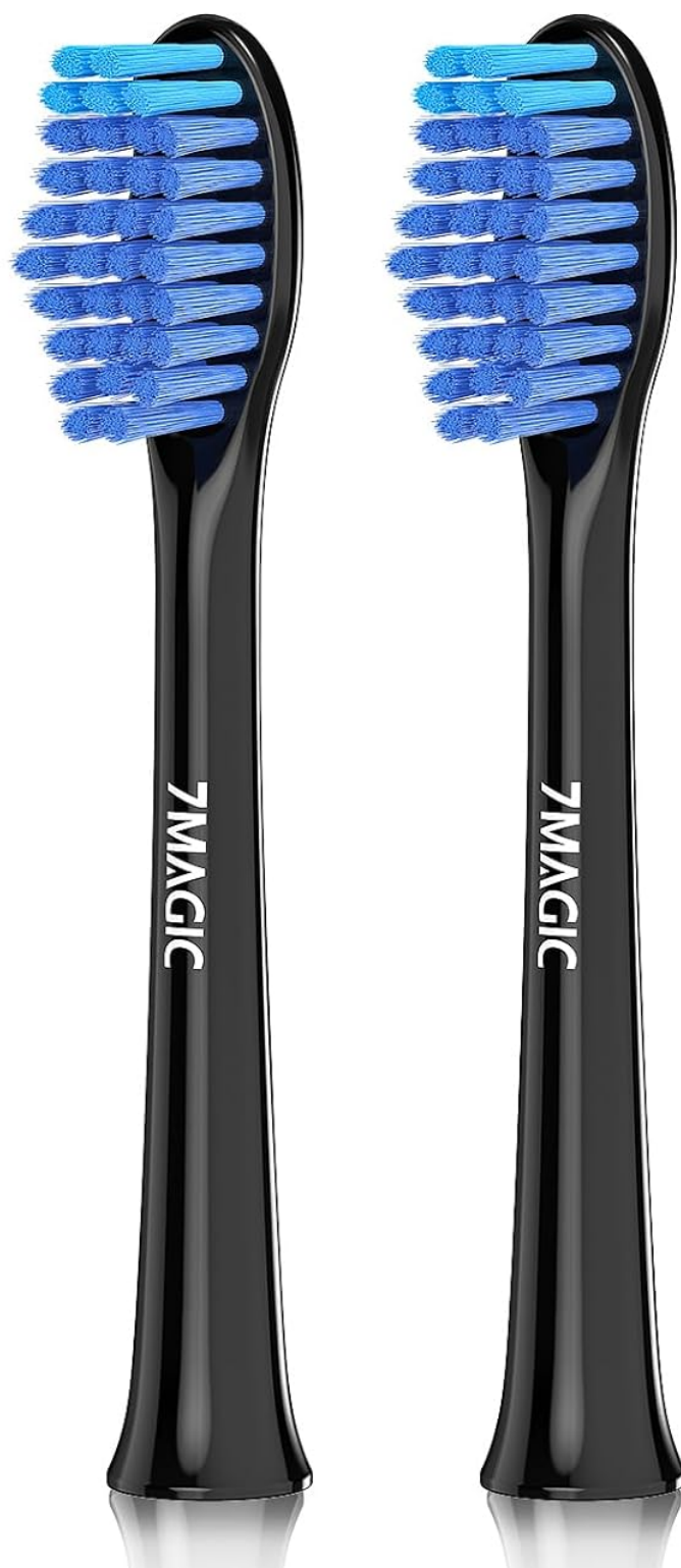
Image: Two 7MAGIC D36 Toothbrush Replacement Brush Heads, showing the product and its packaging.