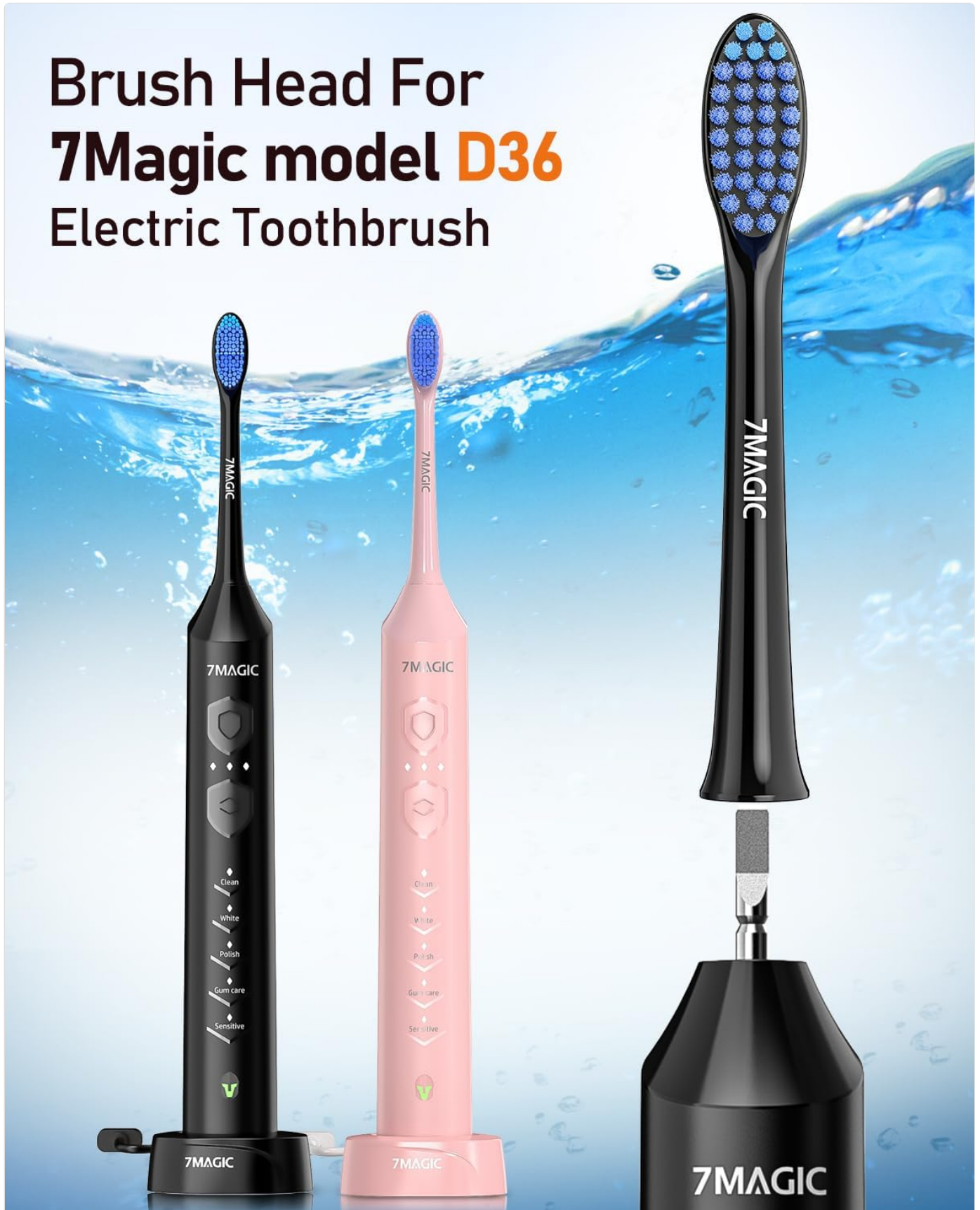
Image: The 7MAGIC D36 brush head displayed alongside the compatible black and pink 7MAGIC D36 electric toothbrush handles, illustrating proper fit.