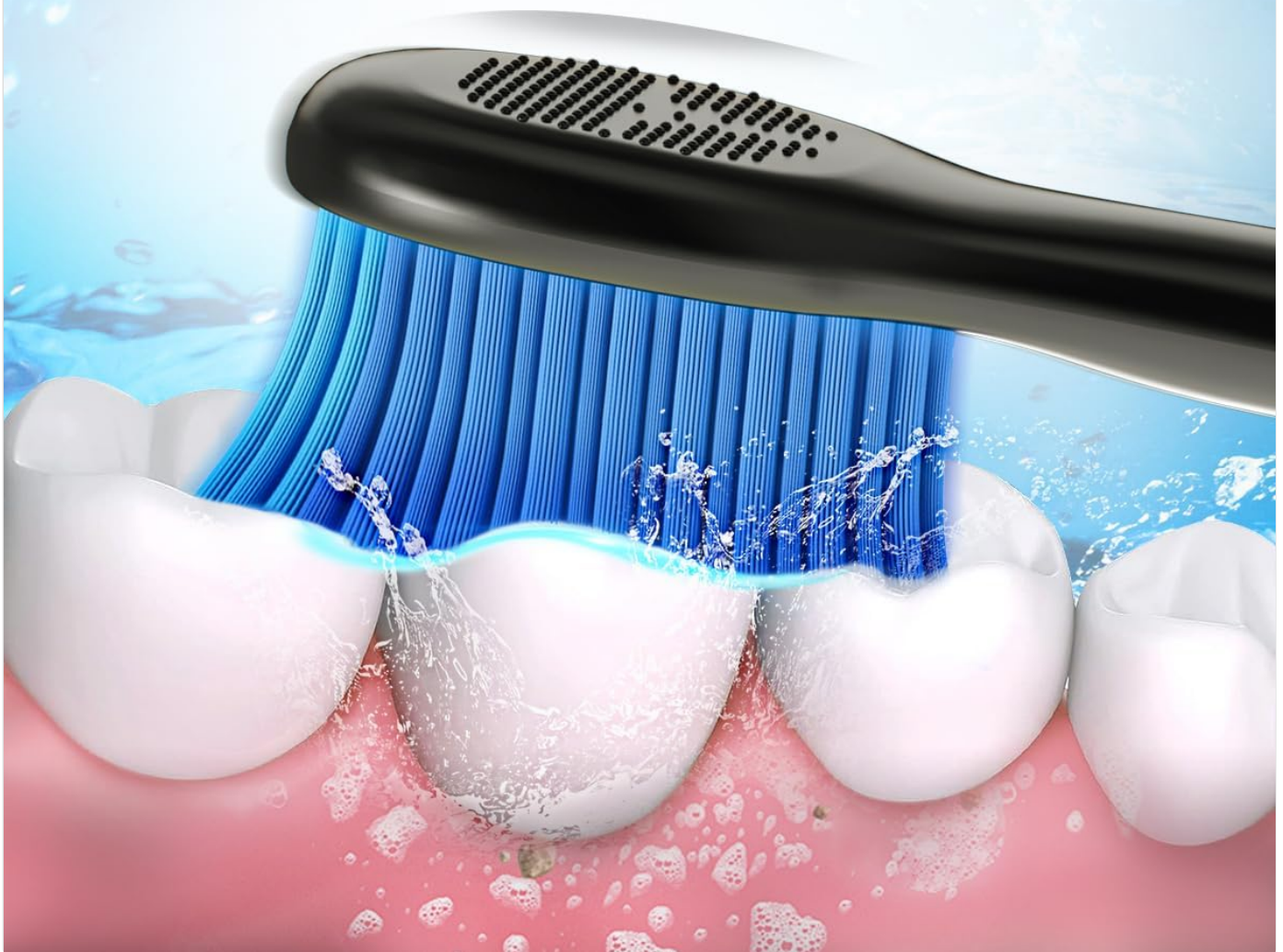
Image: An illustration highlighting the W-shaped dual-arch design of the bristles, explaining how it conforms to tooth surfaces for effective cleaning.

Conforms to tooth surfaces for effective cleaning