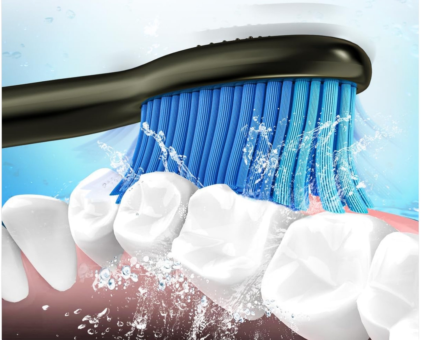
Image: A detailed view of the brush head in action, demonstrating its deep cleaning capabilities on tooth surfaces.

Removes 10x more plaque than manual brushes