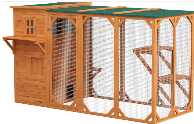
Image 1.1: Front view of the assembled PawHut Catio Outdoor Cat Enclosure.

Thank you for choosing the PawHut Catio Outdoor Cat Enclosure. This manual provides essential information for the safe assembly, operation, and maintenance of your new cat enclosure. Please read these instructions carefully before beginning assembly and retain them for future reference.