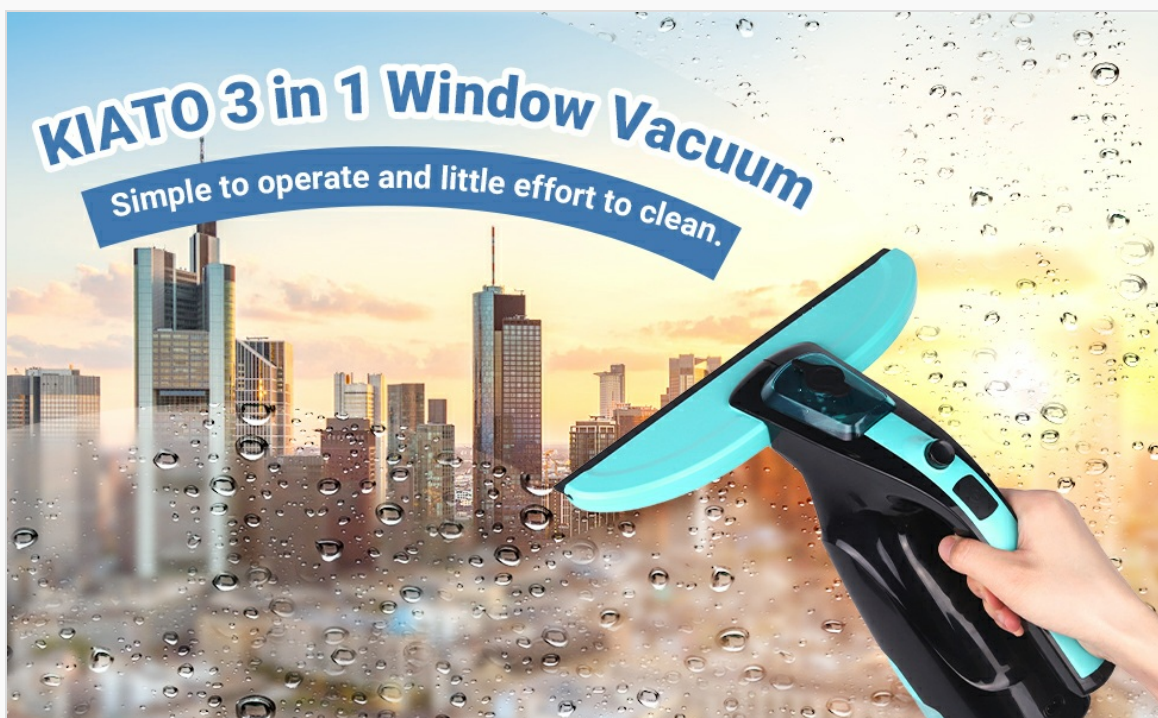
The Kiato 3-in-1 Window Vacuum Squeegee in action, demonstrating its ease of use and cleaning power.

This manual provides detailed instructions on how to set up, operate, and maintain your new window vacuum squeegee to ensure optimal performance and longevity.