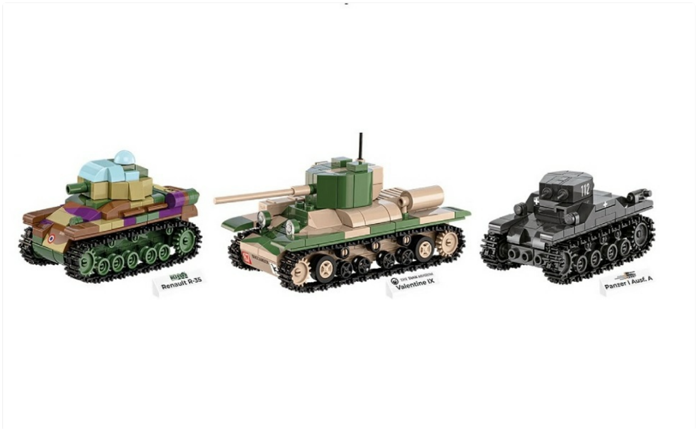
Figure 3: Assembled models of the Renault R35, Valentine IX, and Panzer I.