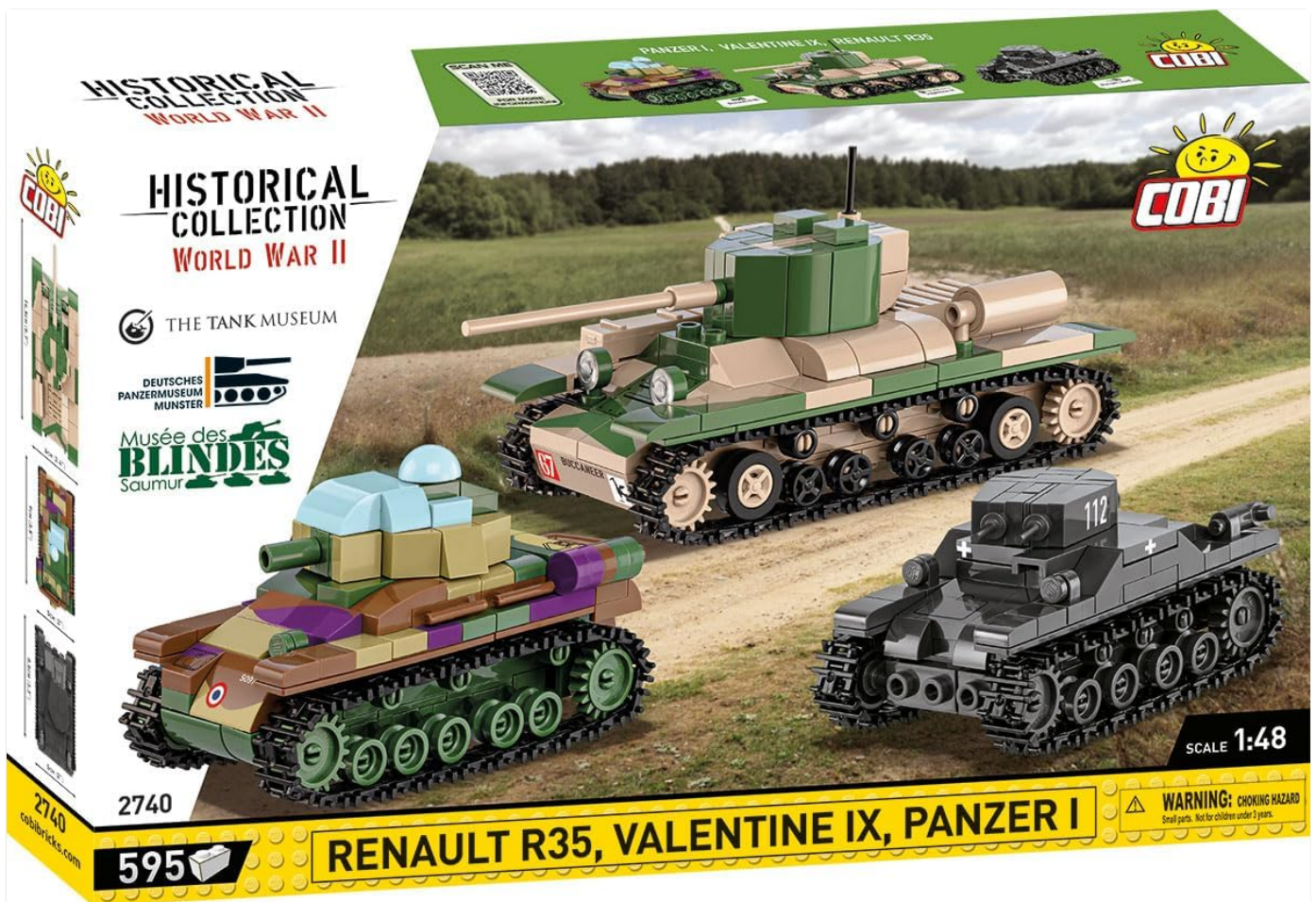
Figure 1: COBI 2740 Executive Museum Set packaging, displaying the three tank models.