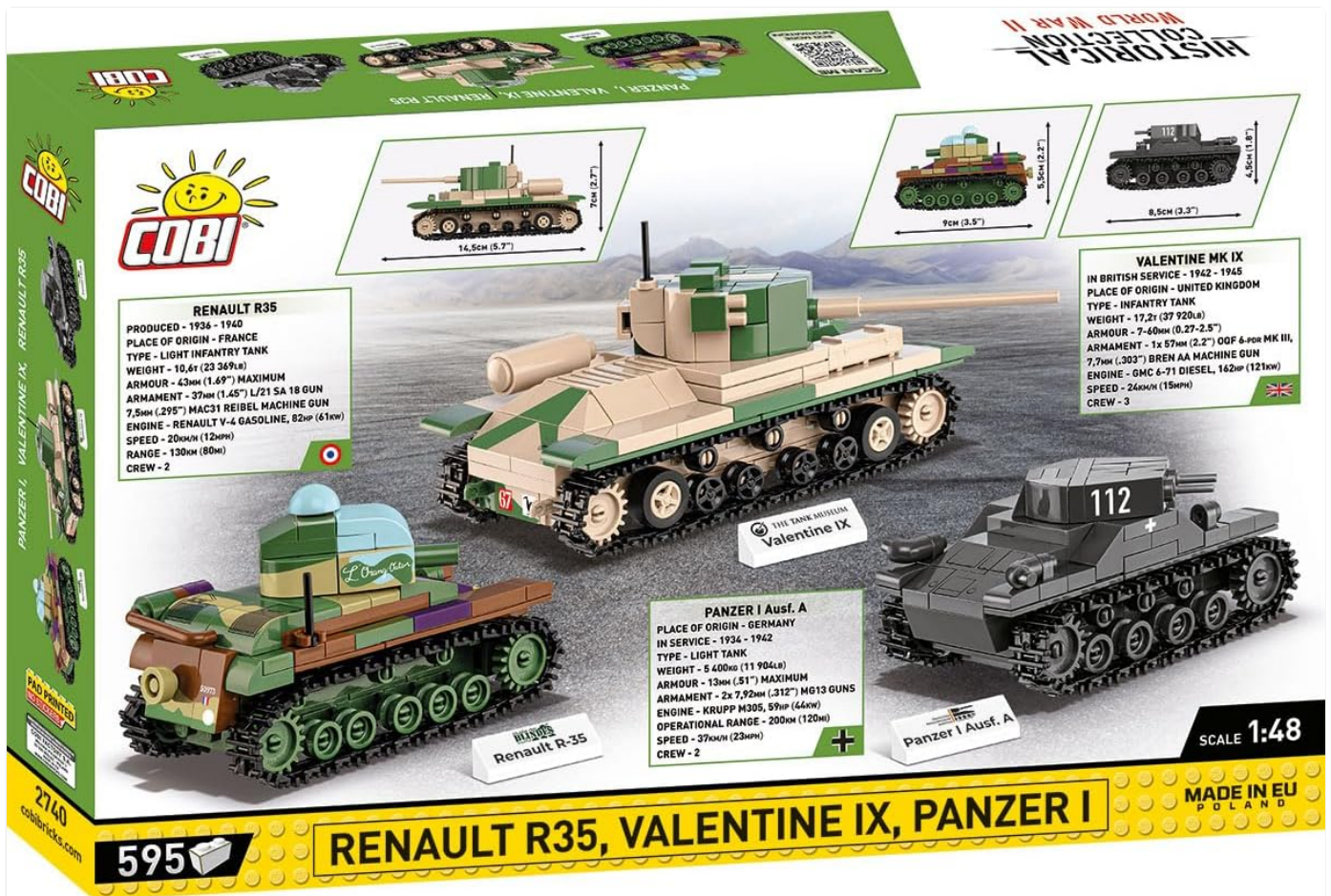
Figure 2: Rear packaging view with individual tank specifications.