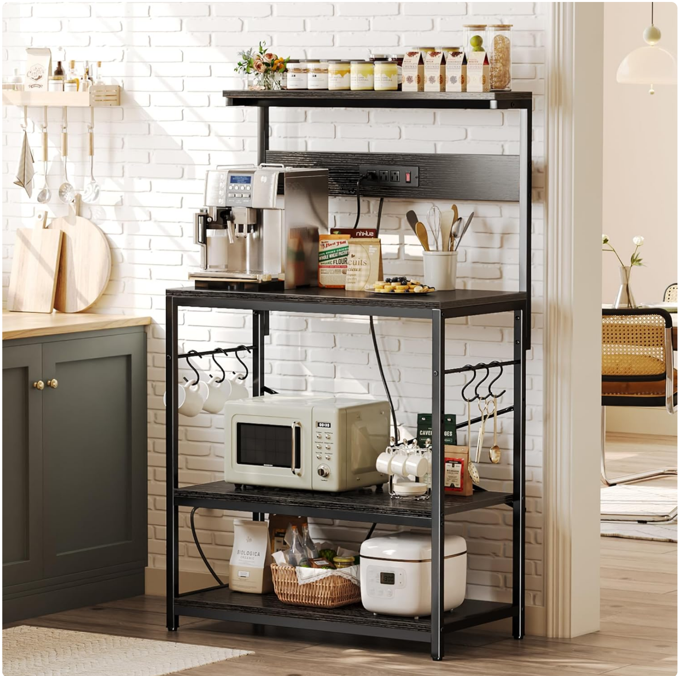
Image: The SUPERJARE Bakers Rack integrated into a kitchen, showcasing its utility as a microwave stand and coffee bar.