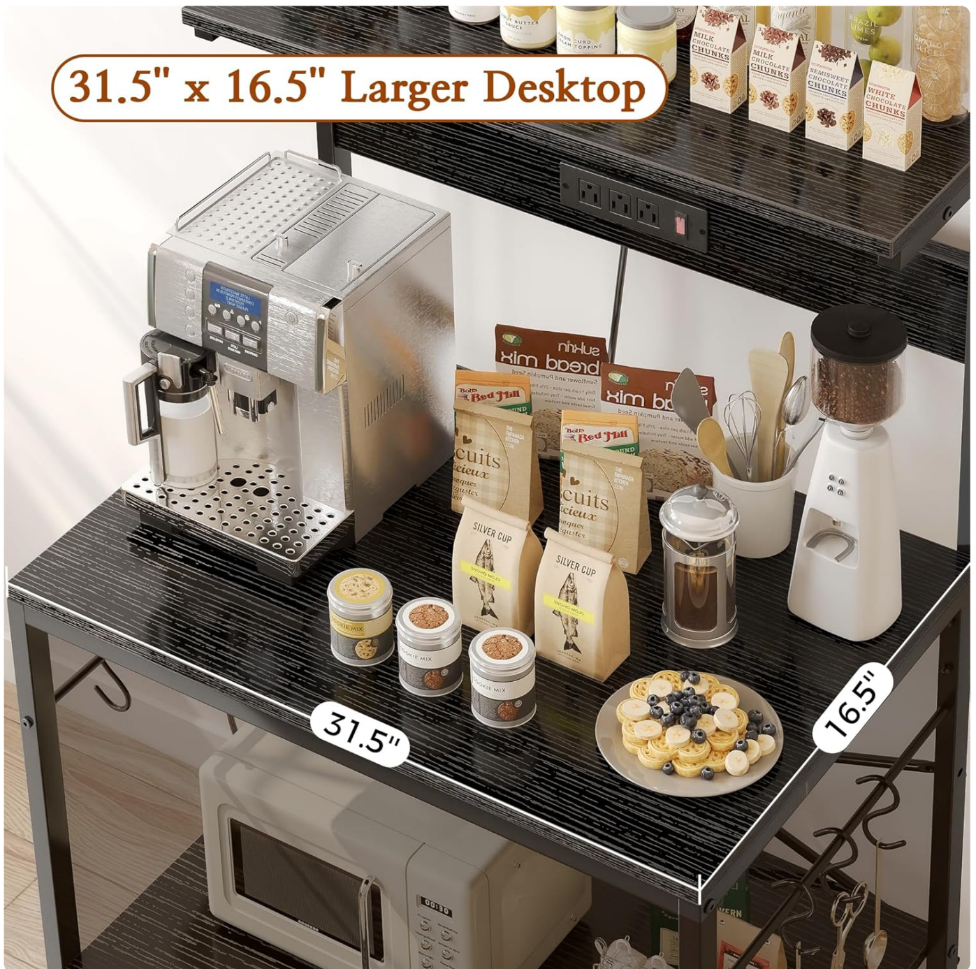
Image: The spacious desktop, ideal for various kitchen tasks and appliance placement.