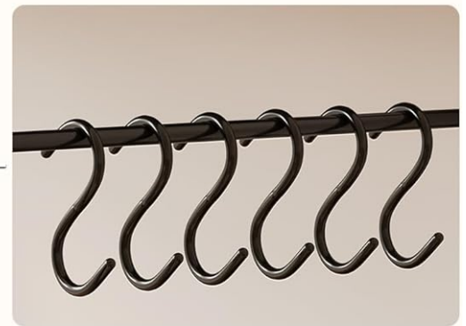
6 S-shaped Hooks