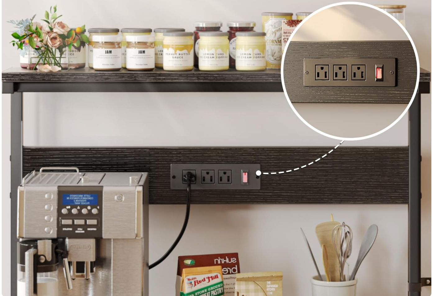
Image: Detail of the integrated power outlets with a safety switch, highlighting the electrical features.