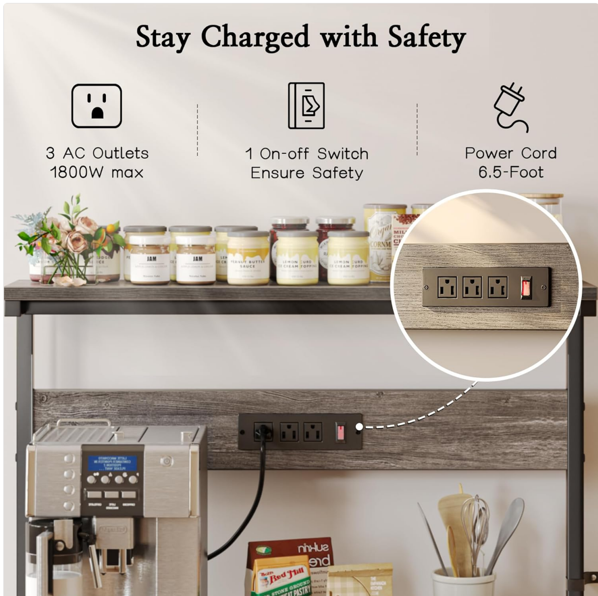
Image: A close-up view of the integrated power strip, showing three AC outlets and a red on/off safety switch, with appliances plugged in.