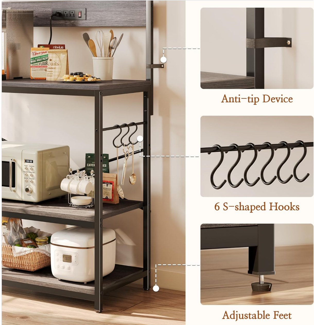
Image: A detailed view highlighting the anti-tip device for wall attachment, the six S-shaped hooks for hanging, and the adjustable feet for stability on uneven floors.