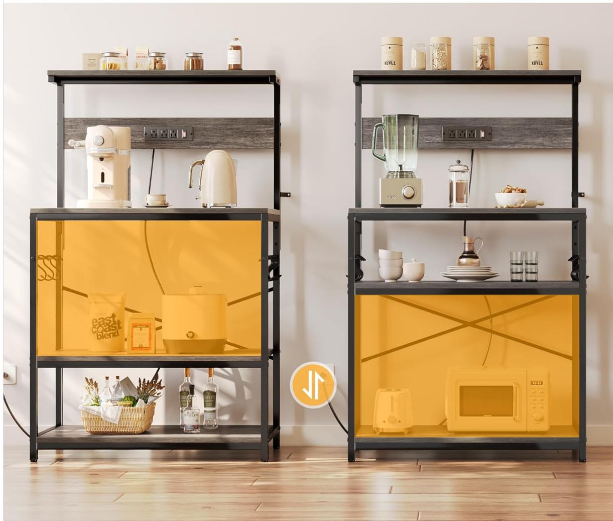
Image: A visual representation demonstrating the two possible height adjustments for the middle shelf, allowing for flexible storage of different-sized items.

2 level positions for storing different height items