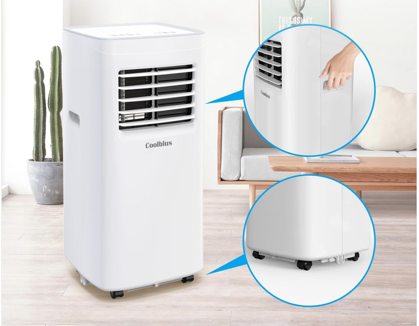
Image: Demonstrates the unit's mobility with 360-degree casters and easy-to-carry handles, highlighting its stress-free setup.

Experience a hassle-free installation with 360-degree casters, window slide bar, and adapter which can easily move from room to room with handles. And the 1.5m exhaust hose ensures optimal ventilation, efficiently expelling hot air.