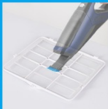
Vacuum or rinse with water is acceptable for cleaning