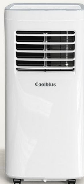
Image: Highlights the dehumidification capacity of approximately 19 liters per day, equivalent to about 9.5 two-liter PET bottles, emphasizing its effectiveness during rainy seasons.