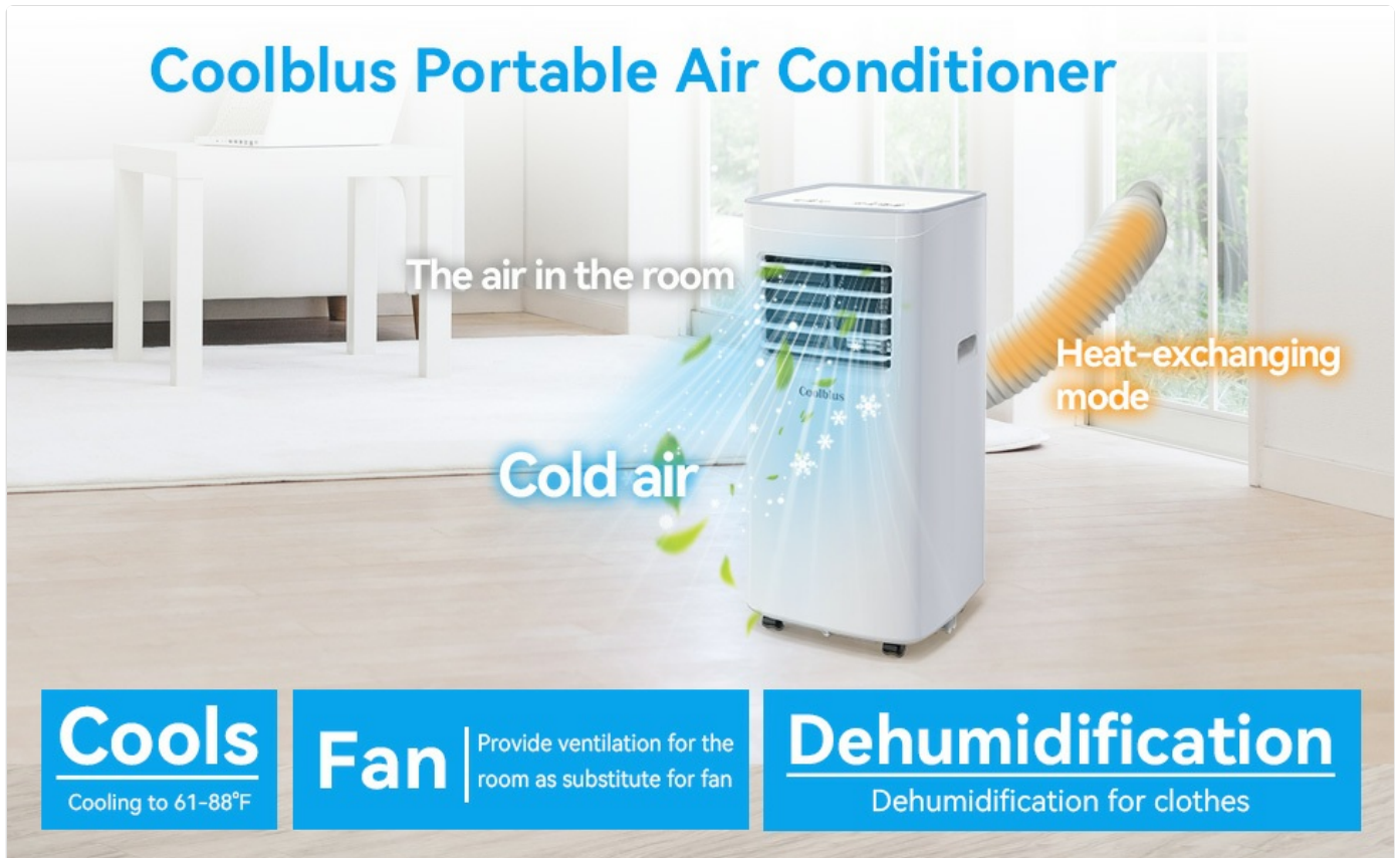
Image: Diagram showing the portable AC unit connected to a window via the exhaust hose and adjustable window panel, illustrating how heat is expelled outdoors.