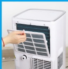
Remove the side air filter