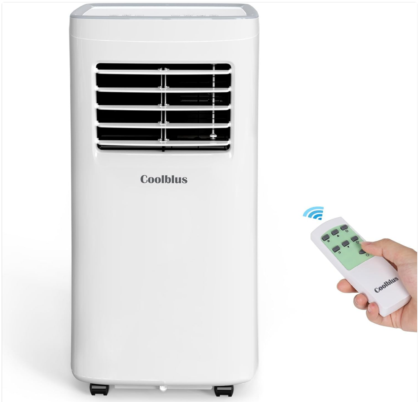
Image: The Coolblus A019K portable air conditioner in white, shown with its remote control.