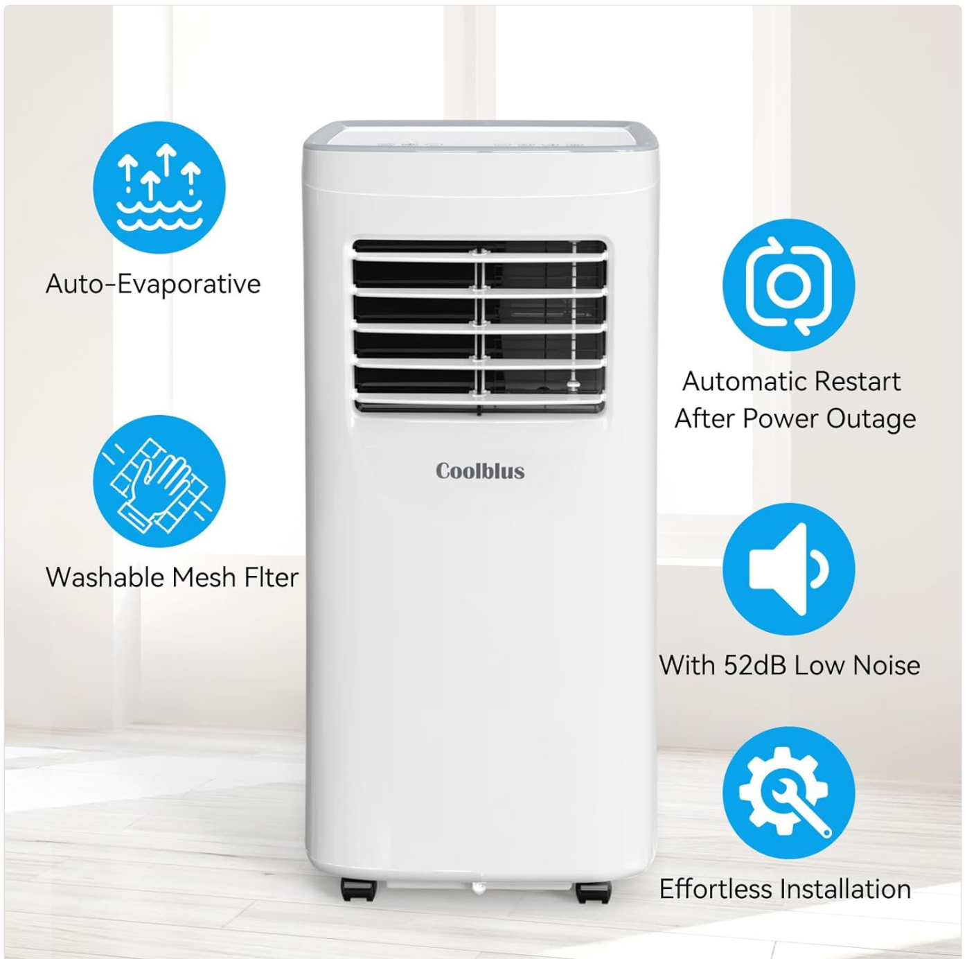
Image: Visual representation of key features including auto-evaporative system, automatic restart, washable mesh filter, 52dB low noise operation, and effortless installation.