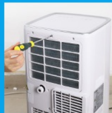
Remove the rear air filter with screwdriver

During the season, please clean the air filter every two weeks