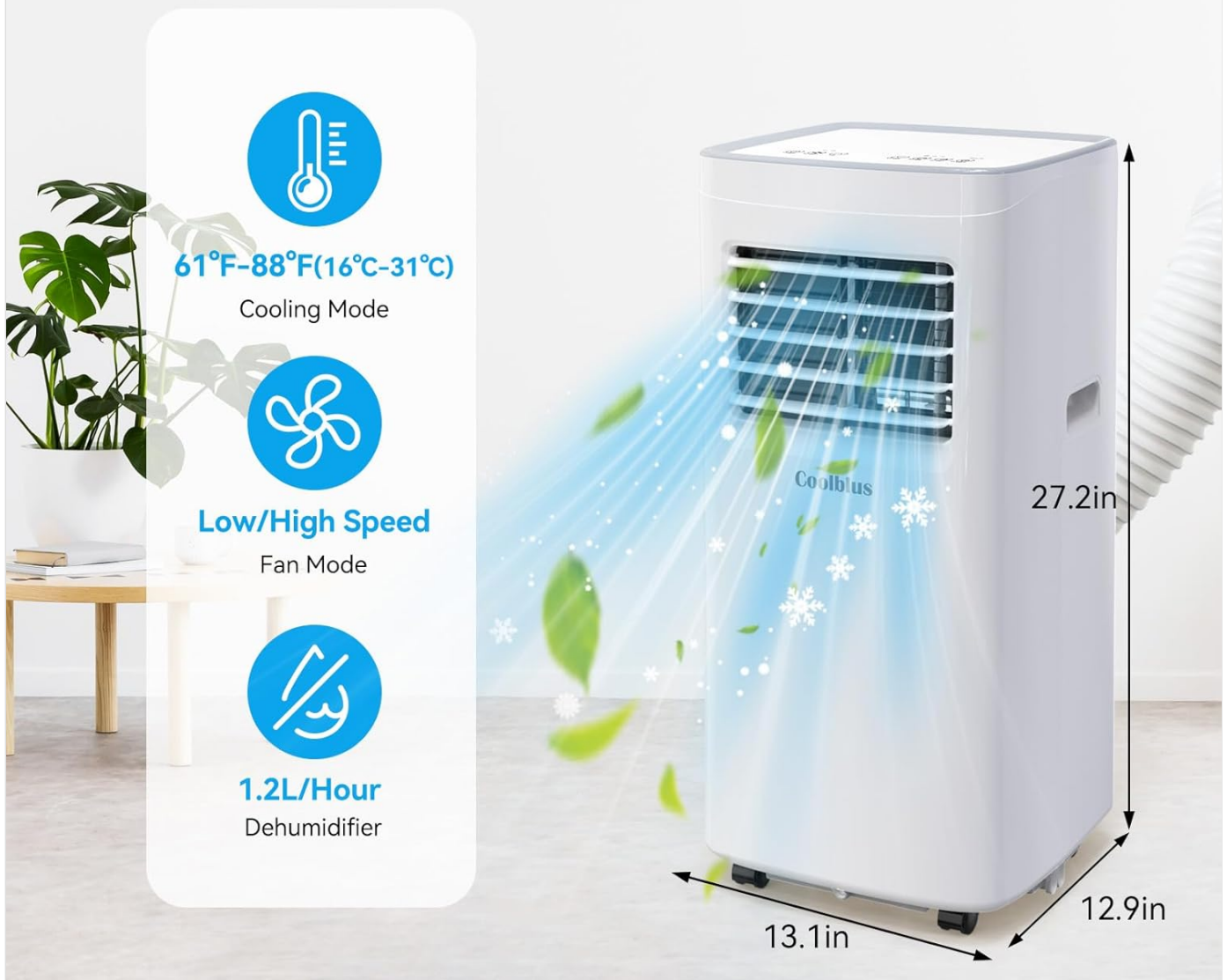
Image: Diagram illustrating the 3-in-1 functions (cooling, fan, dehumidifier) and the unit's dimensions (27.2in H, 13.1in D, 12.9in W).

Coolblus's 3-in-1 portable AC for ultimate climate control in your life!