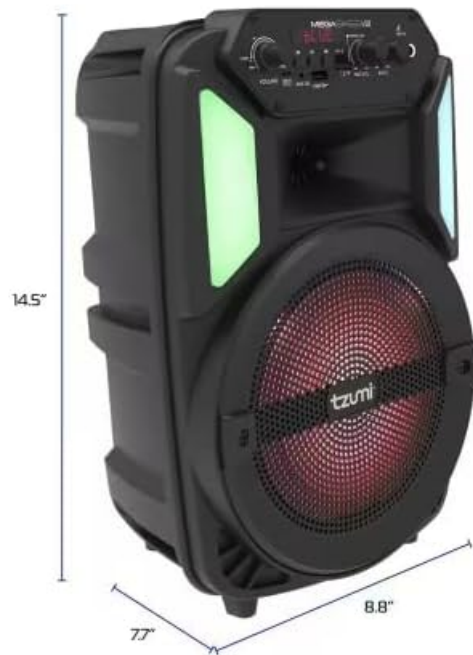
Image: Dimensions of the Megabass V3 speaker.