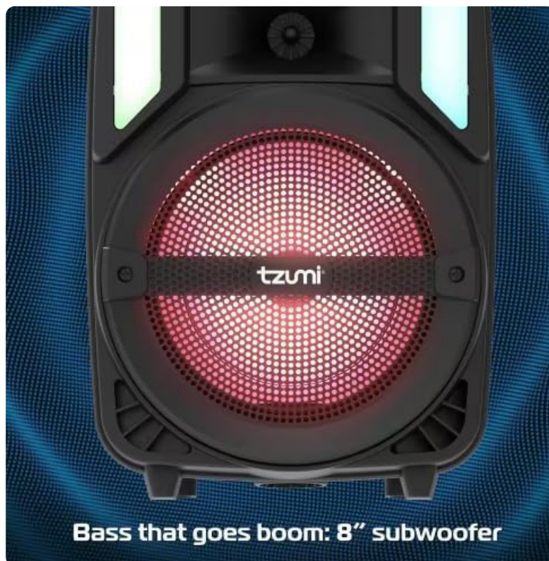
Image: The 8-inch subwoofer provides powerful sound output.

The Generic Megabass Jobsite Speaker V3 is a portable audio device designed for various environments. It features multiple connectivity options, integrated LED lighting, and a built-in rechargeable battery for cordless operation. The speaker includes an integrated handle for easy transport and supports microphone input for karaoke functions.