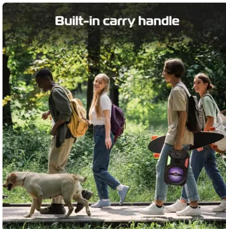
Image: The integrated carry handle allows for easy transportation of the speaker.