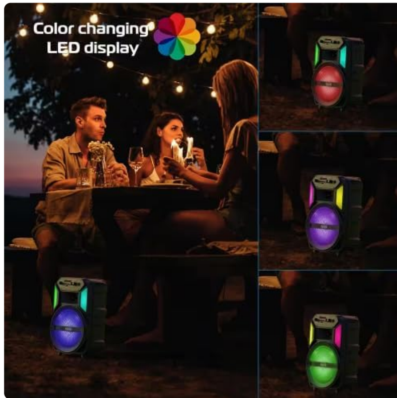
Image: The speaker's color-changing LED lights enhance the ambiance.

powered on. There is no specific control to turn them off or change patterns manually.