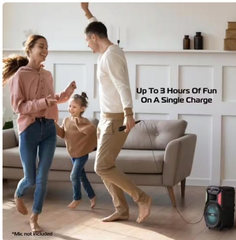
Image: The speaker can be charged via the Micro-USB port for cordless operation.