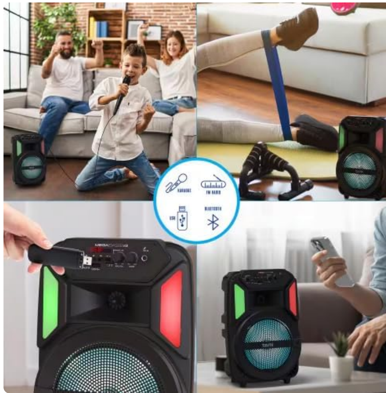
Image: The speaker offers versatile connectivity including Bluetooth, AUX, USB, and Micro-SD, suitable for various activities.