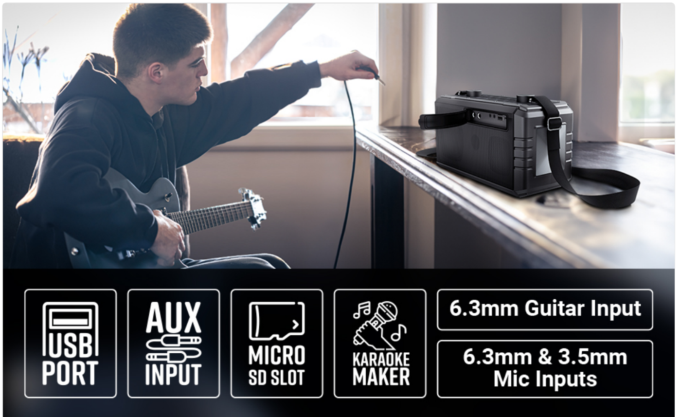
Image 8: Visual summary of the speaker's technical specifications.