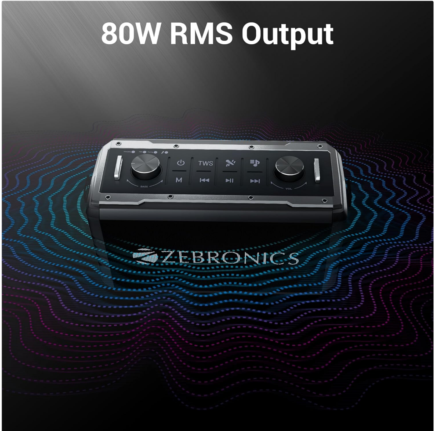
Image 1: Front view of the ZEBRONICS Music Bomb 2 Party Speaker, showcasing its grille and overall design.

The Music Bomb 2 features a robust design with intuitive controls and multiple connectivity options. Familiarize yourself with the various parts of the speaker.