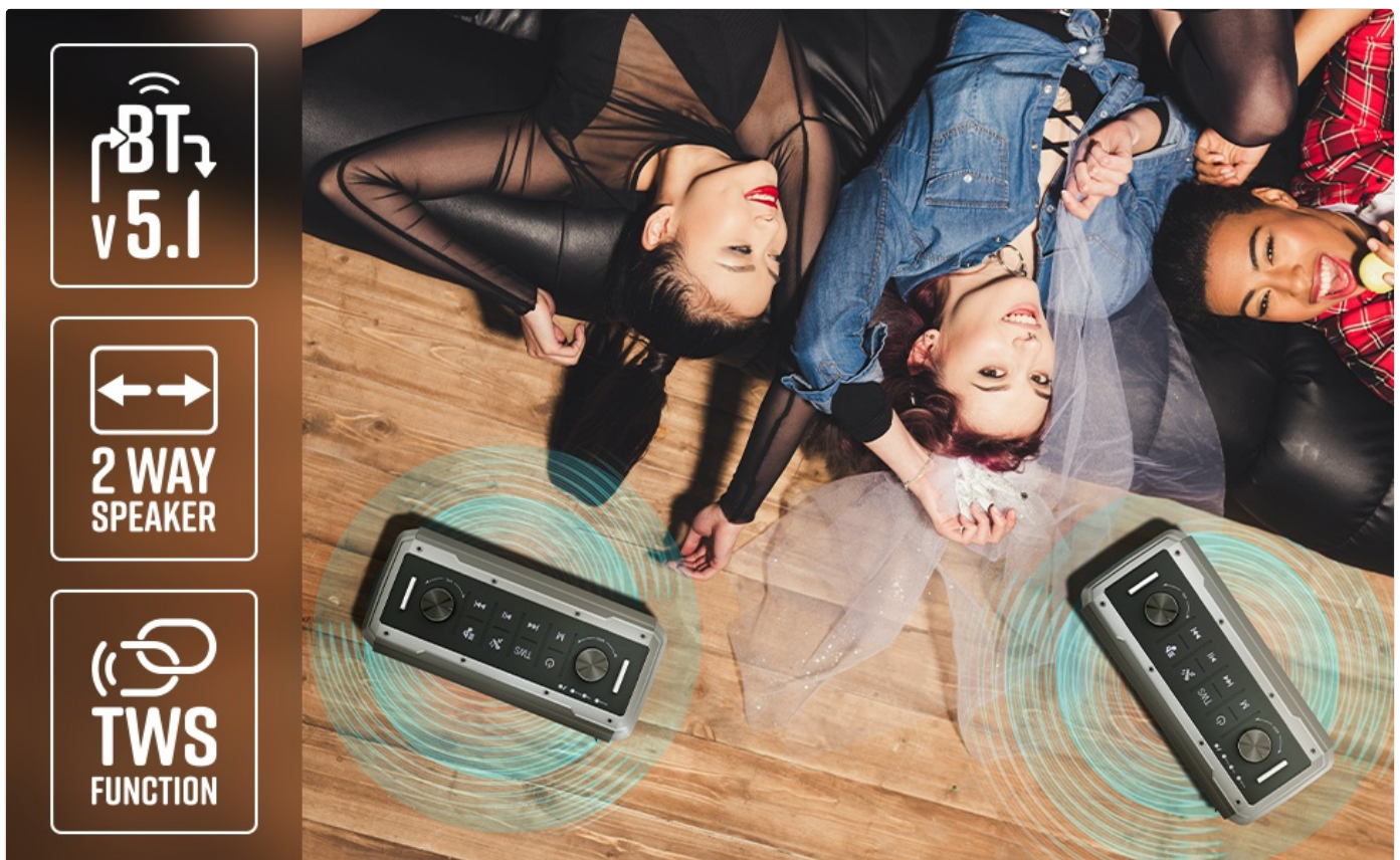
Image 7: Illustration of two Music Bomb 2 speakers paired using the TWS function for an immersive stereo audio experience.