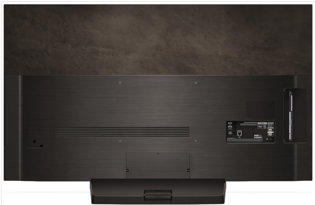
Image: Detailed view of the HDMI and USB input ports located on the side of the LG OLED C4 TV's rear panel, indicating connectivity options.

Connect your external devices such as cable boxes, gaming consoles, or Blu-ray players to the appropriate ports on the back of the TV. The LG C4 Series features four HDMI 2.1 inputs, supporting high-bandwidth connections for optimal performance.