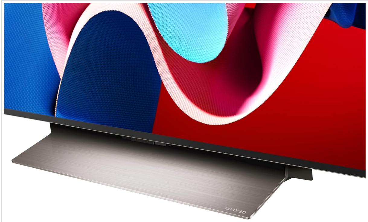
Image: Close-up view of the centralized pedestal stand for the LG OLED C4 TV, designed for stable placement on a flat surface.

Carefully remove all components from the packaging. Ensure all items listed in the "What's in the Box" section are present. You can choose to install the TV on its included stand or mount it on a wall.