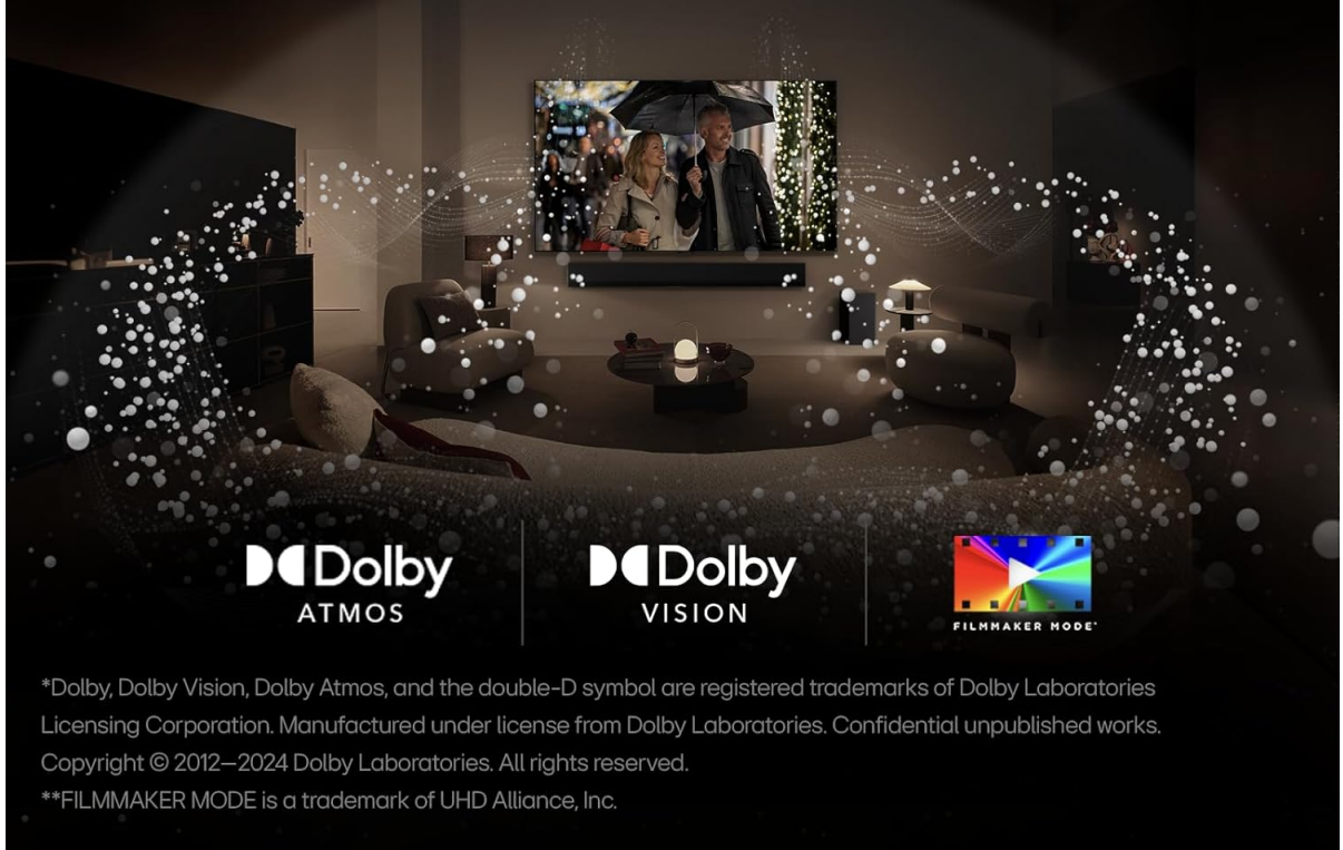
Image: Scene depicting a living room with an LG OLED TV displaying a movie, emphasizing Dolby Atmos, Dolby Vision, and FILMMAKER MODE for an immersive audio-visual experience.

Dolby Vision™ for extraordinary color, Dolby Atmos®* for sound you can feel all around you and land in the center of the action as the director intended with FILMMAKER MODE™.