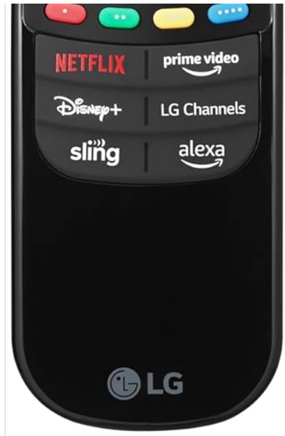
Image: The LG Magic Remote MR24, featuring a full keypad, directional pad, and dedicated buttons for streaming services like Netflix and Prime Video.