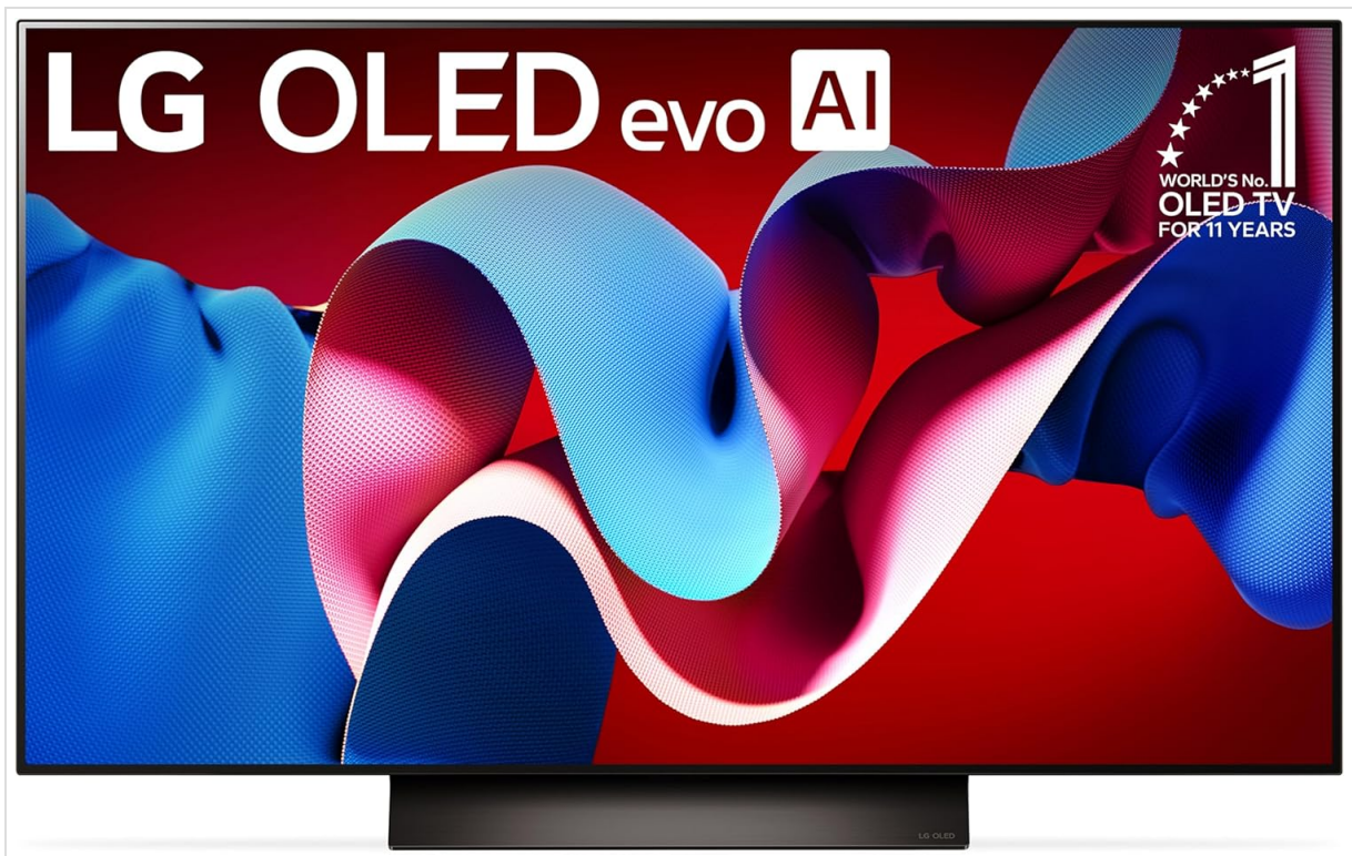
Image: Front view of the LG 48-Inch Class OLED evo C4 Series Smart TV, showcasing its sleek design and vibrant display.

Welcome to the user manual for your LG 48-Inch Class OLED evo C4 Series Smart TV. This manual provides essential information for setting up, operating, maintaining, and troubleshooting your television. The LG OLED evo C4 Series offers an exceptional viewing experience with its self-lit pixels, advanced AI processing, and comprehensive smart features.