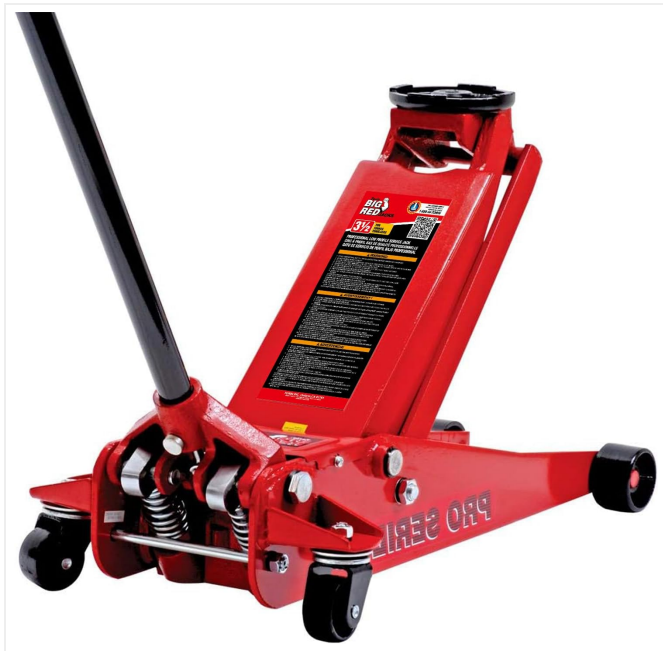
Figure 1: Front view of the BIG RED T83505-2 Floor Jack. This image shows the overall design, including the lifting arm, saddle, and front wheels.