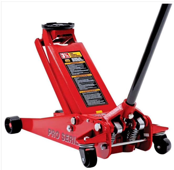
Figure 2: Side view of the floor jack with the handle inserted. This perspective highlights the low-profile design and the handle's attachment point.