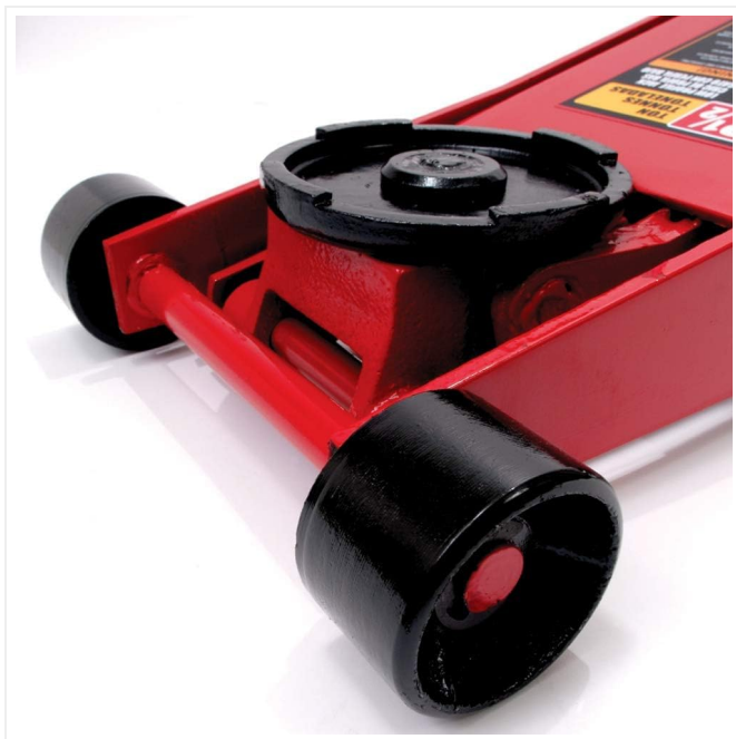
Figure 5: Close-up of the rear 360-degree swivel casters and the lifting saddle, designed for smooth positioning and secure load contact.

The jack features a large steel saddle for secure contact with the vehicle's lifting point, a long handle for leverage and control, and durable steel and swivel casters for easy movement. The dual piston quick lift pump significantly reduces the number of strokes required to lift a load.