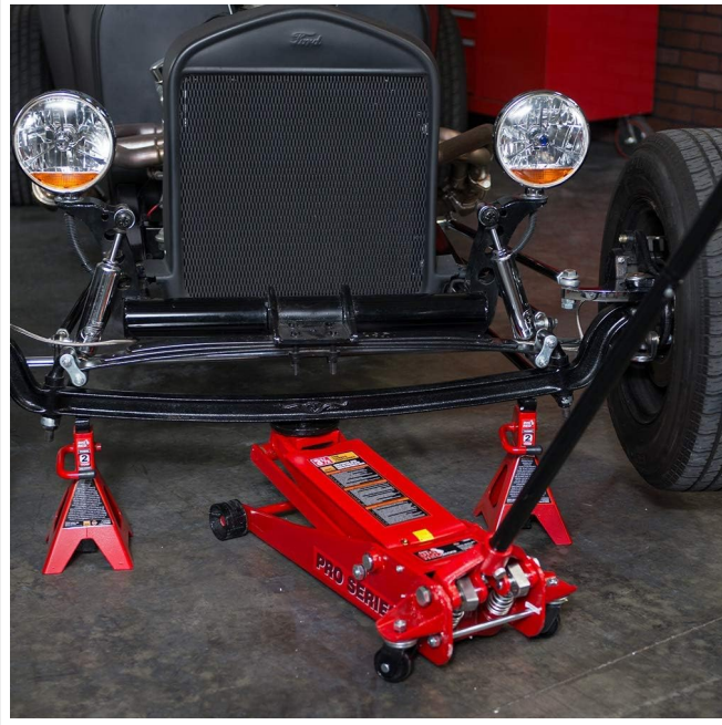
Figure 6: The floor jack correctly positioned under a vehicle's front axle, with additional jack stands providing crucial support. Always use jack stands when working under a vehicle.

6. Remove the Jack: Once the vehicle is fully lowered and resting on its wheels, remove the floor jack.