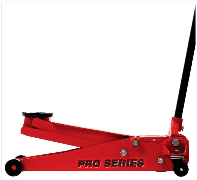
Figure 3: The floor jack in its fully lowered position, showcasing its minimal height for accessing low-clearance vehicles.