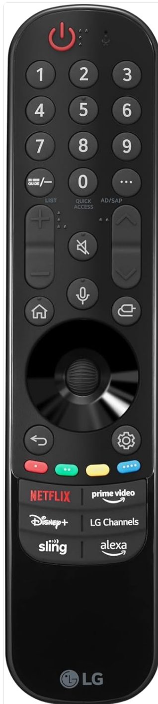
Image: The LG Magic Remote MR24, highlighting its ergonomic design and key buttons.