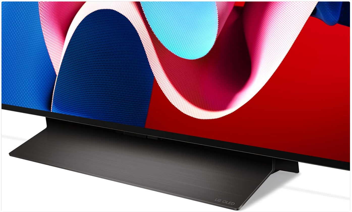
Image: Close-up view of the TV stand, highlighting its design and stability.