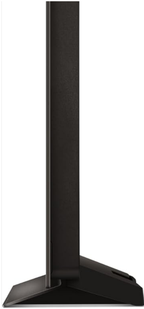
Image: Side profile of the LG OLED evo C4 TV, demonstrating its ultra-thin design.