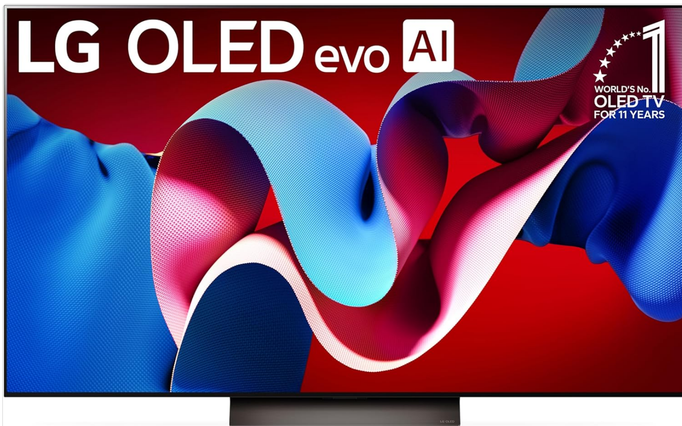
Image: Front view of the LG 55-Inch Class OLED evo C4 Series Smart TV.

This user manual provides essential information for the setup, operation, maintenance, and troubleshooting of your LG 55-Inch Class OLED evo C4 Series Smart TV. Please read this manual thoroughly before using your TV to ensure proper and safe operation.