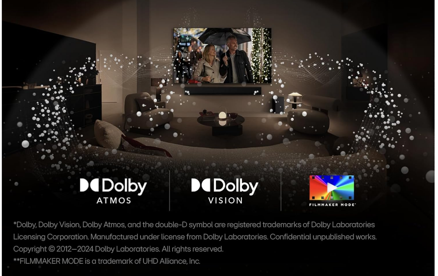
Image: A living room scene with the LG OLED TV displaying vibrant content, accompanied by Dolby Atmos, Dolby Vision, and Filmmaker Mode logos.

Dolby Vision™ for extraordinary color, Dolby Atmos®* for sound you can feel all around you and land in the center of the action as the director intended with FILMMAKER MODE™.