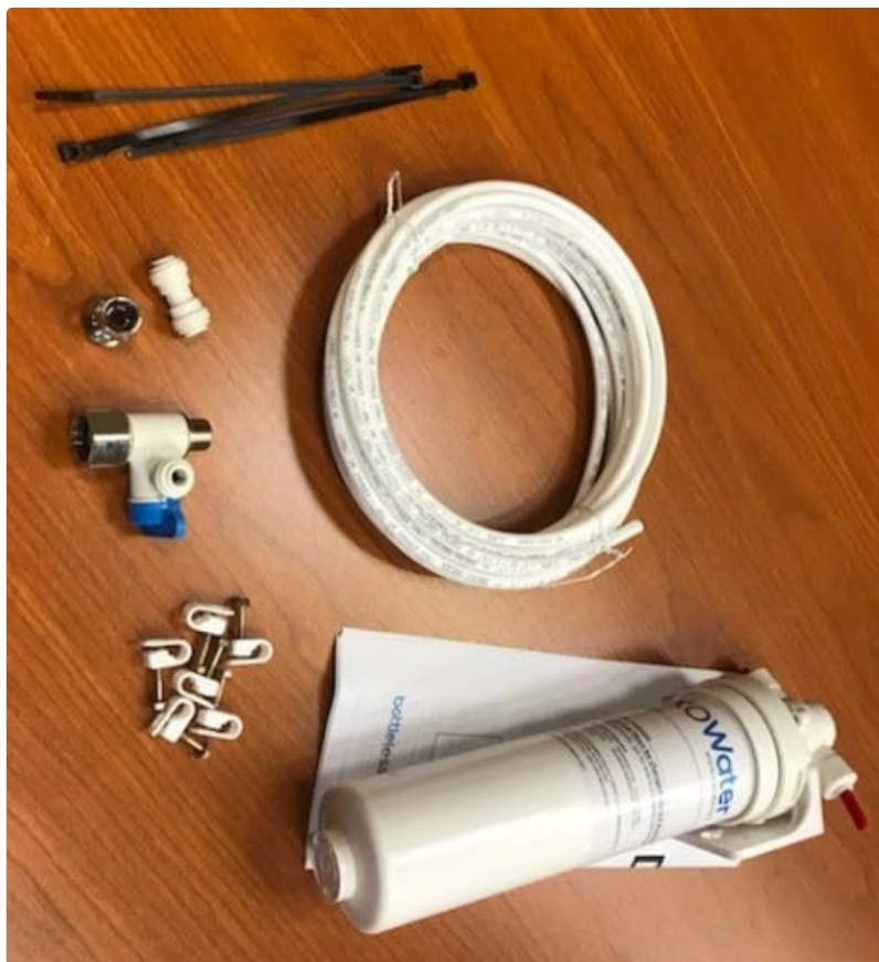
Figure 2: Included installation kit components.