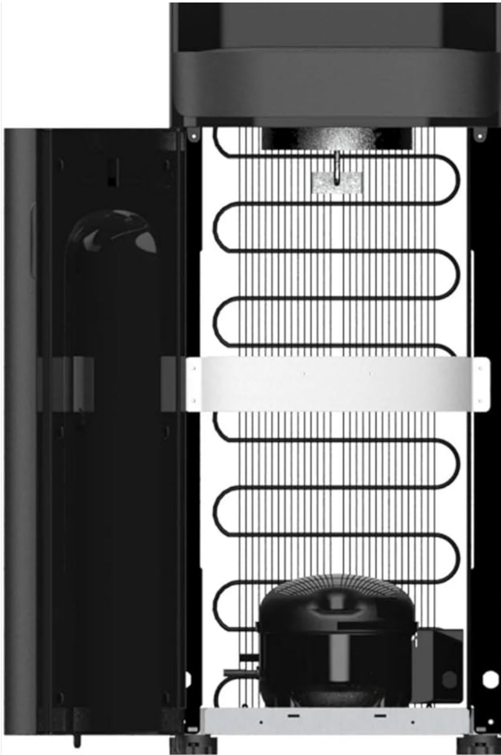
Figure 1: Front view of the CLOVER D25-B-TL Water Cooler Dispenser.