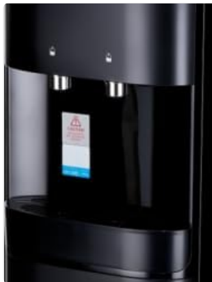
Figure 4: Detail of the touchless dispense spouts and sensors.