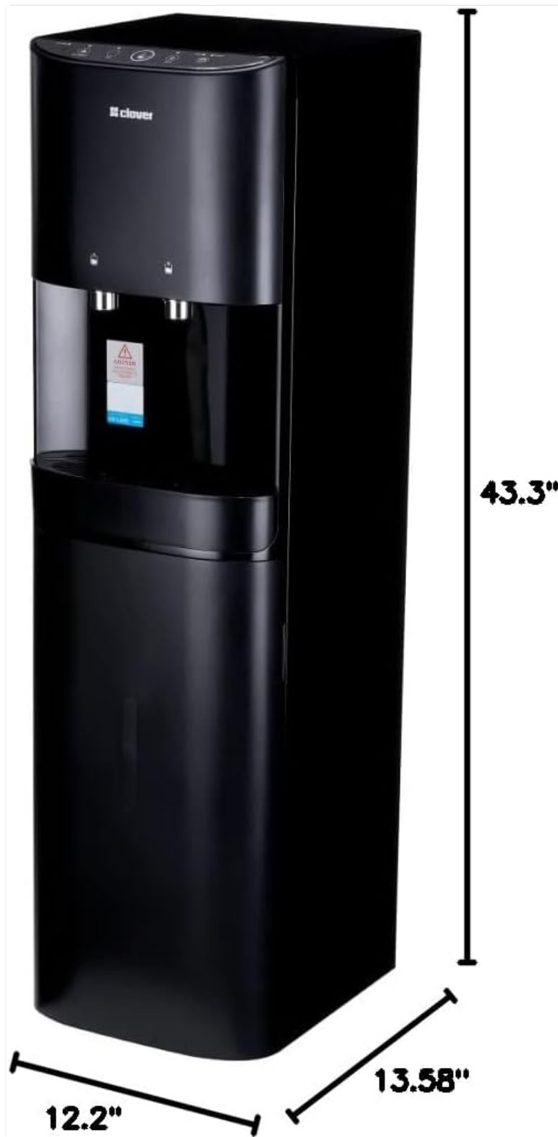
Figure 5: Product dimensions for placement reference.