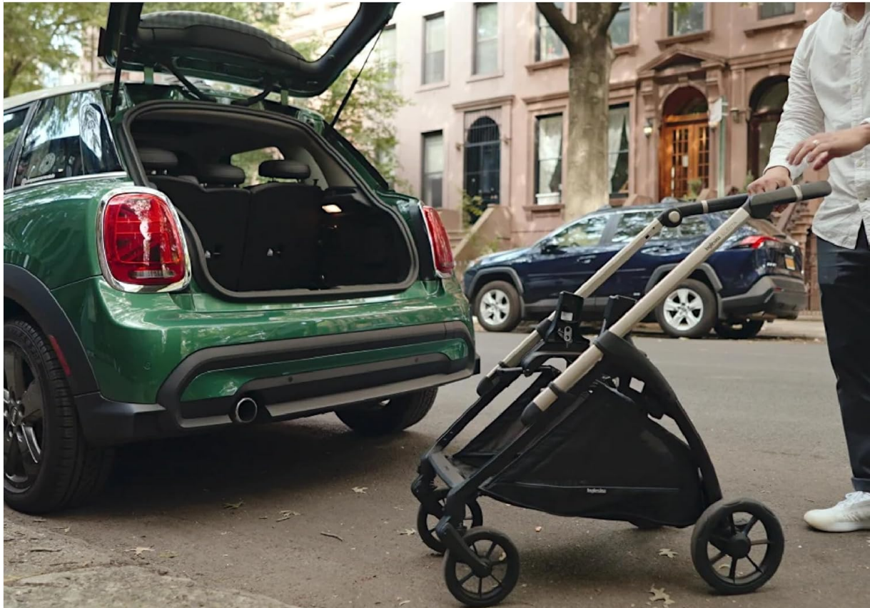
Image: The Electa stroller being folded with the car seat adapter still attached.

No need to remove the adapter to fold the stroller frame