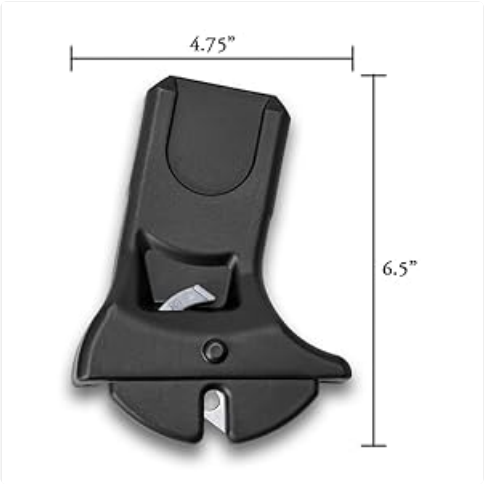
Image: Dimensions of the Inglesina Electa Car Seat Adapter.