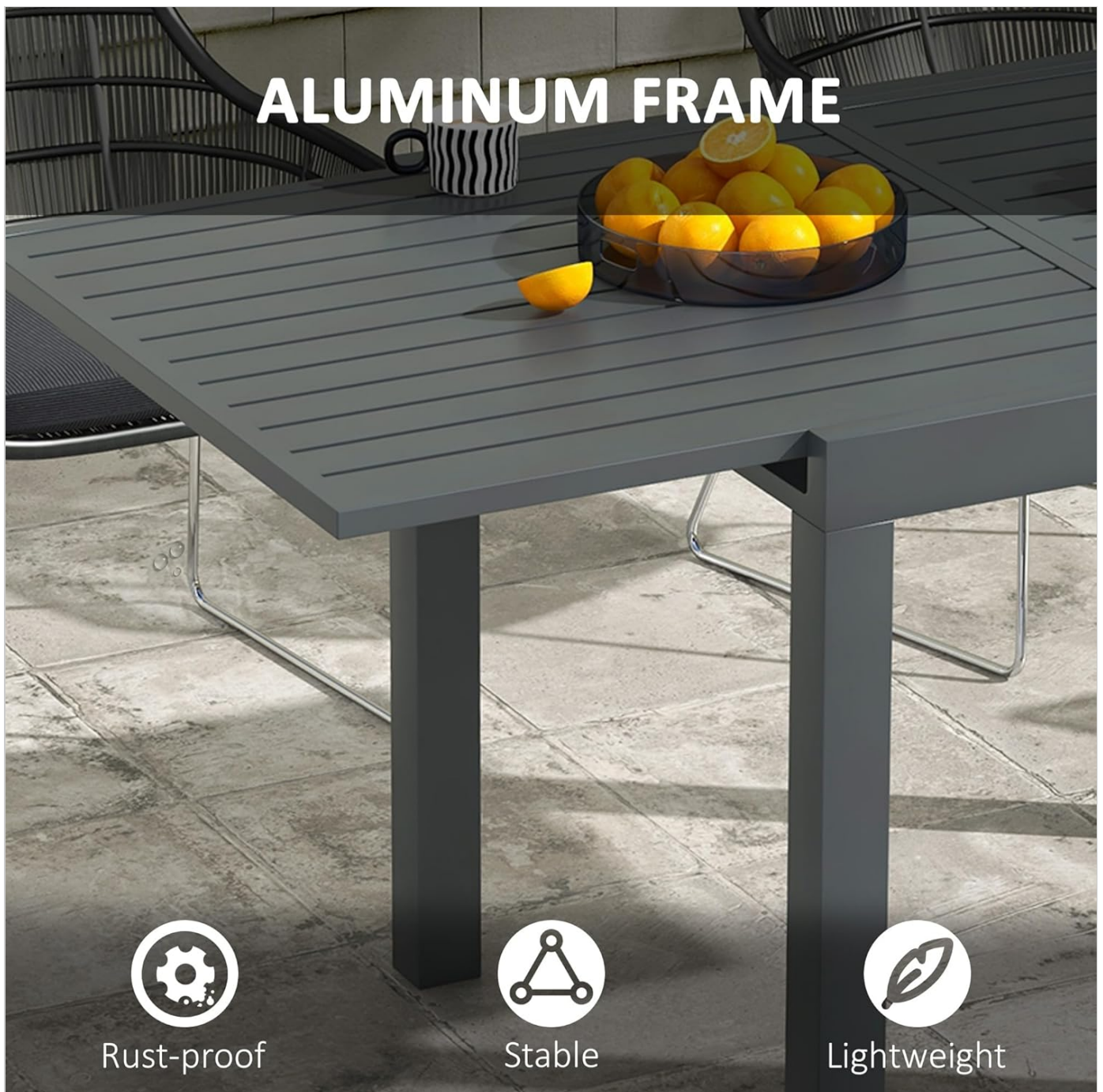
Image: Aluminum frame detail, showing stability and lightweight design.