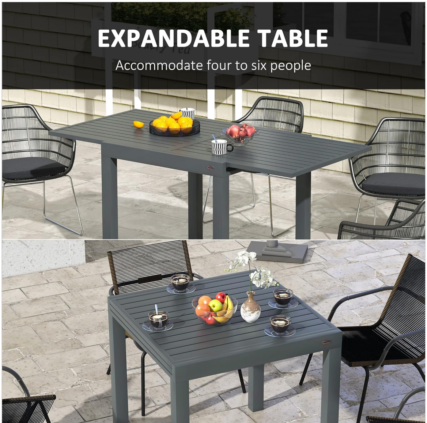
Image: Table in expanded configuration, accommodating more people.