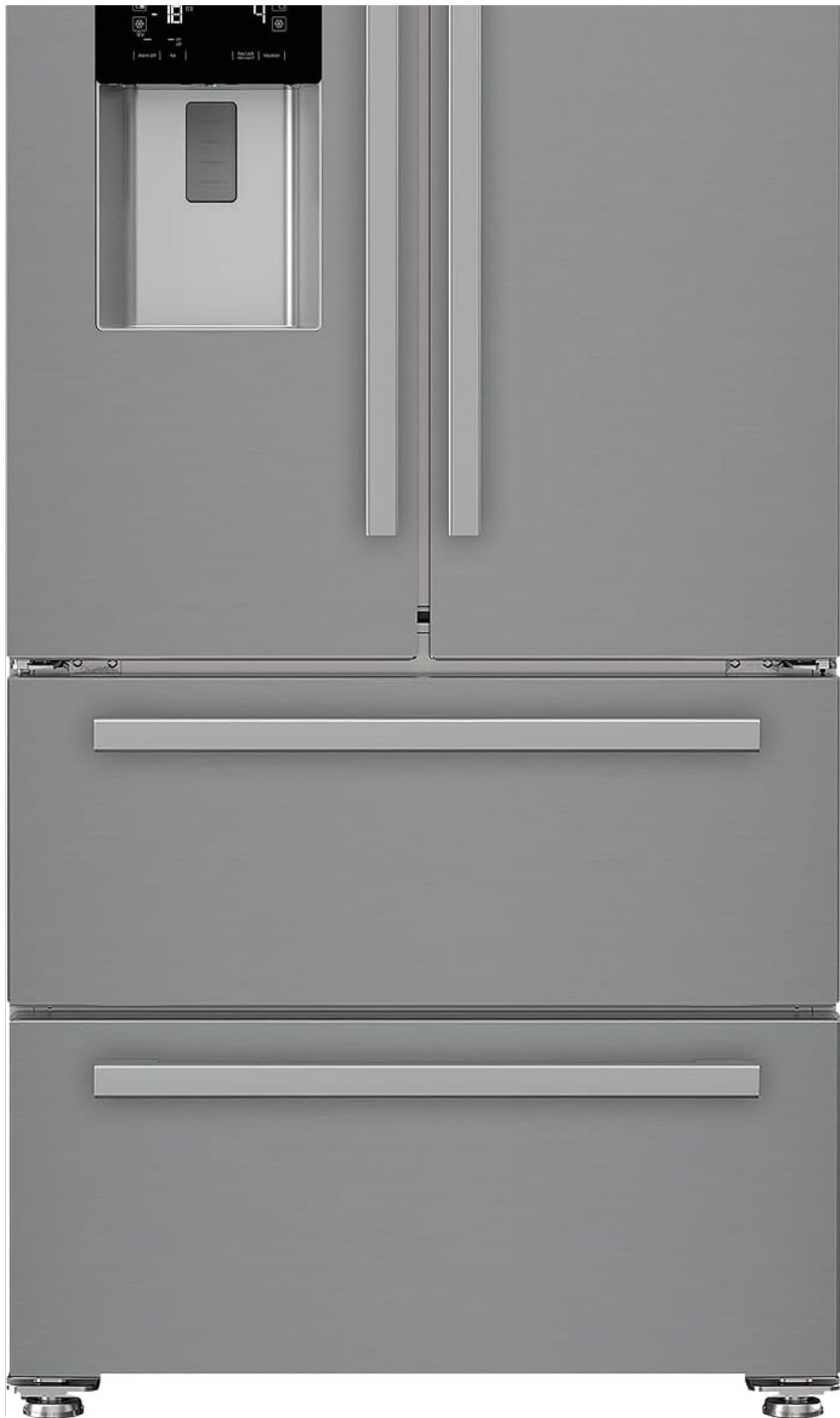
Figure 1: Front view of the Beko GNE60542DXPN refrigerator. This image displays the appliance's sleek stainless steel finish, the four-door design (two upper, two lower drawers), and the integrated water and ice dispenser located on the upper left door. The digital display on the dispenser shows temperature settings for both the freezer (-18°C) and refrigerator (4°C) compartments.