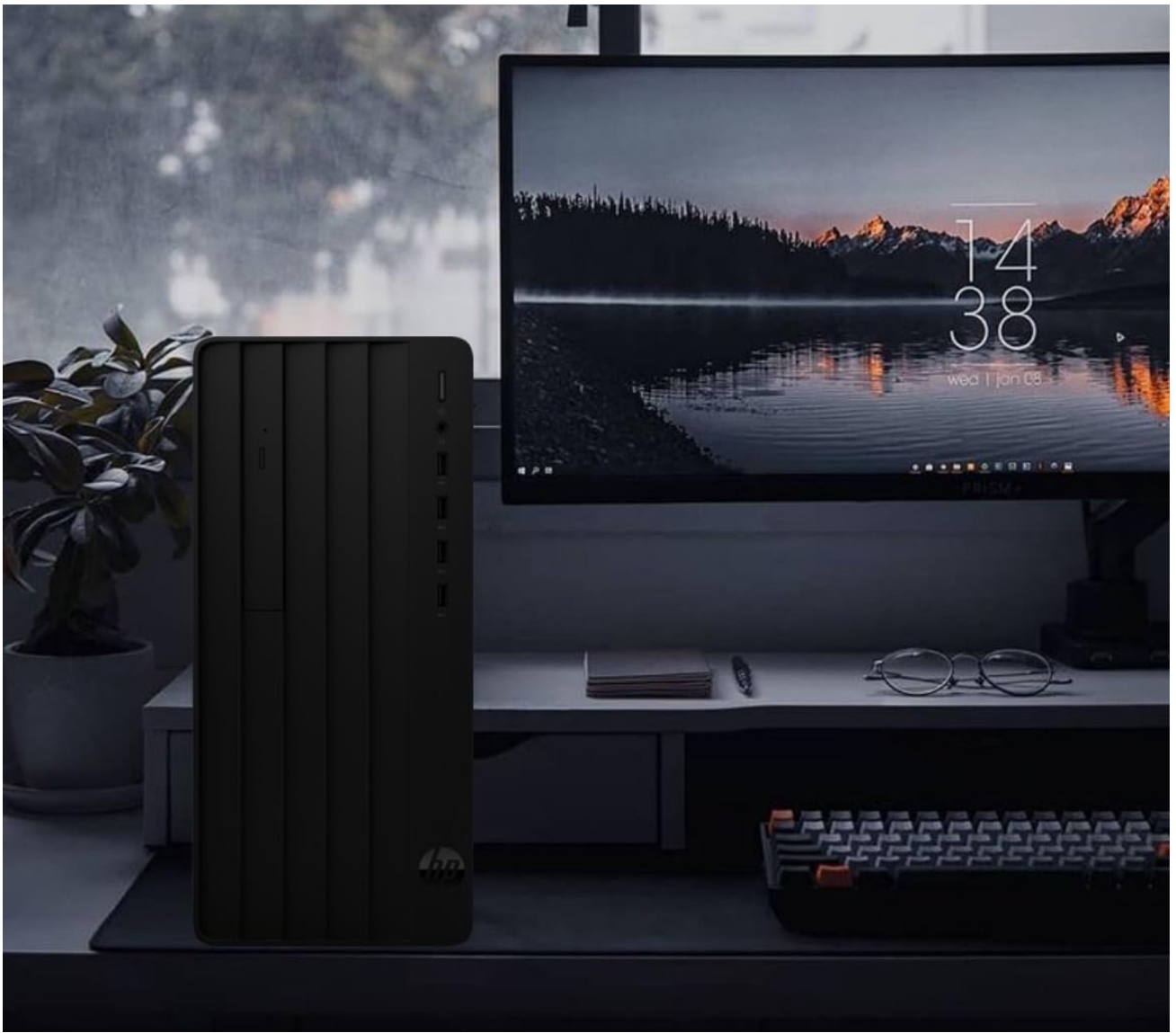
This image displays the HP Business Tower Desktop positioned on a desk, connected to a monitor, keyboard, and mouse, illustrating a typical workstation setup.