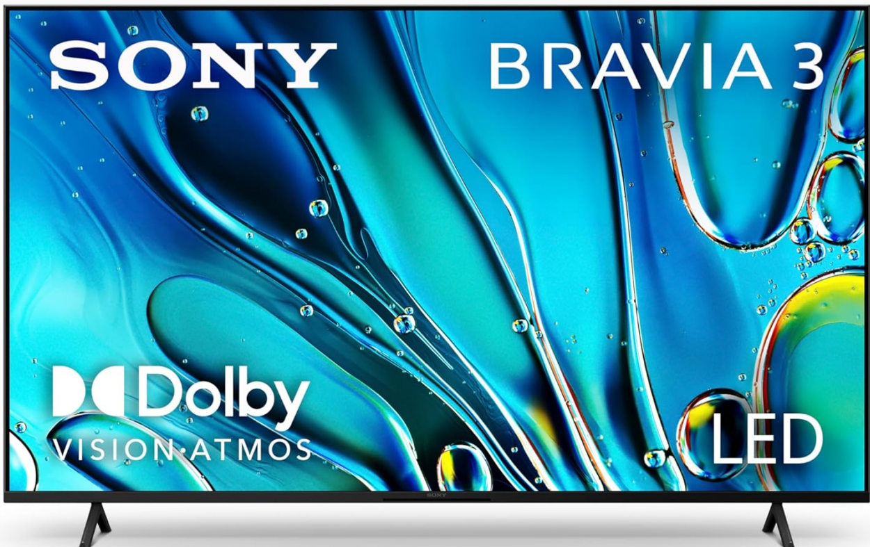
Figure 1: Front view of the Sony BRAVIA 3 55-inch 4K Ultra HD LED Smart TV.

This manual provides essential information for setting up, operating, and maintaining your Sony BRAVIA 3 55-Inch 4K Ultra HD LED Smart TV. Designed for an immersive viewing experience, this television integrates Google TV and Google Assistant, offering cutting-edge visuals and smart features. Please read this manual thoroughly before using your television.