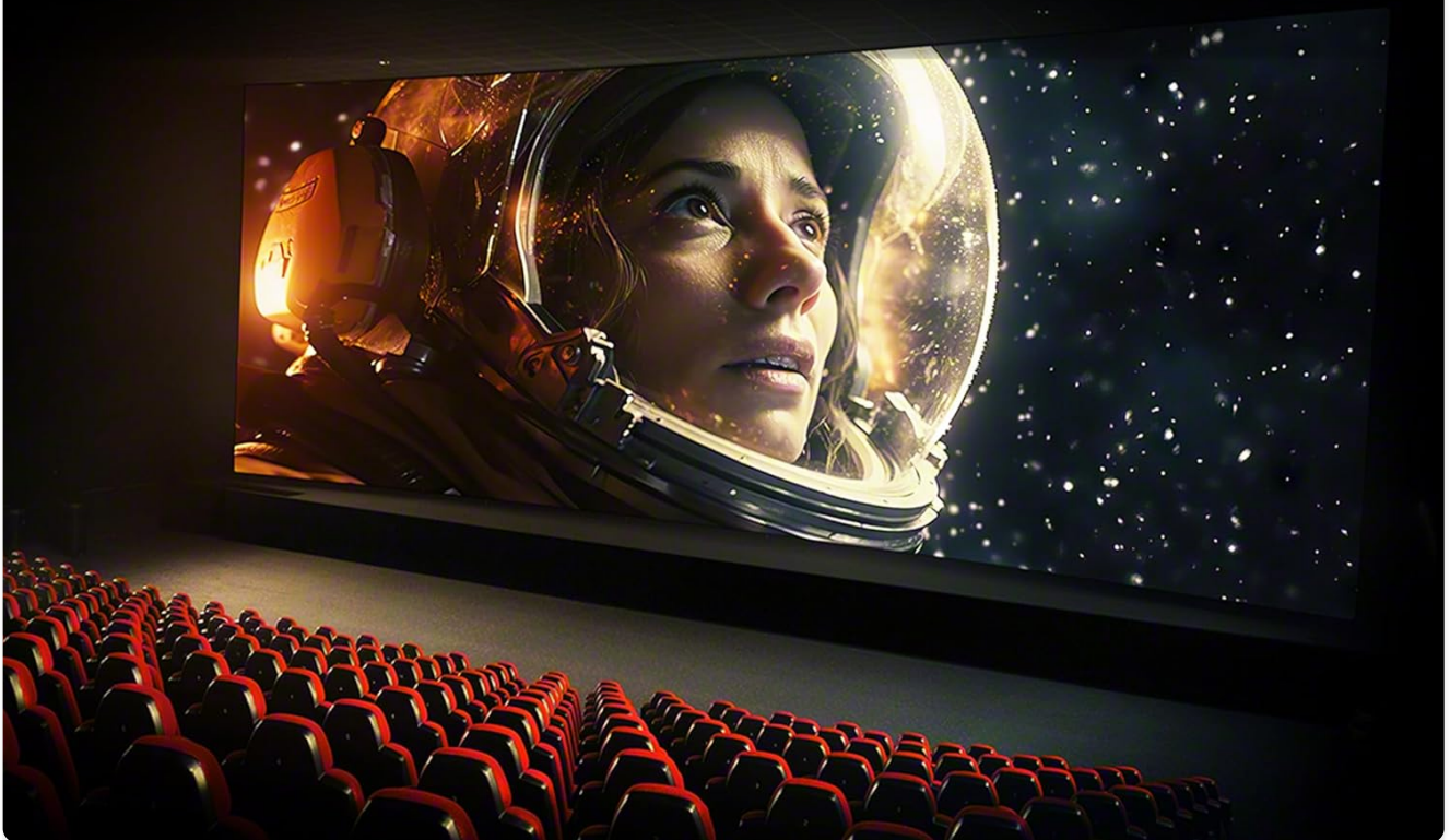
Figure 5: Visual comparison demonstrating Triluminos Pro color accuracy.