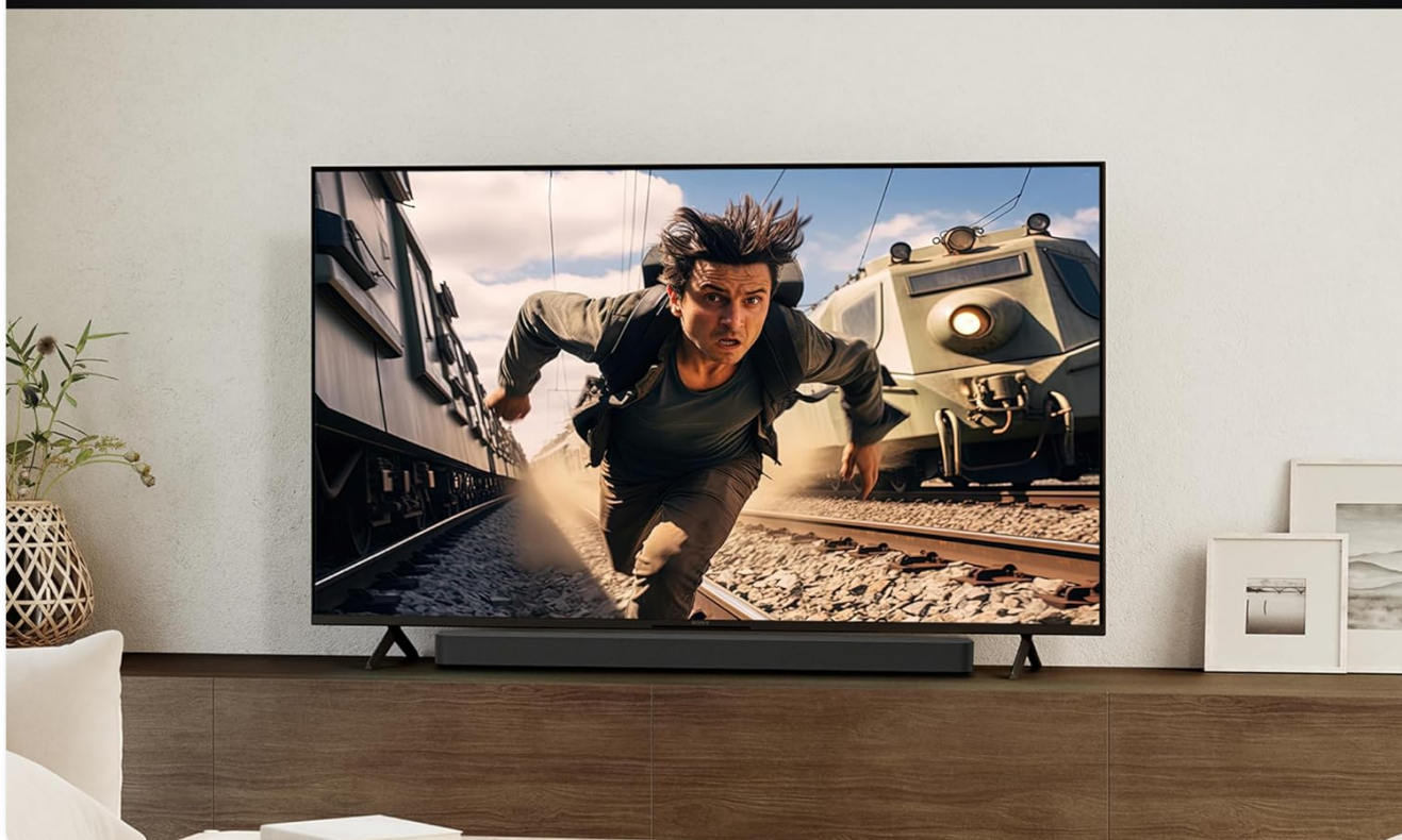
Figure 7: X-Balanced Speaker and Dolby Atmos audio features.

Control soundbar settings in the TV's menu, and easily adjust volume and sound settings with a single remote.