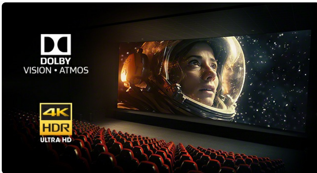
Figure 8: PlayStation 5 features on the Sony BRAVIA TV.