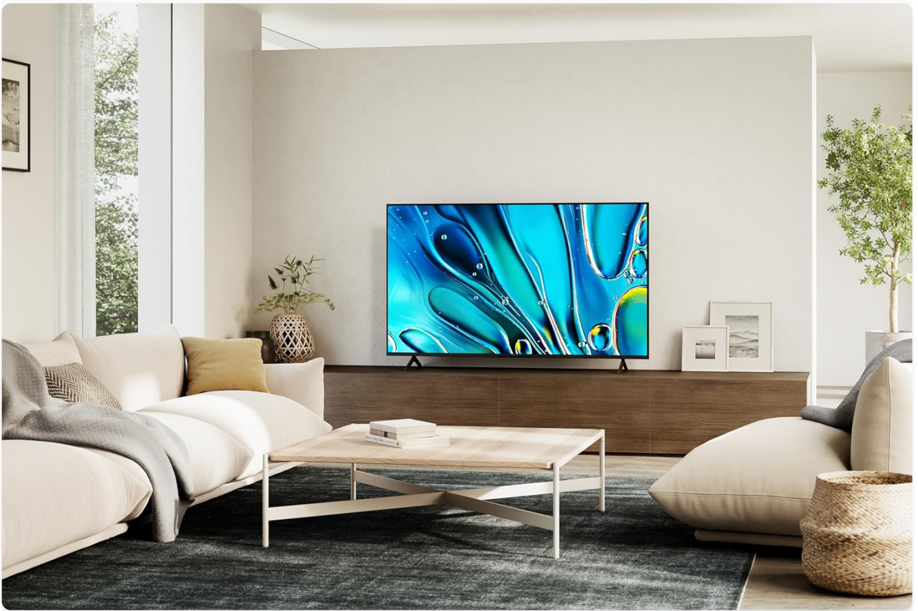
Figure 6: Enhanced cinematic experience with 4K HDR, Dolby Vision, and Dolby Atmos.