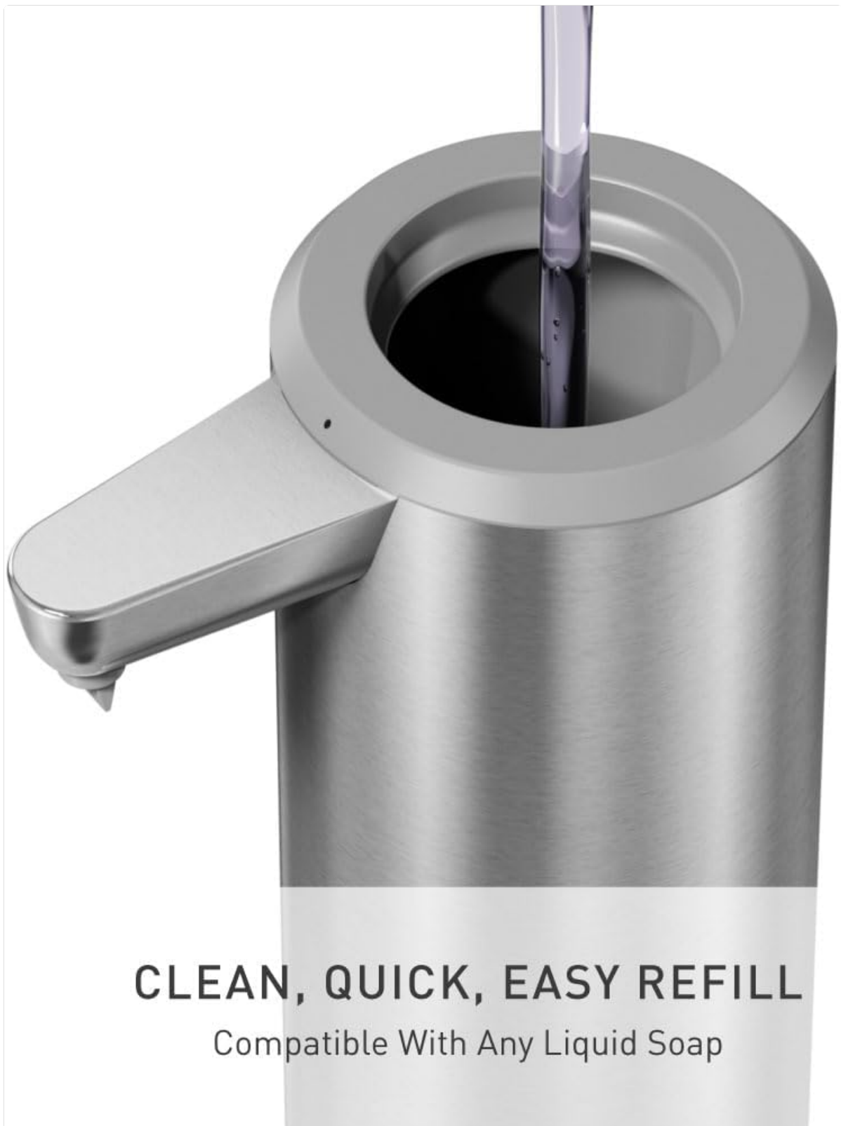
Image: A close-up view of the sensor pump's wide opening as it is being refilled with liquid soap.