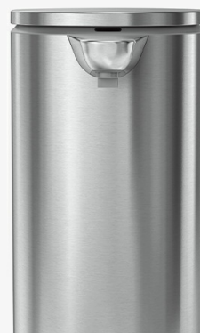
Image: Demonstrates the touch-free and germ-free dispensing of soap from the sensor pump.

When dispensing, the flexible silicone valve springs open for a quick, steady flow, then snaps shut to create a seal preventing messy drips.