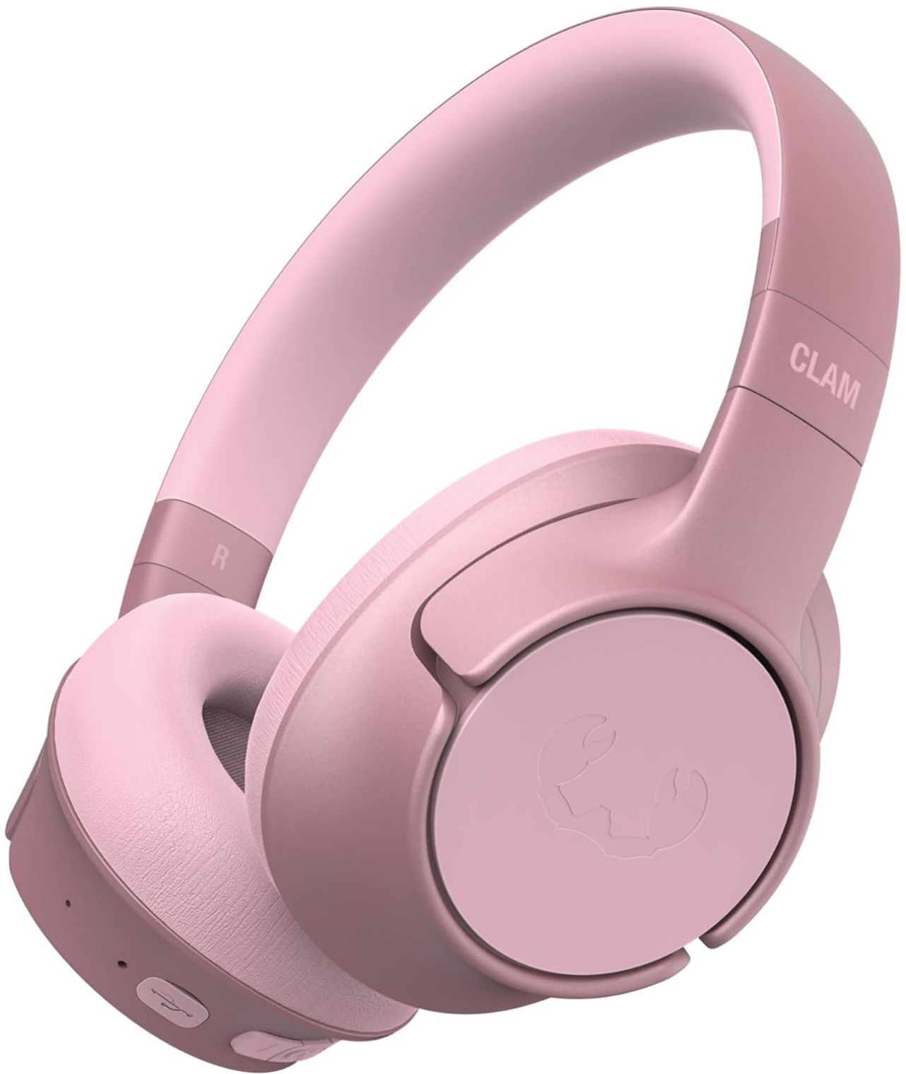
Image: Front view of the Fresh 'n Rebel Clam Fuse headphones in Pastel Pink.