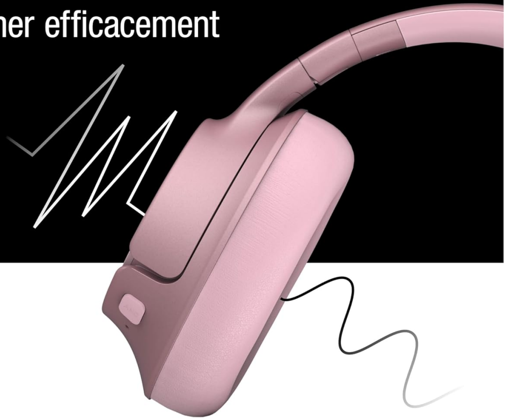
Image: Visual representation of Hybrid Active Noise Cancellation on the Clam Fuse headphones.