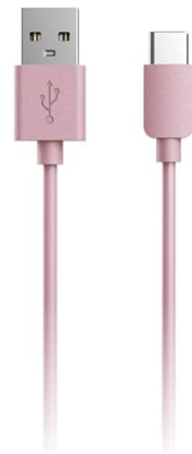
Image: All items included in the Fresh 'n Rebel Clam Fuse retail box.