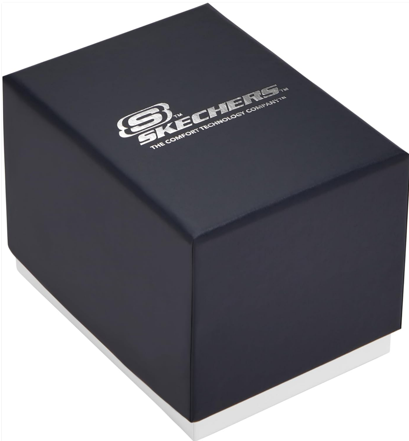
Figure 2.1: The Skechers watch box, indicating the product's original packaging.