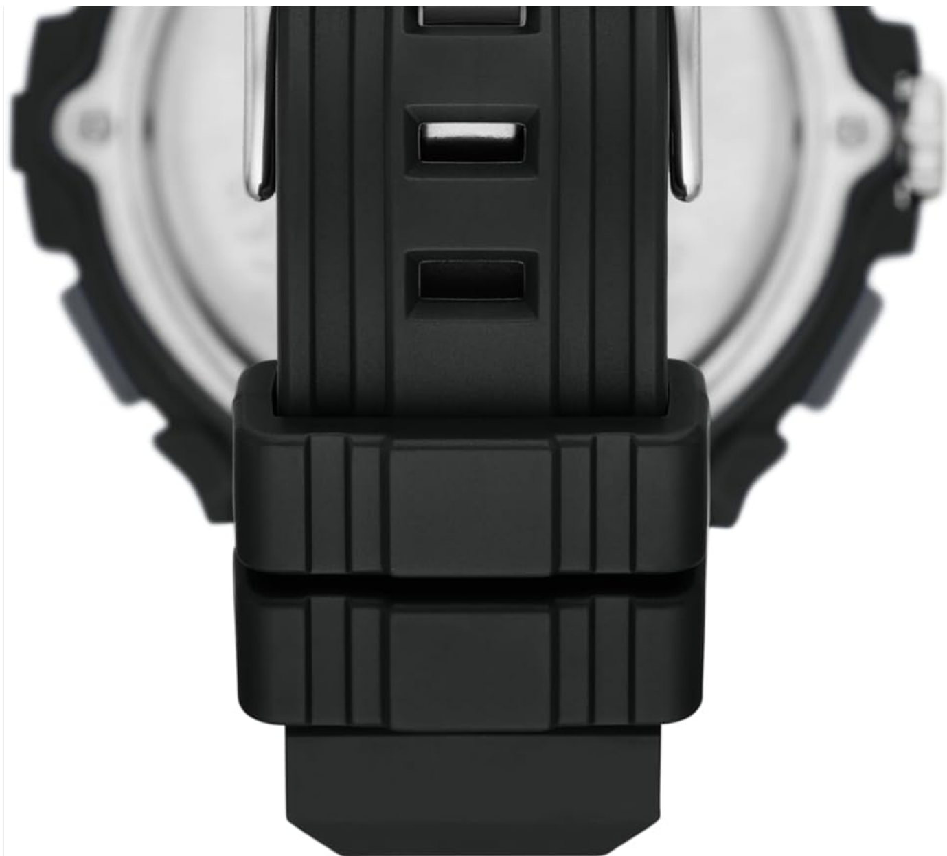
Figure 4.1: Rear view of the Skechers Hinsdale watch, showing the stainless steel case back and the buckle mechanism of the polyurethane strap. Regular cleaning of these areas is recommended.