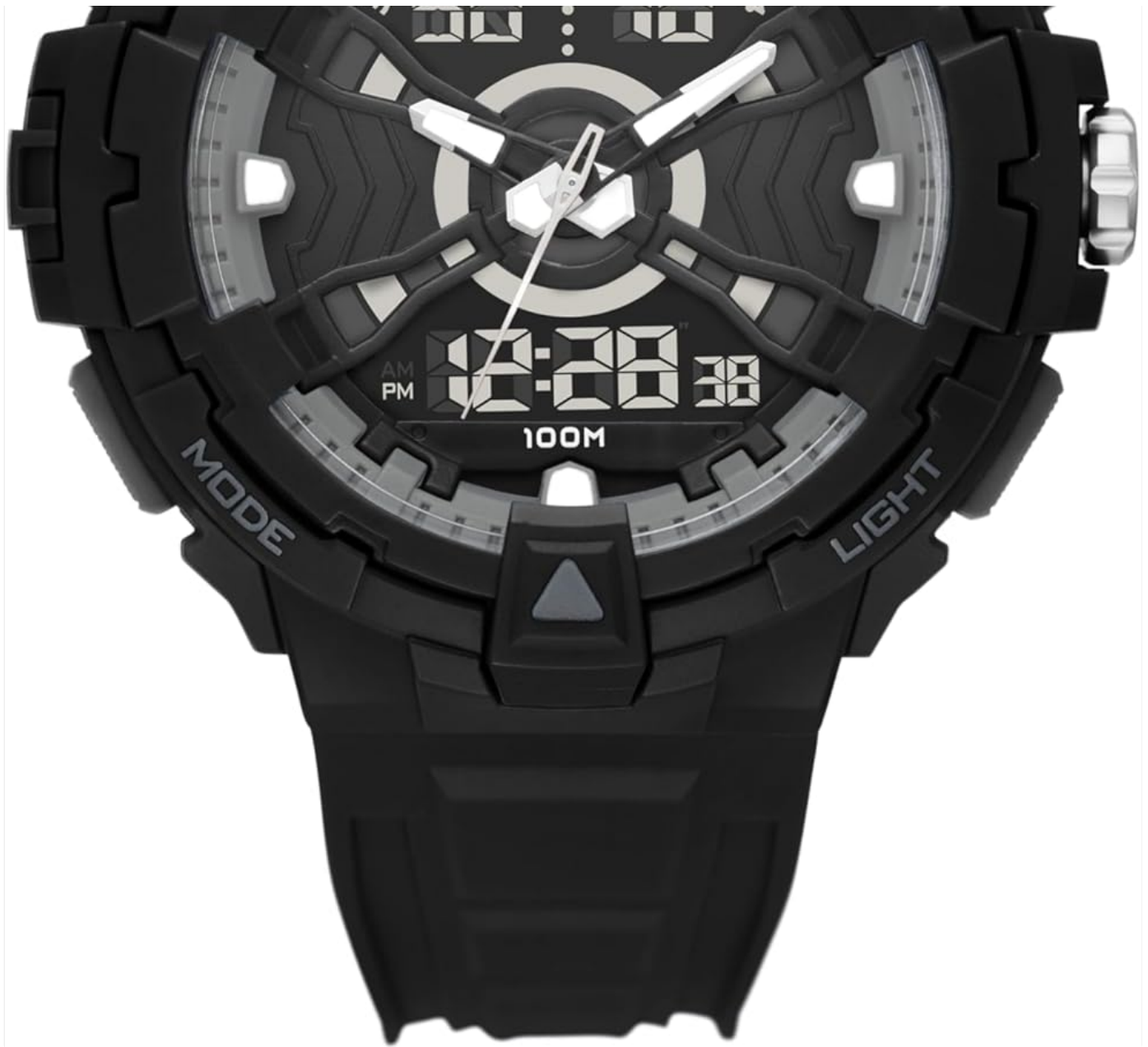
Figure 1.1: Front view of the Skechers Hinsdale Ana-Digi Watch, showcasing its black polyurethane strap, large case, and combined analog and digital display.