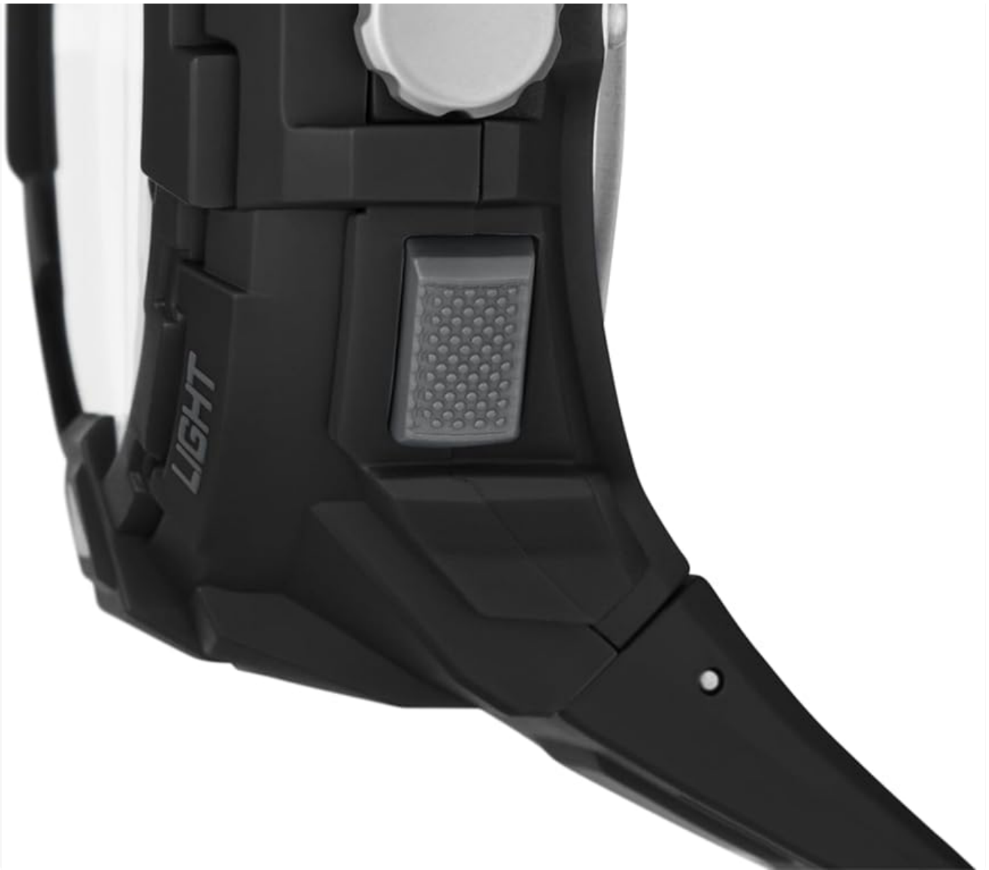
Figure 3.1: Side view of the Skechers Hinsdale watch, highlighting the "ST/STP" (Start/Stop) and "LIGHT" buttons on the right side, and "RESET" and "MODE" buttons on the left side. The crown for analog time adjustment is also visible.