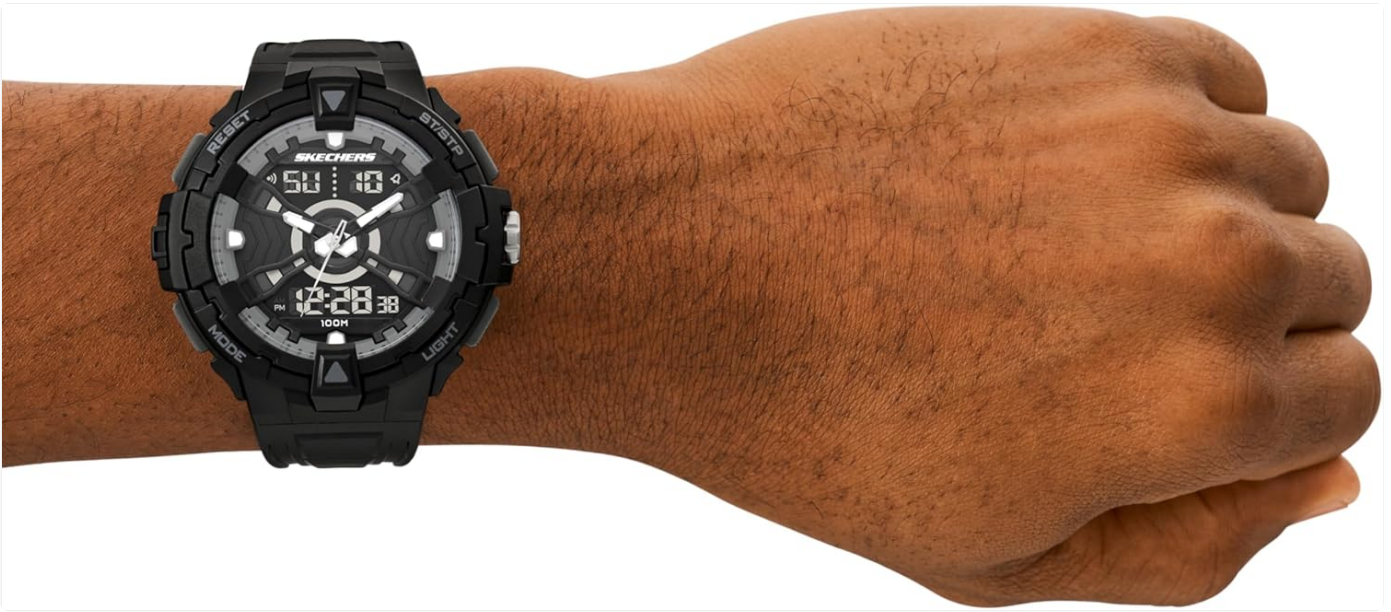
Figure 2.2: The Skechers Hinsdale watch worn on a wrist, demonstrating its size and fit.