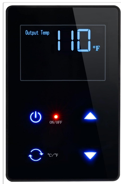
Figure 4: Wired Remote Control. This image displays the digital remote control unit, featuring buttons for power, temperature adjustment, and unit selection (Celsius/Fahrenheit).