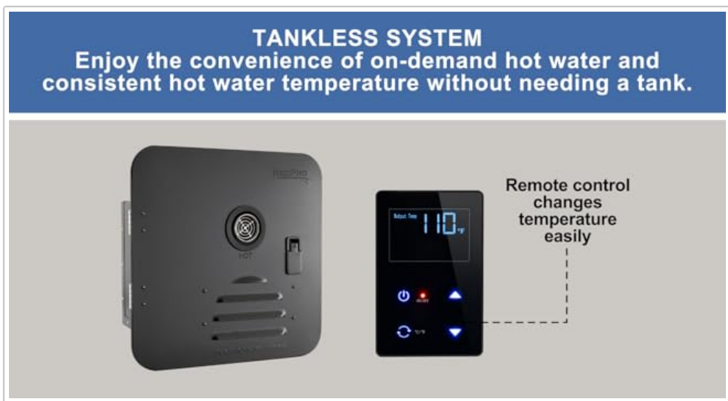
Figure 5: Tankless System Operation. This image demonstrates how the remote control interacts with the tankless water heater to easily adjust temperature settings, highlighting the on-demand hot water feature.

The unit features a low water flow startup, ensuring efficient operation even with minimal water demand. Electronic gas modulation technology maintains a consistent hot water temperature.