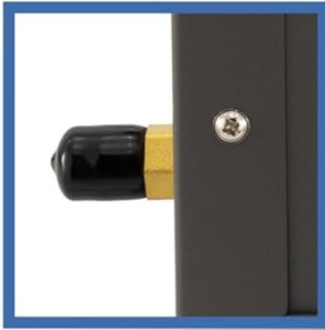
3/8" NPT Propane Fitting