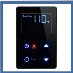
Convenient Water Heater Remote