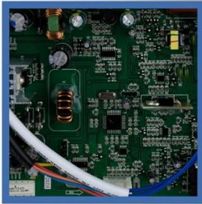
High Quality Control Board