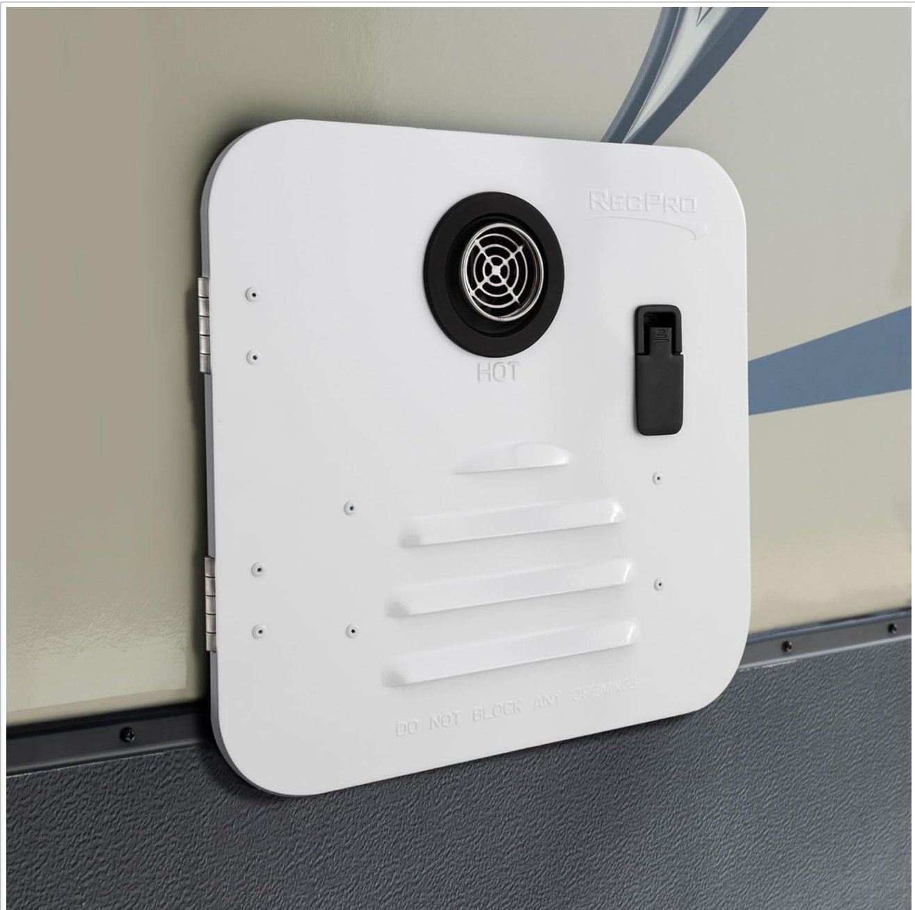
Figure 2: Installed Unit. This image shows the RecPro RV Tankless Water Heater properly installed on the exterior of an RV, demonstrating how the white door integrates with the vehicle's design.