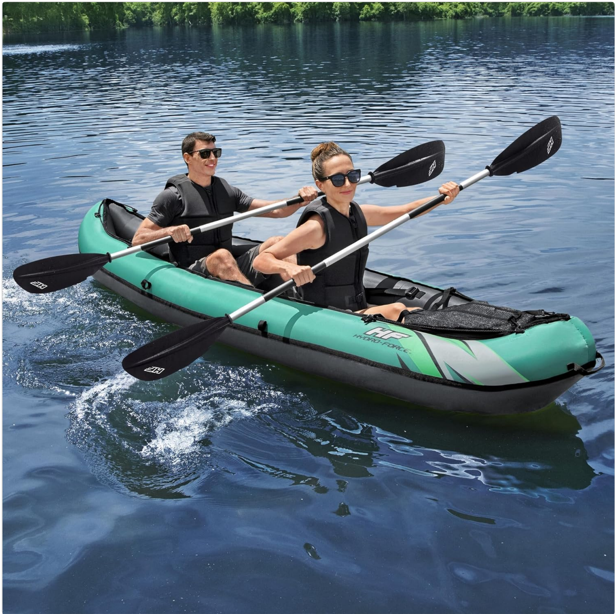
Image 3: Two individuals enjoying the HYDRO FORCE Ventura Elite X2 Kayak on a body of water, demonstrating its two-person capacity and use.