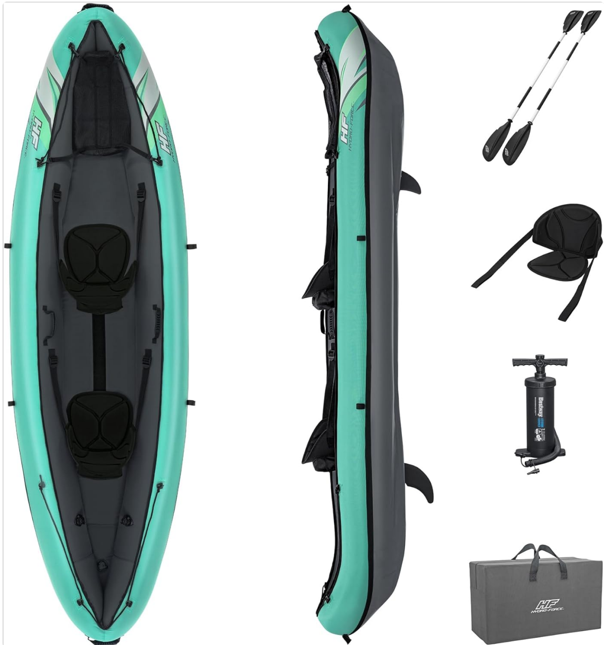
Image 1: All components included with the HYDRO FORCE Ventura Elite X2 Kayak. This includes the main kayak body, two aluminum paddles, a hand pump, two removable fins, two adjustable seats, a carry bag, a removable storage bag, and a repair patch.