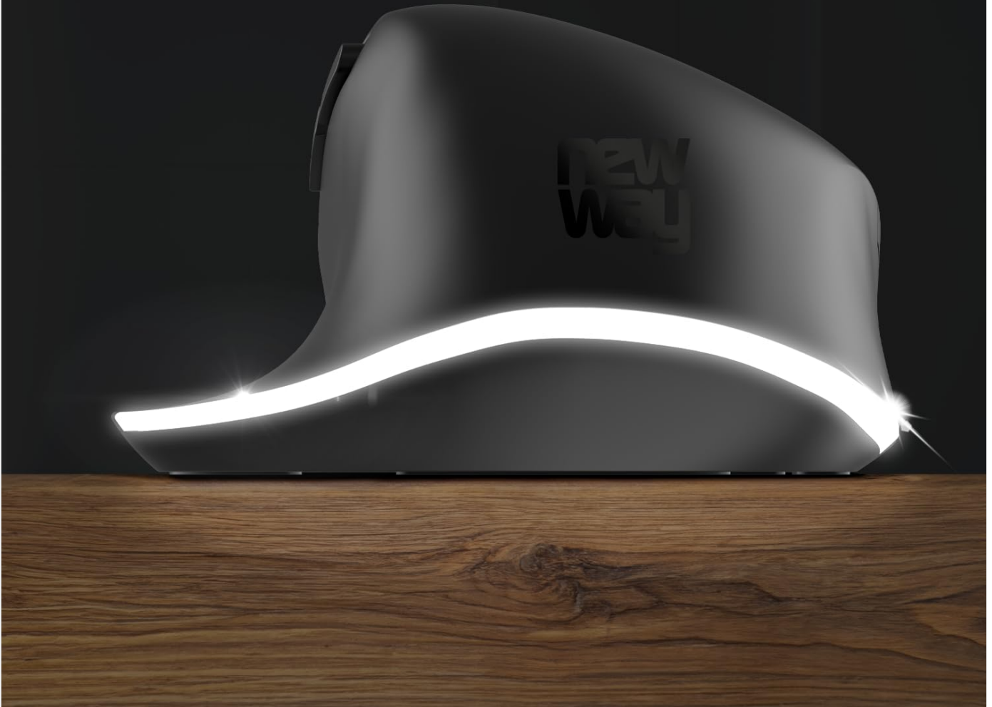
Image 6: White LED Backlighting. The NEWWAY A8BK vertical mouse illuminated by its subtle white LED backlighting, adding a stylish touch to the device.