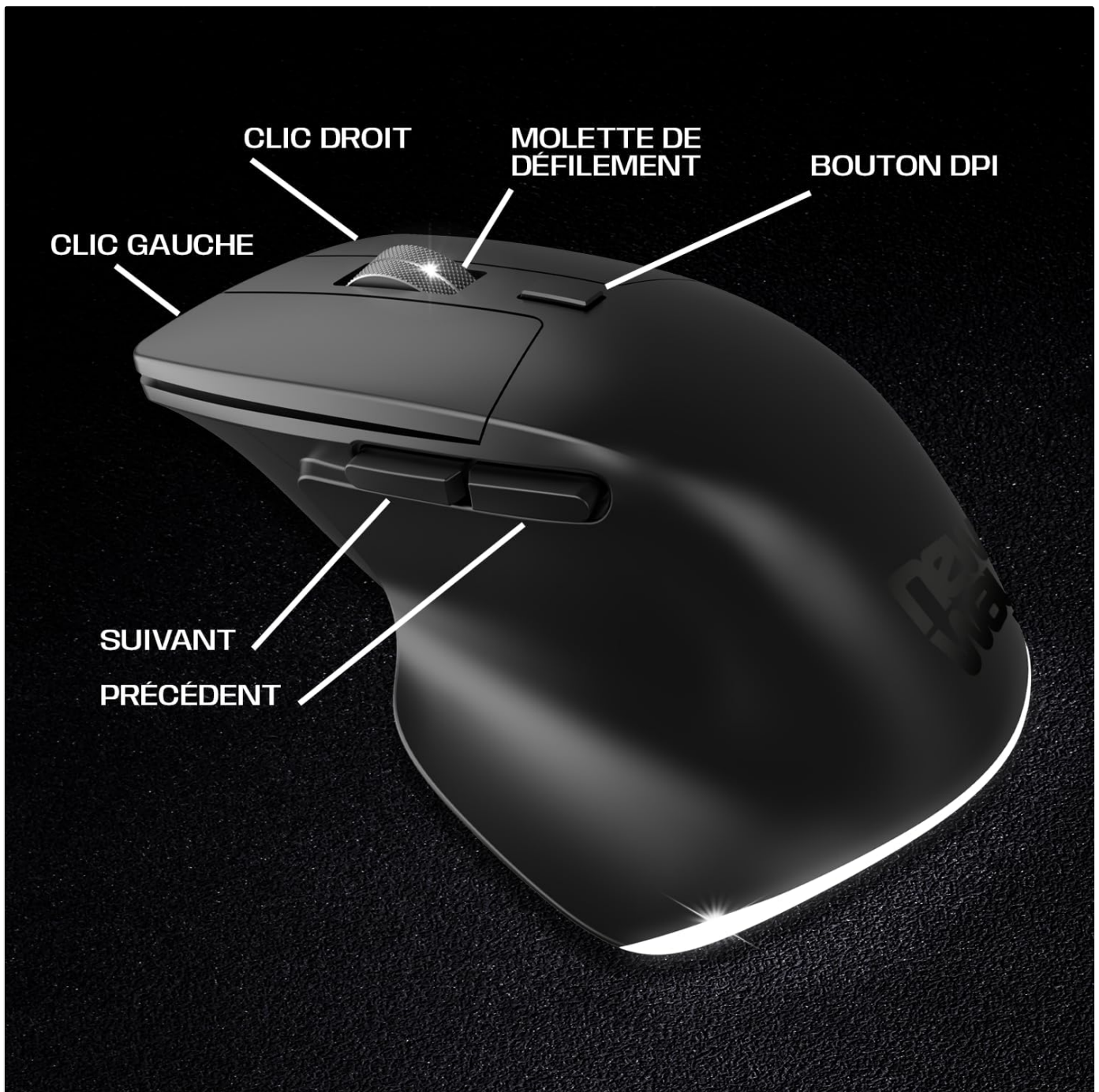
Image 1: Mouse Button Layout. This diagram illustrates the functions of each button on the NEWWAY A8BK vertical mouse, including left and right click, scroll wheel, DPI adjustment button, and side buttons for navigation.