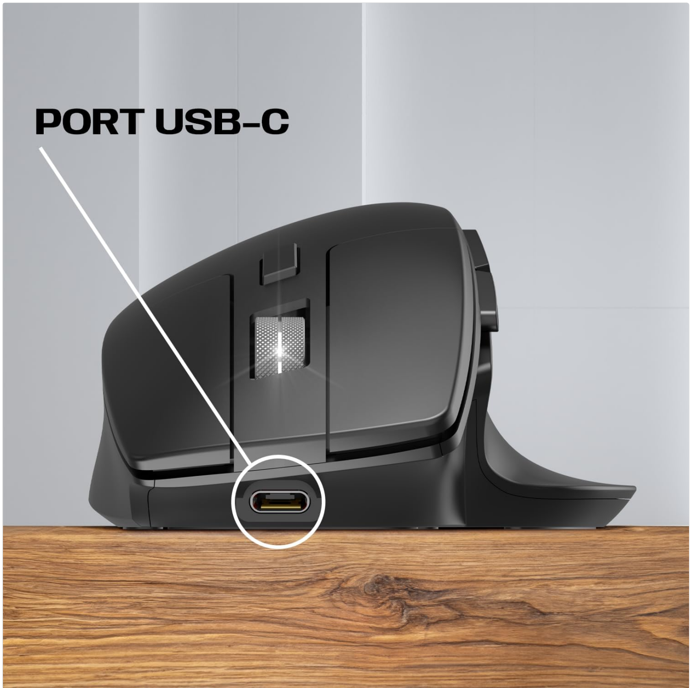
Image 3: USB-C Charging Port. A close-up of the USB-C port on the front of the NEWWAY A8BK vertical mouse, used for charging the internal battery.