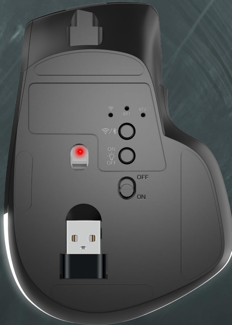
Image 2: Underside of the Mouse. The bottom of the NEWWAY A8BK vertical mouse, displaying the power switch, connectivity mode switch (Bluetooth/2.4GHz), and the magnetic storage slot for the USB receiver.