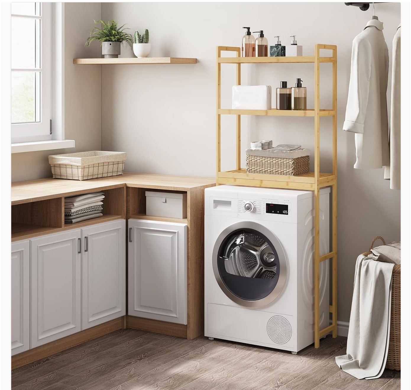
Figure 3: Shelf positioned over a washing machine.