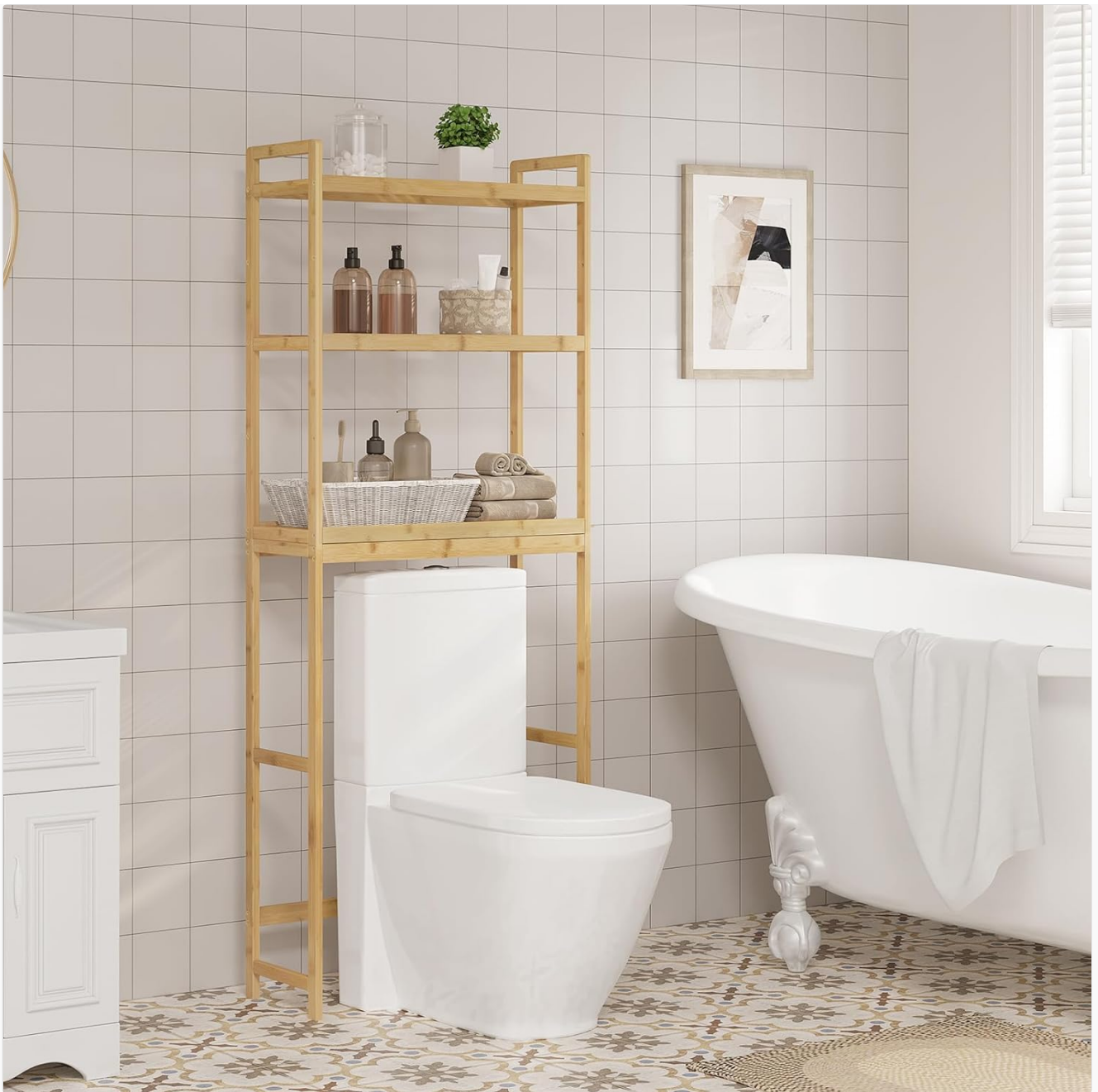
Figure 4: Shelf positioned over a toilet.