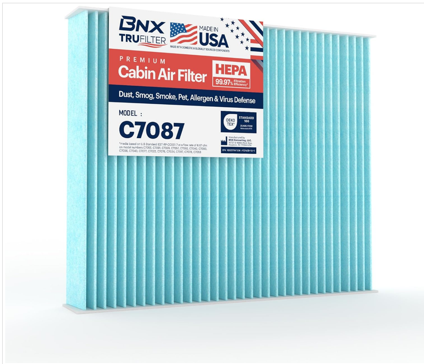
Image: BNX TruFilter C7087 Cabin Air Filter, highlighting its HEPA filtration and Made in USA branding.