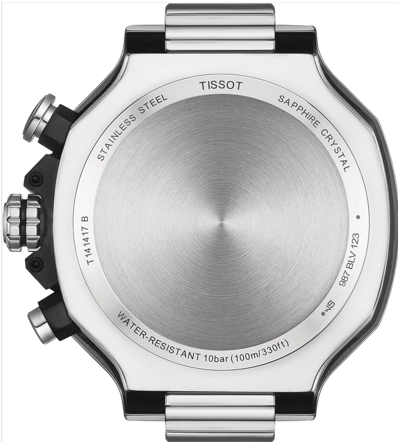
Image: Rear view of the Tissot T-Race Chronograph watch case, displaying the water resistance rating and other engravings.