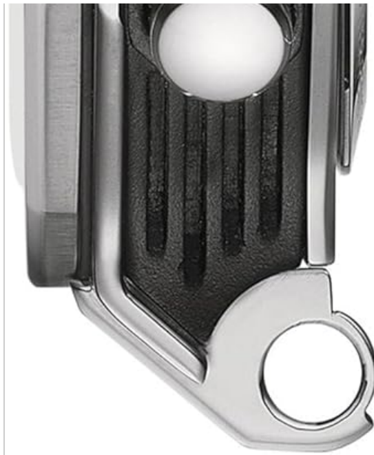
Image: Side view of the Tissot T-Race Chronograph watch, highlighting the crown and chronograph pushers for time and function adjustments.