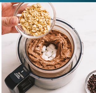
Ajoutez vos extras favoris