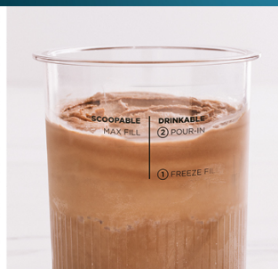
Congelez pendant 24 heures