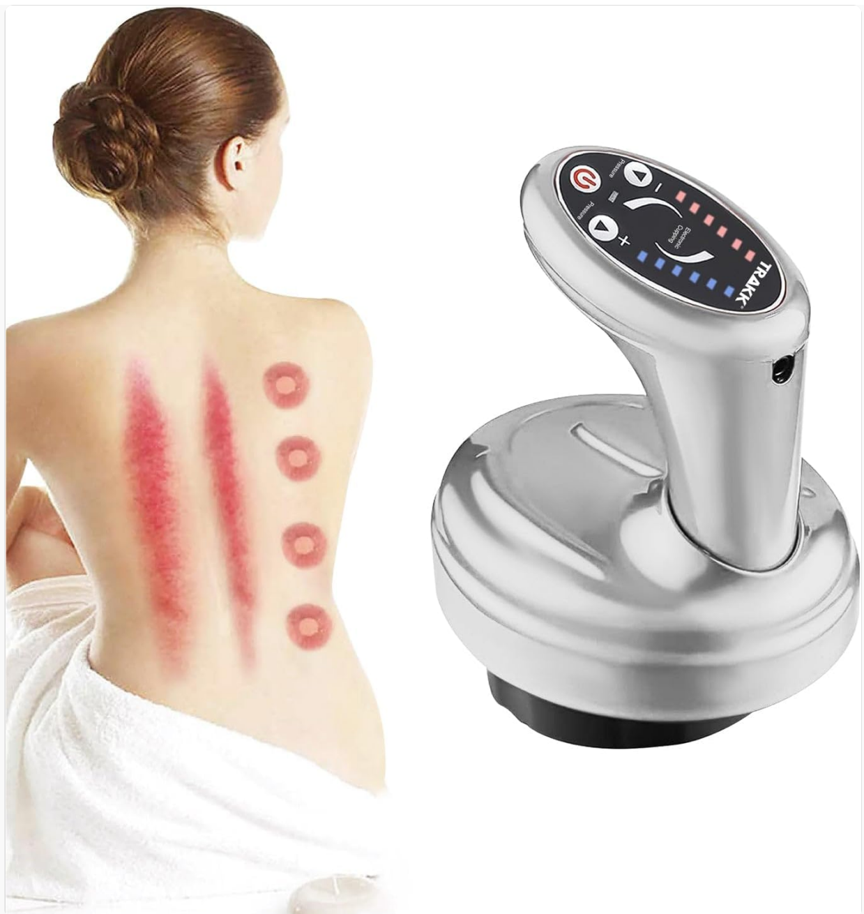
Image: The TRAKK device positioned next to a person's back, demonstrating the typical marks left by cupping therapy, including linear scraping marks and circular suction marks.