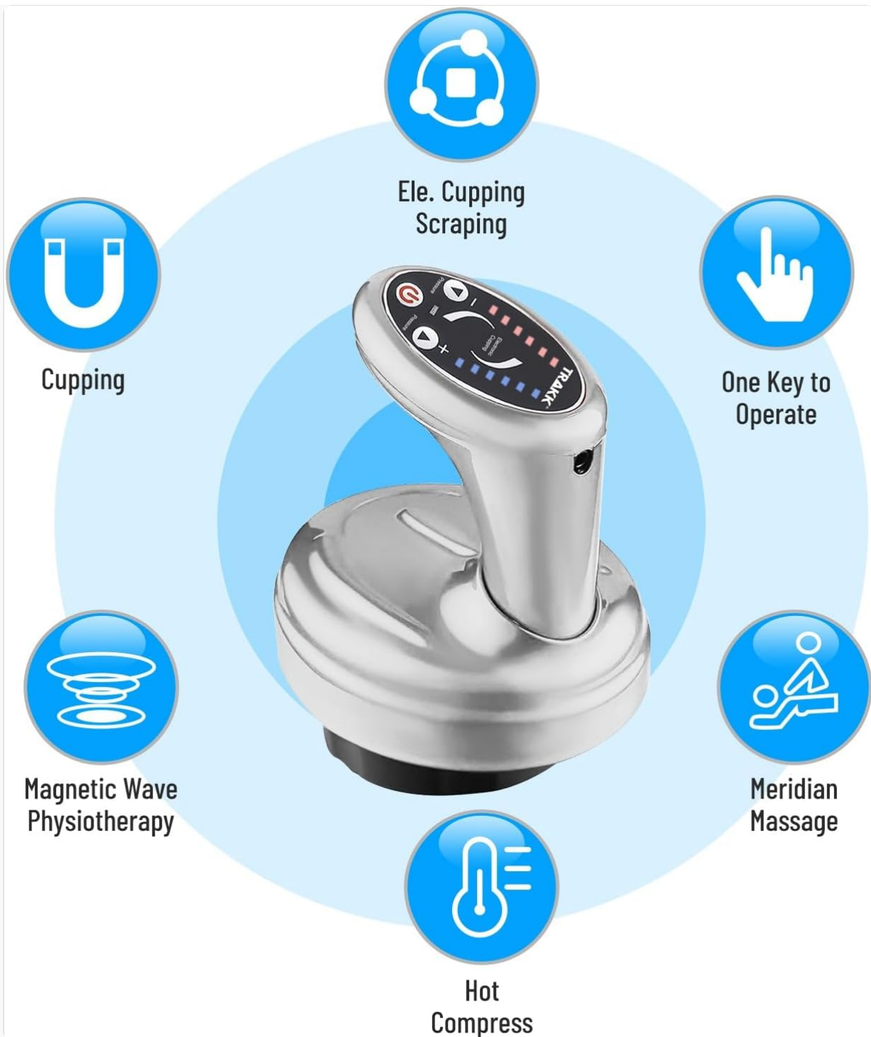
Image: A diagram illustrating the device's core functions: Electronic Cupping Scraping, One Key to Operate, Meridian Massage, Hot Compress, Magnetic Wave Physiotherapy, and Cupping.