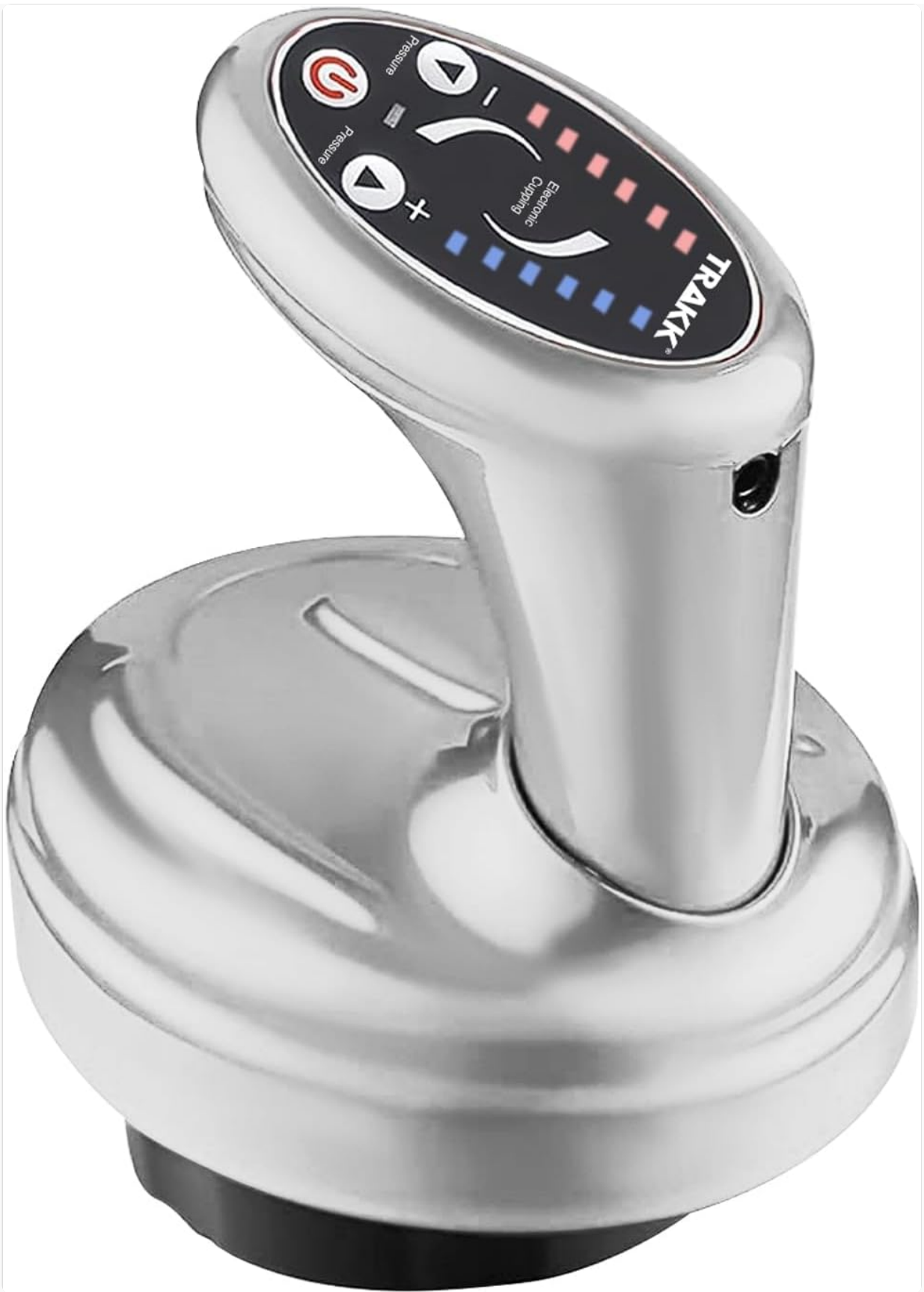
Image: The TRAKK Handheld Electric-Cupping Therapy Massage Device, a sleek, silver-colored unit with a black control panel featuring power, pressure, and temperature controls.