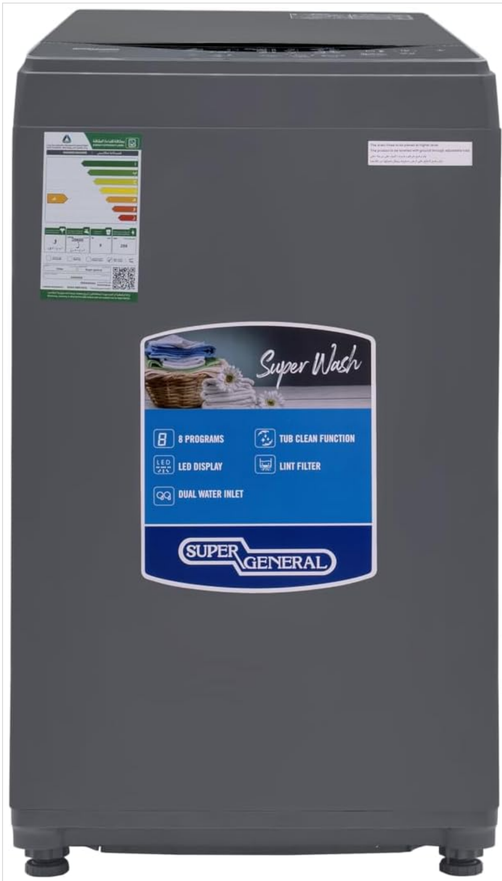
Figure 2.1: Front view of the washing machine, highlighting key features such as 8 programs, LED display, dual water inlet, tub clean function, and lint filter.