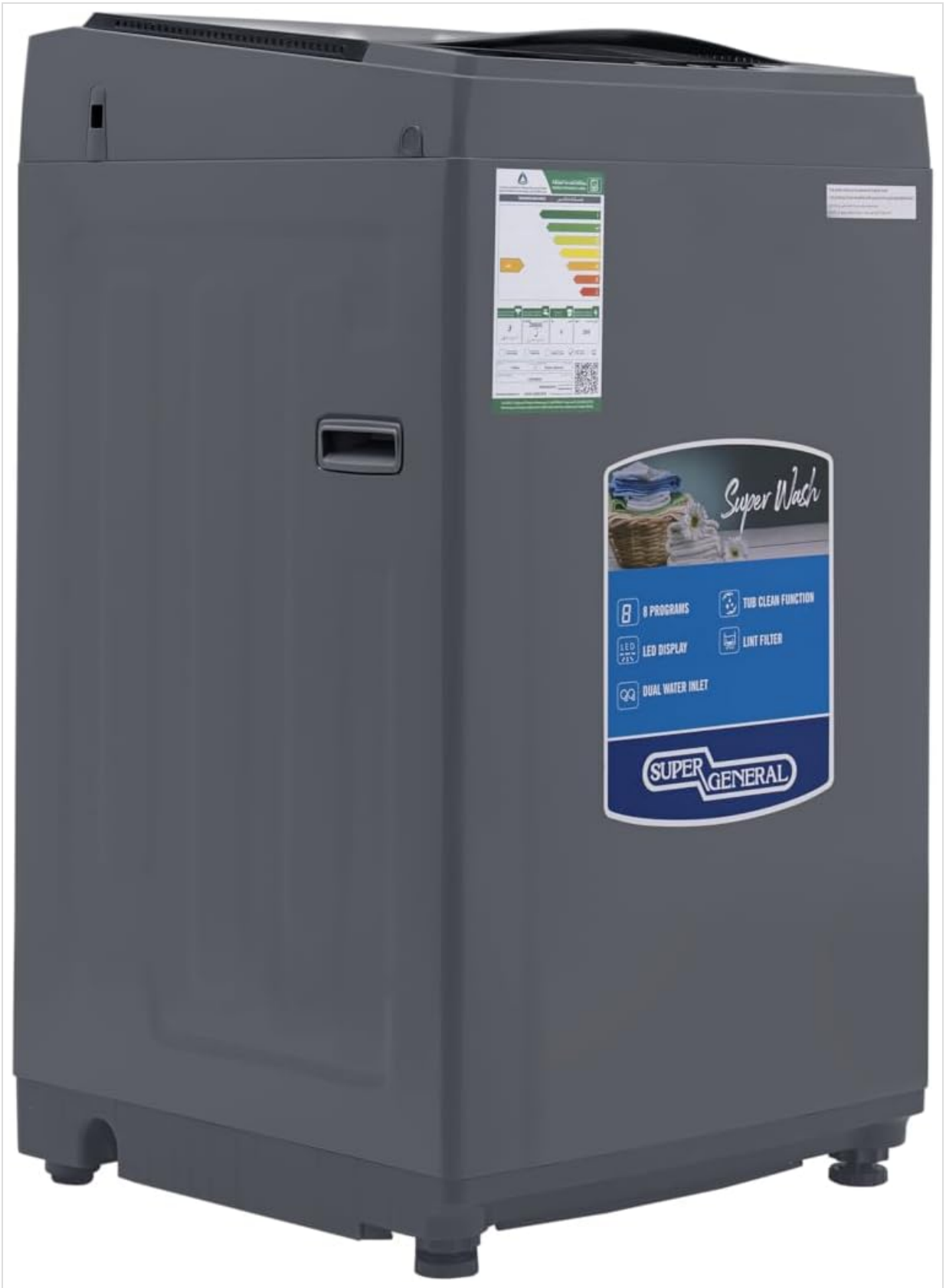
Figure 2.2: Angled front view of the washing machine, showing its compact design and silver finish.