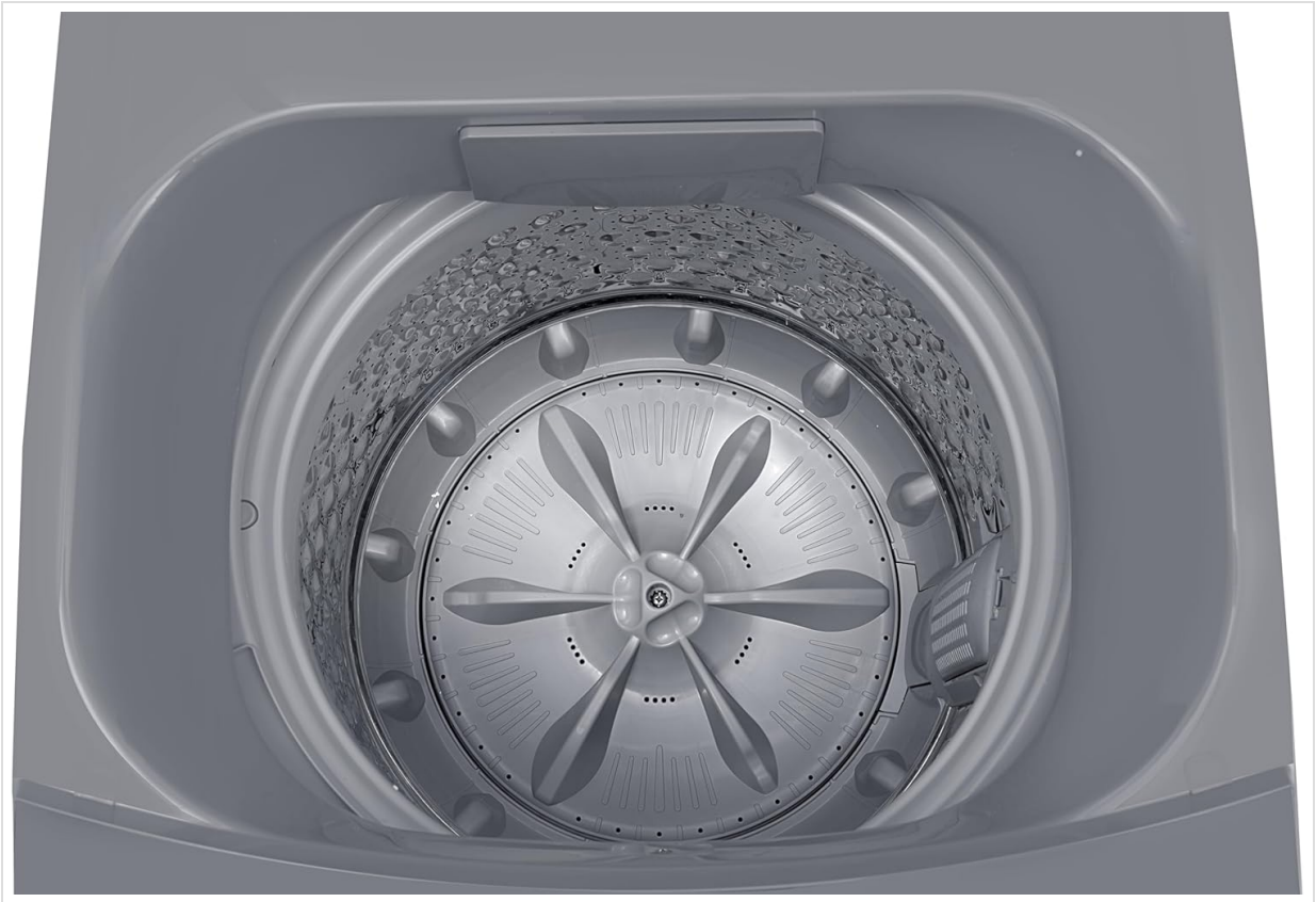
Figure 2.5: Top view of the washing machine with the lid open, revealing the drum opening for loading laundry.